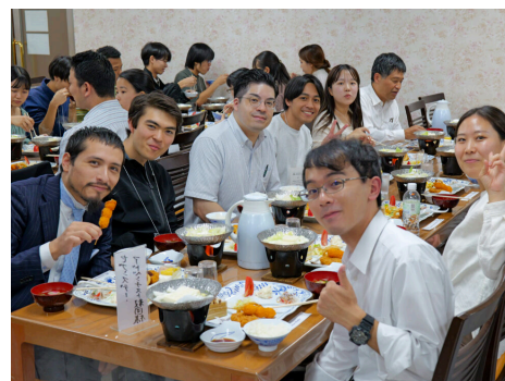
The participants enjoyed a delicious meal.

faith. Meeting peers who shared their beliefs was an uplifting and unforgettable experience for some, especially those from churches with few young members.