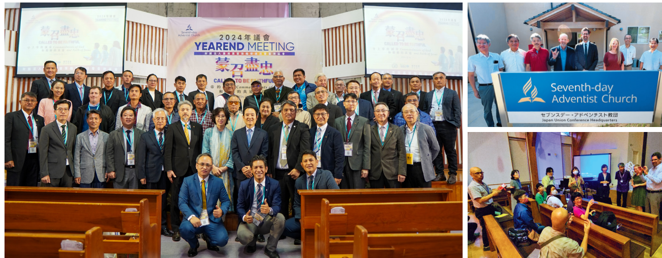
NSD leaders and TWC leaders together for the Year-End Meetings.

The Taiwan Conference Year-End Meeting officially began on Dec. 10, 2024. This year, the meeting adopted a new interview-style report format, incorporating videos and interactive Q&A sessions to create a more engaging atmosphere. Additionally, a special hymn session was introduced. Alongside reports from directors and department secretaries, key agenda items were actively discussed. As 2024 came to a close, challenges still lie ahead, and it is hoped that in the coming year, colleagues will continue to work together in unity to fulfill their mission.