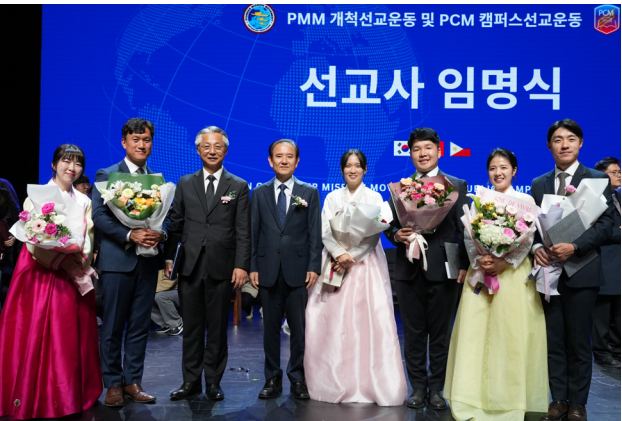
23rd batch of PMM with NSD leaders.