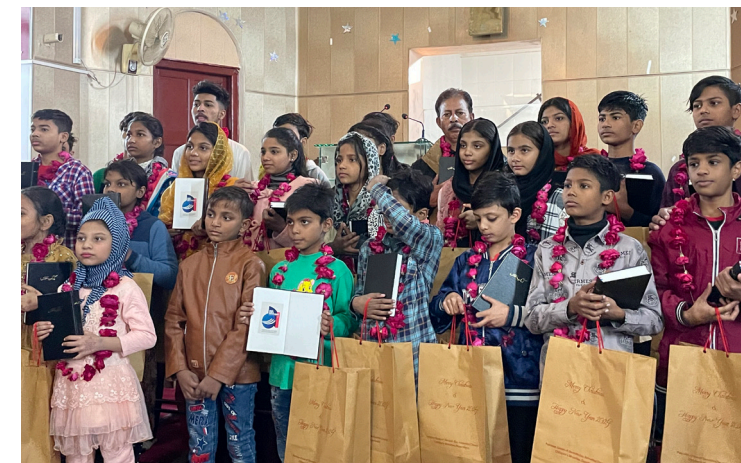
Newly baptized children attend the program.