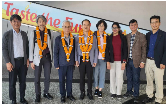
Nepal Section officers welcome NSD officers.