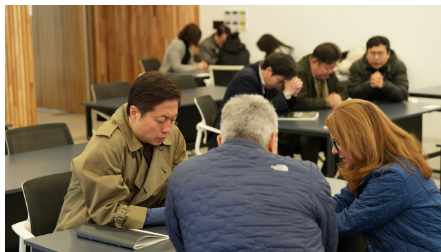
NSD members prayer in group.

A highlight of the week was the “Secret Prayer Friends” program. Throughout this period, they prayed for their chosen friend, focusing on their unique needs and seeking God’s guidance and blessings. Some participants