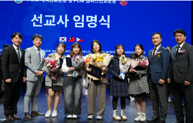
7th batch of PCM and NSD leaders.