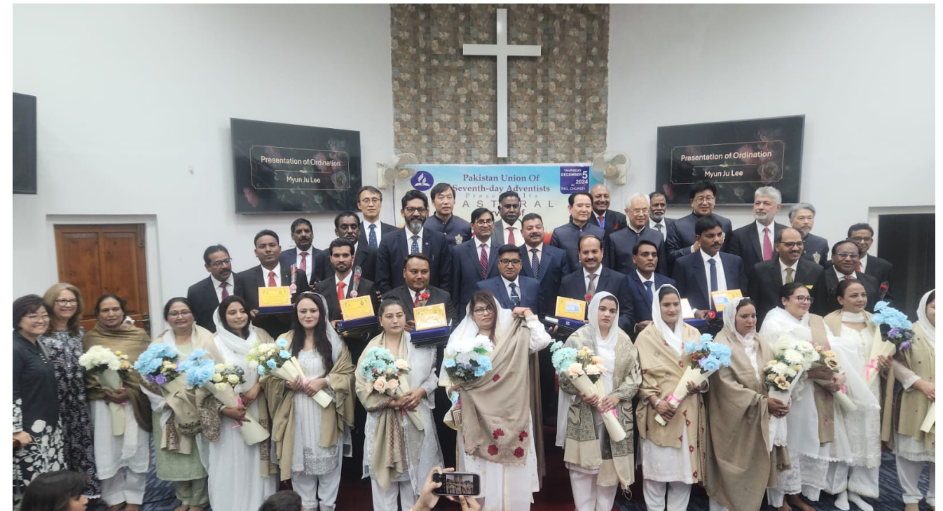
PKU held an ordination ceremony for 12 pastors.

On Dec. 5, 2024, the Pakistan Union Section held an ordination ceremony for 12 pastors, marking a milestone in their spiritual and ministerial journeys.