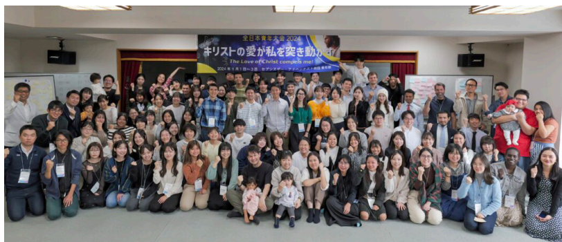
More than 100 young people gathered for JUC Youth Congress.

On Nov. 1-3, 2024, the Japan Union Conference (JUC) Youth Congress occurred in Chiba Prefecture, marking its return after nine years. Though there were concerns about participation due to the long gap, more than 100 young people from across the country gathered for three days of spiritual growth and fellowship.