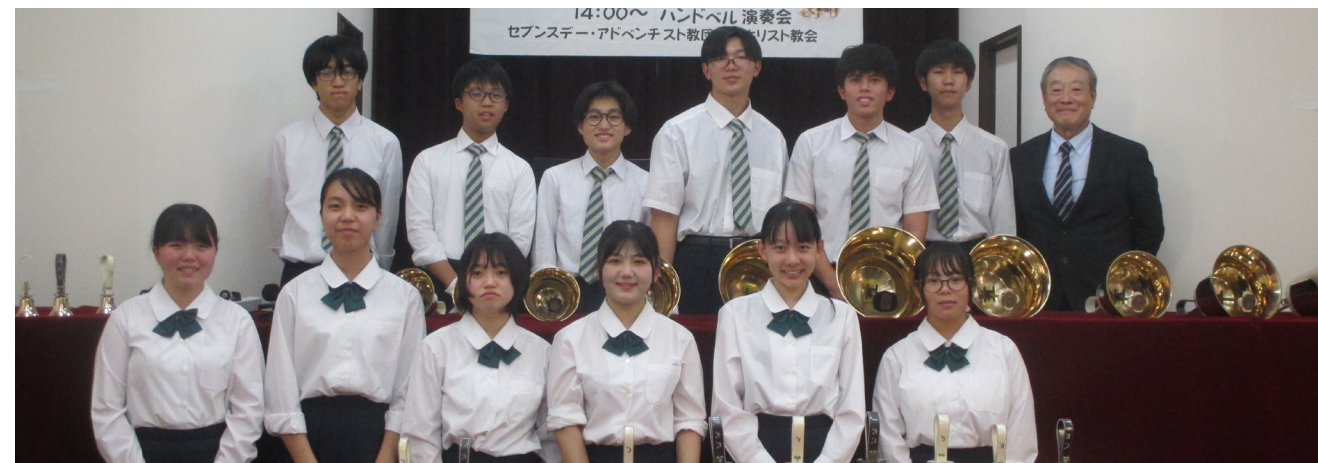
Hiroshima Saniku Gakuin High School Handbell Choir

On Nov. 23, 2024, the Handbell Choir from Hiroshima Saniku Gakuin High School, visited Imabari Seventh-day Adventist Church for a special concert. Twelve students and three teachers participated, delivering a heartfelt and inspiring performance for the attendees.