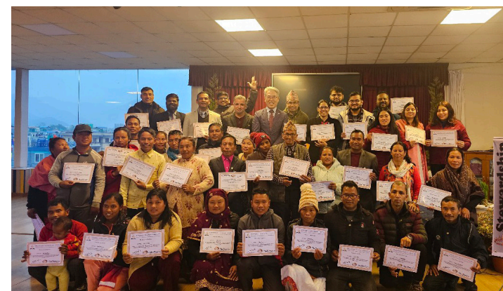
50 participants received certificates for completing the training session.