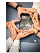
On the Cover Hands of NSD staff encircle The Ten Days of Prayer.

The mission of the Northern Asia-Pacific Division of Seventh-day Adventists is to call all people within its territory to become disciples of Jesus Christ, to proclaim the everlasting gospel embraced by the Three Angels’ Messages (Revelation 14:6-12) and to prepare them for Christ’s soon return.