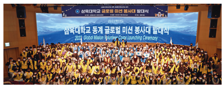
2022 Global Mission Volunteer Corps Launching Ceremony at Samyook University.