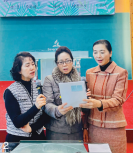
1. Participants of Korea Adventist Women's Association(KAWA)'s dedication service. 2. A Special Song for the meeting.