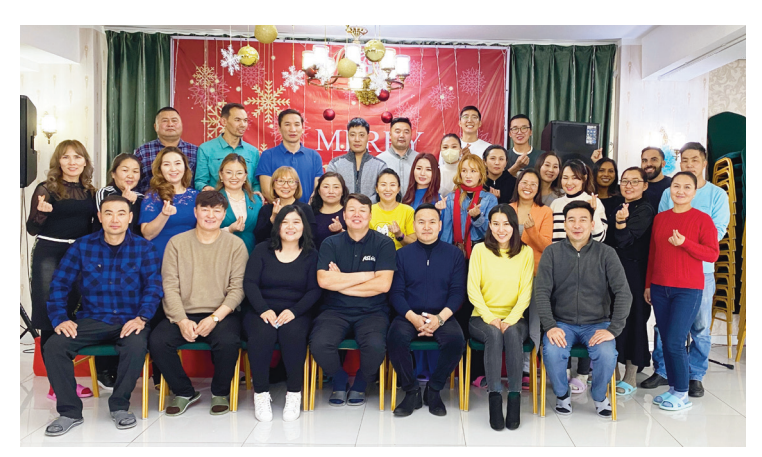
Members of the Mongolia chapter of ASi.

At the second session, each participant had a chance to share their experience in running their businesses. A heart-toheart talk followed with attendees encouraged by one other's