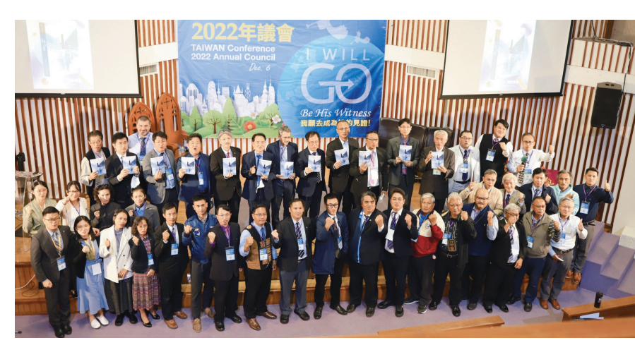
TWC Yearend Meeting delegates chant "I Will Go"

During COVID-19, TWC's traditional ways of ministry were not useful in many cases, but God helped us to find new, and more modern ways to preach the gospel. It is by God's grace that TWC's online ministries allowed us to keep sharing Jesus with people and to learn that God can do His work anytime and anywhere.