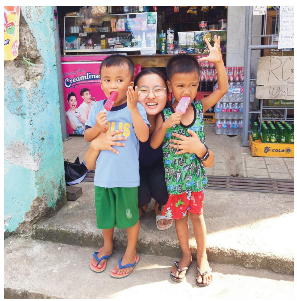
A missionary's joy in serving children

"For so the Lord has commanded us: 'I have set you as a light to the Gentiles, that you should be for salvation to the ends of the earth" (Acts 13:47).