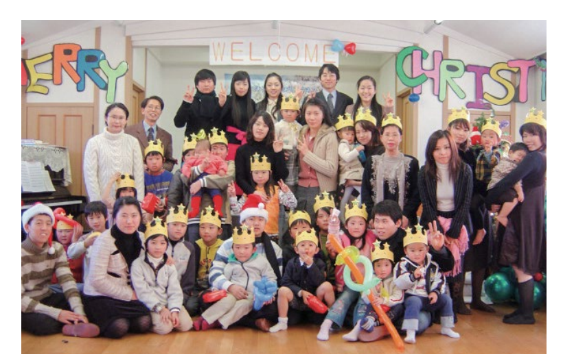
Children of Saga Church, Japan.

Once again, congratulations on PMM's 20th anniversary. I pray for God's unending guidance and power for this movement. Let's keep marching forward as missionaries!