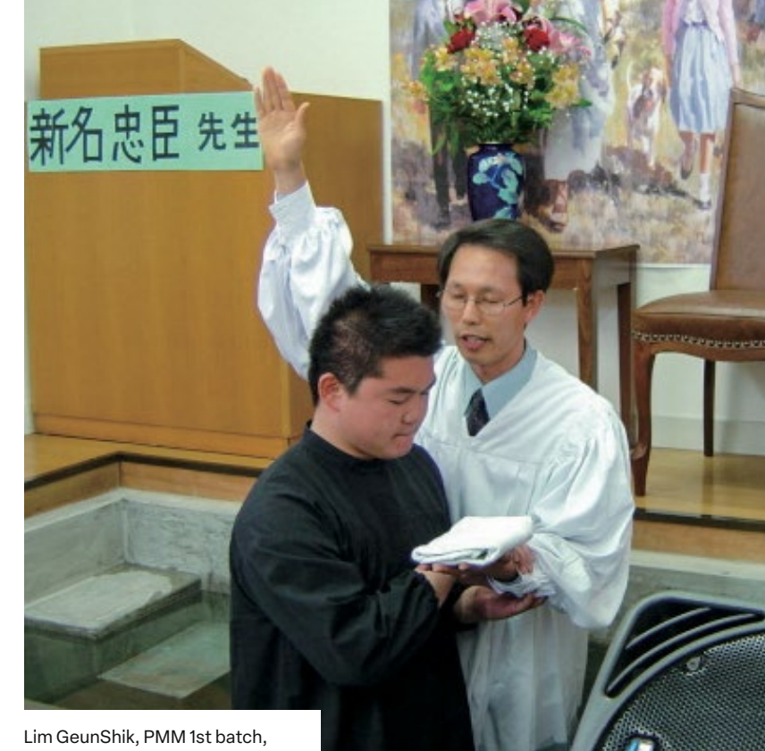
serving the Saga Church for six years, baptizes his church member.

I remember my years in Japan as if it were yesterday, but Pioneer Mission Movement celebrated twenty years of successful execution