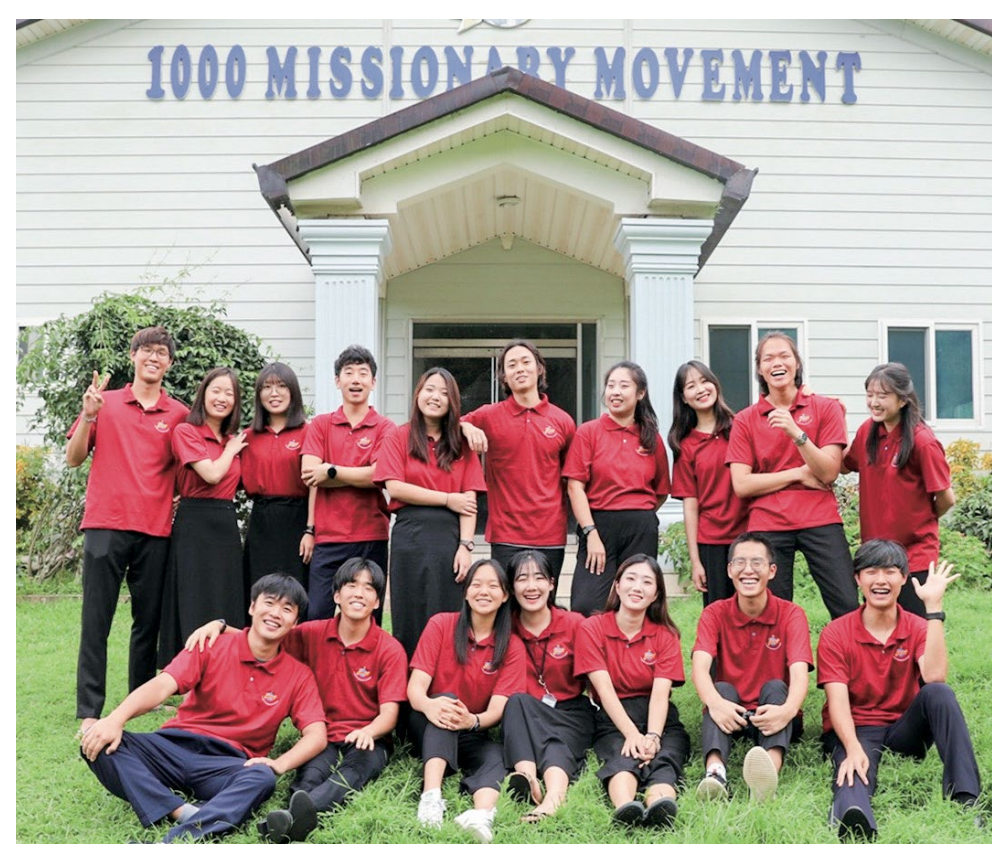
The 55th batch of 1000MM missionaries.

About seven months after the training started, missionaries began to be dispatched. My mission field was a village called Saimsim, in the Philippines. This place, which seemed to be far away from the influence of the pandemic, was also not safe, and news of the pandemic came to the peaceful village. I heard that there was a person with COVID in a family where my partners and I had visited. We were very worried because it was only two days before that we had eaten and talked with them.