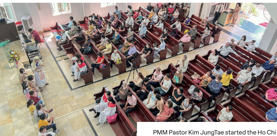
Minh International Church in 2019 and the church has grown with the second highest tithe.

There have been many fruits through these projects, On the Sabbath of May 28, 2022, there was a united baptismal ceremony in Lam Dong province—140 new members were born again in the name of Jesus Christ. Also, in the Dien Bien province, located on the Laos border in northwest Vietnam, 22 souls were baptized in May 2020 through the dedication of