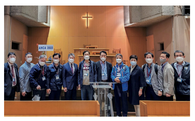
A group of AHCA members at Tokyo Adventist Hospital Church.

One of the highlights of the meetings were the reports from each hospital. They gave thanks and glory to God for the blessings and honor they have received. They shared their burdens and challenges in the past and how they pray and support each other. Most of the