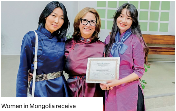
the certification of continuing education from Andrews University.

Women's Ministries develops the curriculum for leadership training and works with Andrews University in maintaining accreditation to provide graduates with valid certificates of continuing education credits in tertiary education. Andrews University of Berrien Springs, Mich., USA, is the flagship educational institution of the Seventhday Adventist Church.