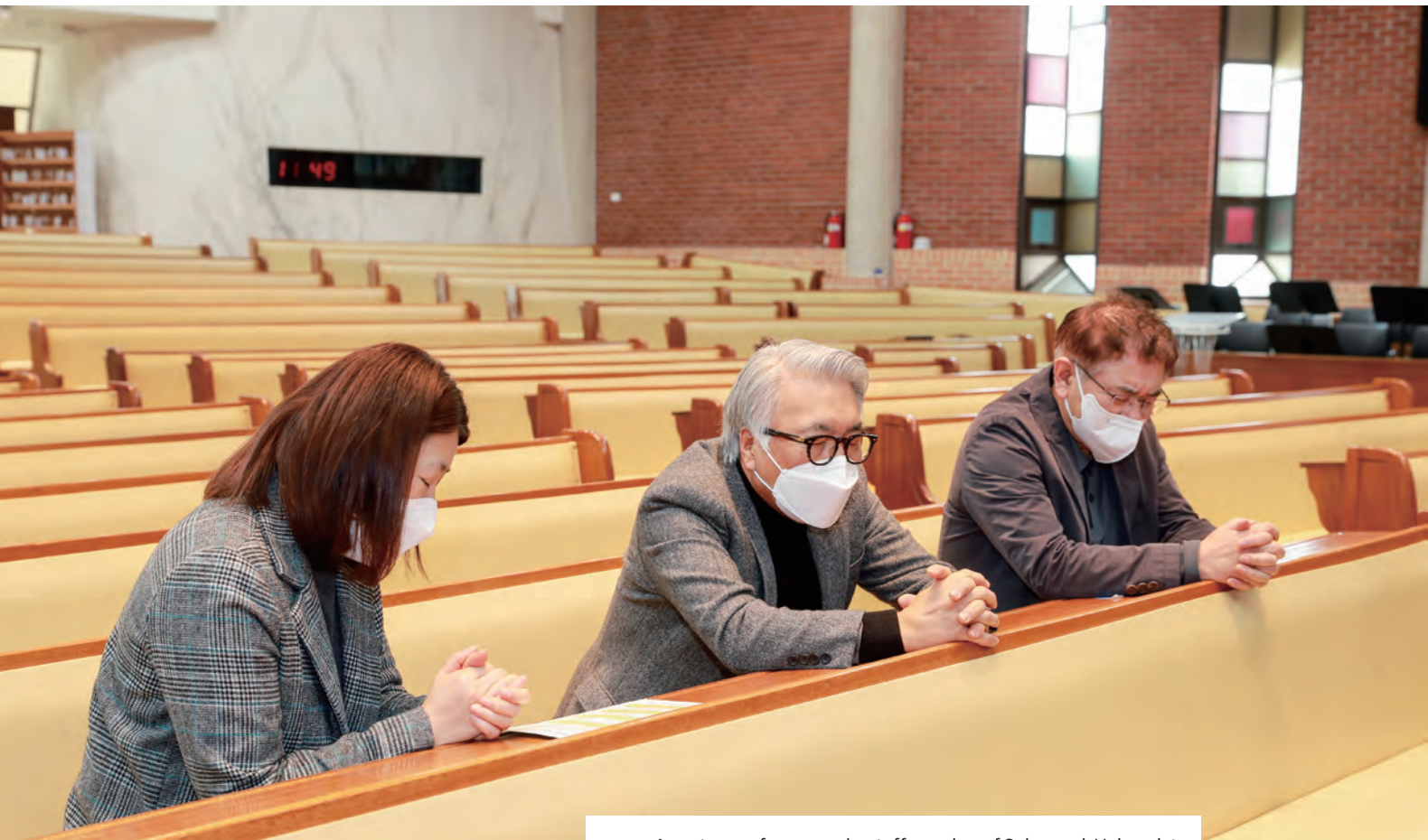
A pastor, professor, and a staff member of Sahmyook University participate in a special noon prayer movement.