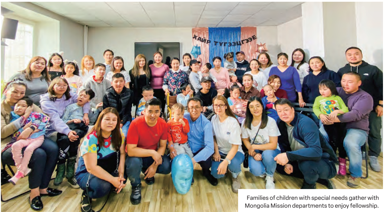
Families of children with special needs gather with Mongolia Mission departments to enjoy fellowship.