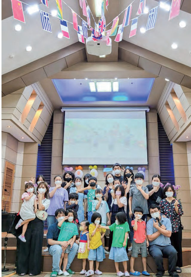
Summer Vacation Bible School at one of KUC's local churches.