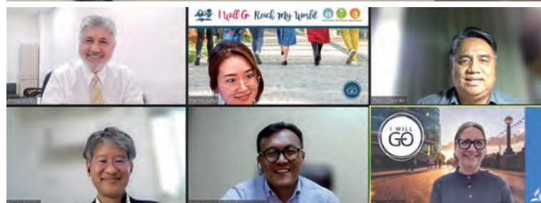
Above: Ministerial secretaries from KUC attend an onsite advisory. Below: Three ministerial secretaries from JUC, MM and TWC have an online advisory.

World” and “Total Member Involvement,” which are about involving every Seventh-day Adventist member in God’s last day message—from speaking the word to living the word, everyone can be a soul winner.