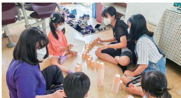
A training session for Children's Ministries teachers.

We ask for constant prayers, hoping that our plans will become a new breakthrough and bring vitality for the future of children's ministries.