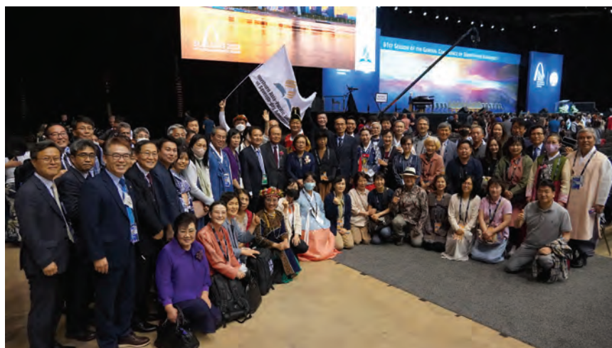
Delegates of the Northern Asia-Pacific Division