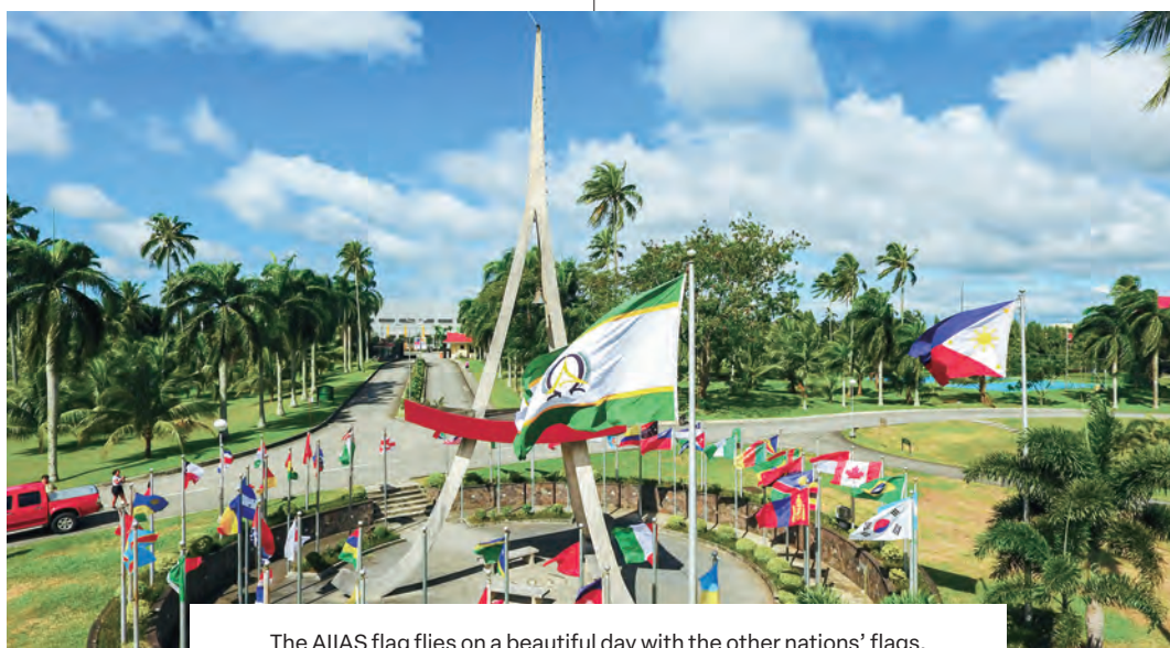
The AIIAS flag flies on a beautiful day with the other nations' flags.

For students planning to study in-person at AIIAS, there are two benefits of entry into the country as