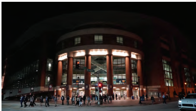
The 61st GC Session adopted a combination of on- and off-site meetings.