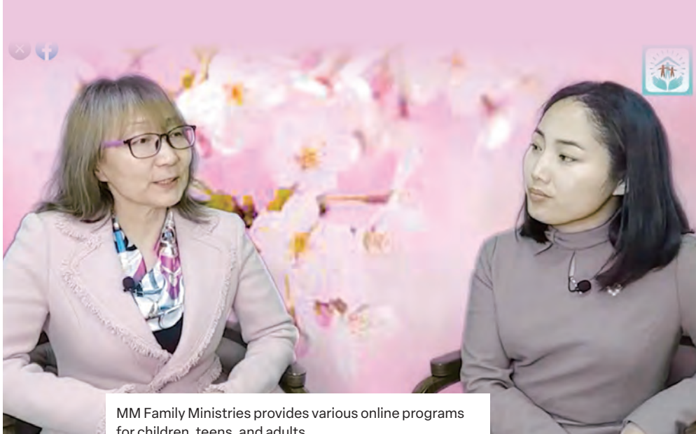
MM Family Ministries provides various online programs for children, teens, and adults.