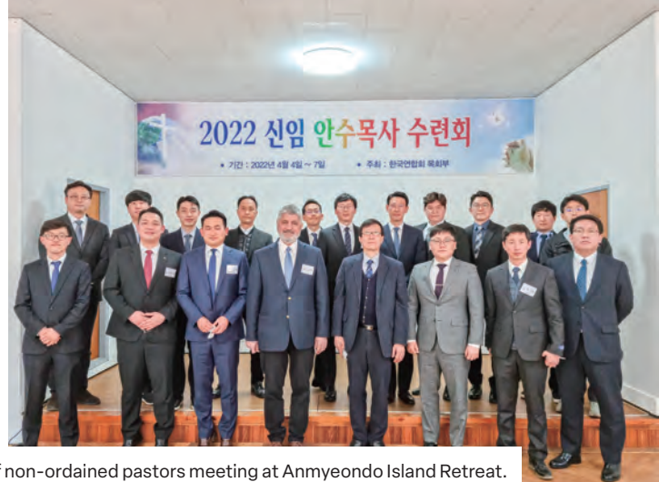
Left: Group of non-ordained pastors meeting at Anmyeondo Island Retreat. Right: Group of newly ordained pastors meeting at Deer Mountain Retreat.