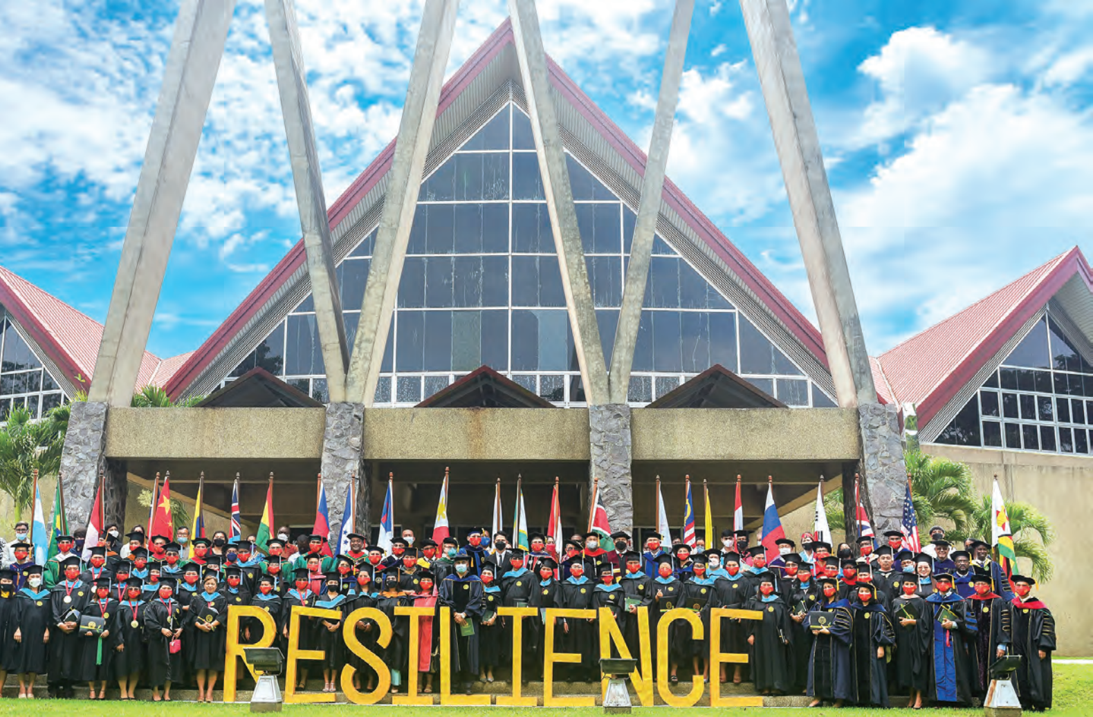
AIIAS class of 2022 at their graduation ceremony, themed “Resilience: Thriving in Adversity”