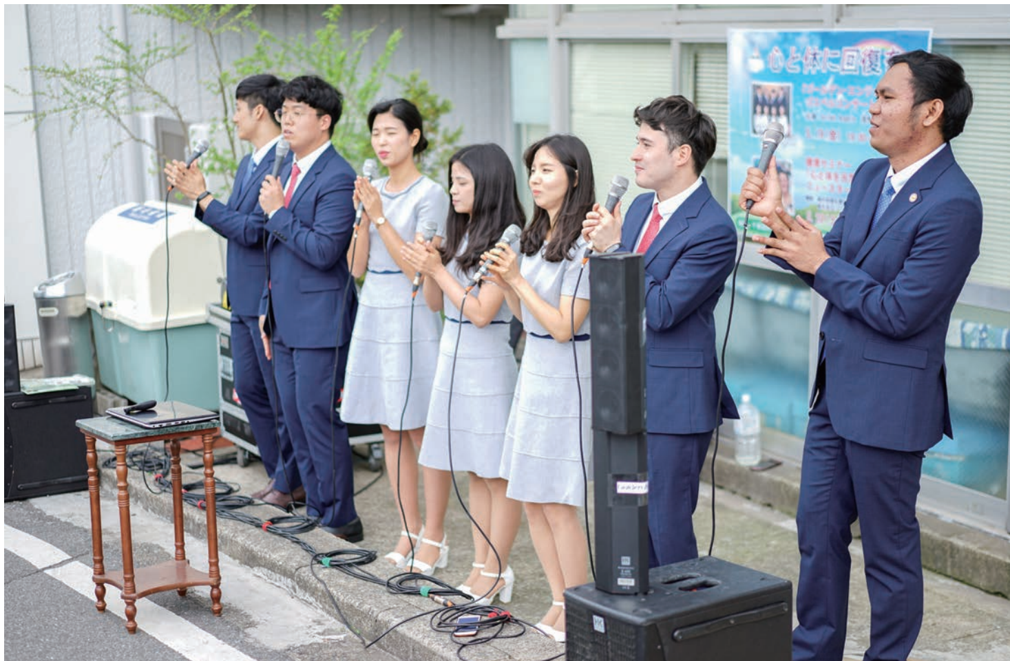
Golden Angels performing outside of a church.