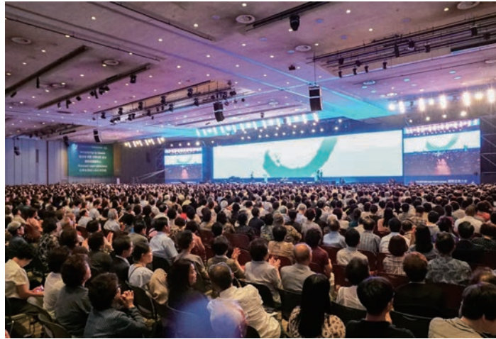
The second NSD International Mission Congress was held at KINTEX, Goyang City, Korea, from August 8 to 11, 2018, with the theme of "Go Forward."