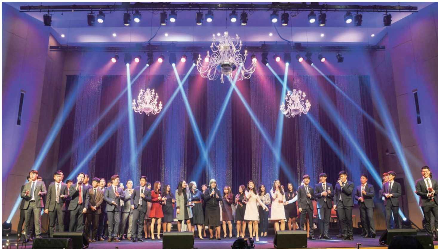
On November 3, 2018, Golden Angels celebrated their 15th anniversary in concert at Sahmyook University in Seoul, Korea.