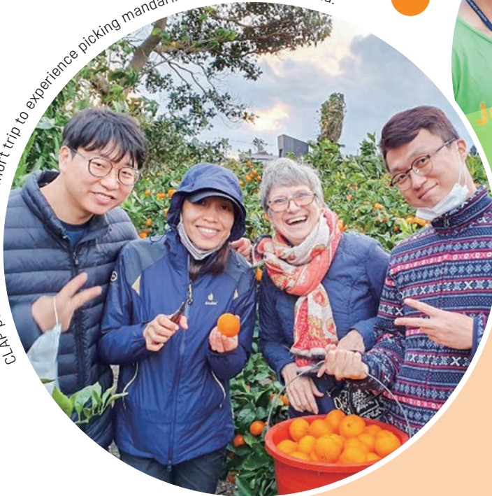
CLAP participants go for a short trip to experience picking mandarin oranges on Jeju Island.