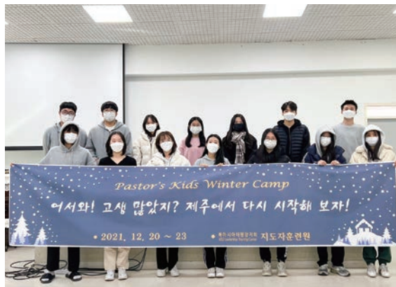
The center holds a winter camp for pastors' kids.