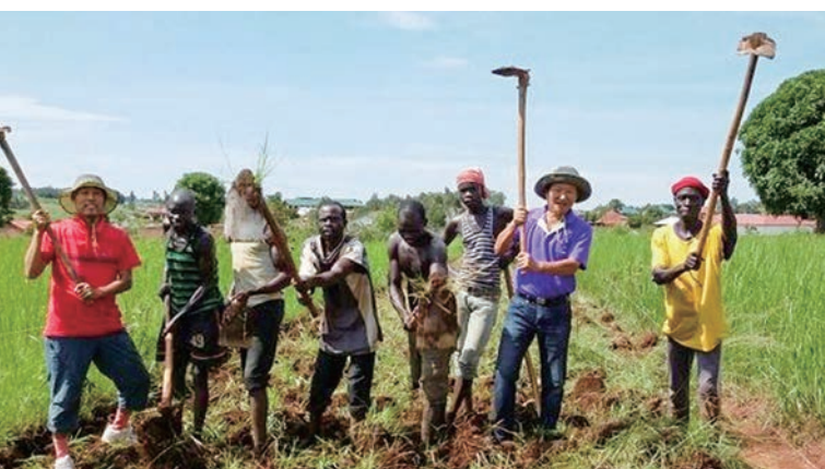
A PMM missionary and his church members expand the roads in the Aru district, one of the under developed areas in Congo.