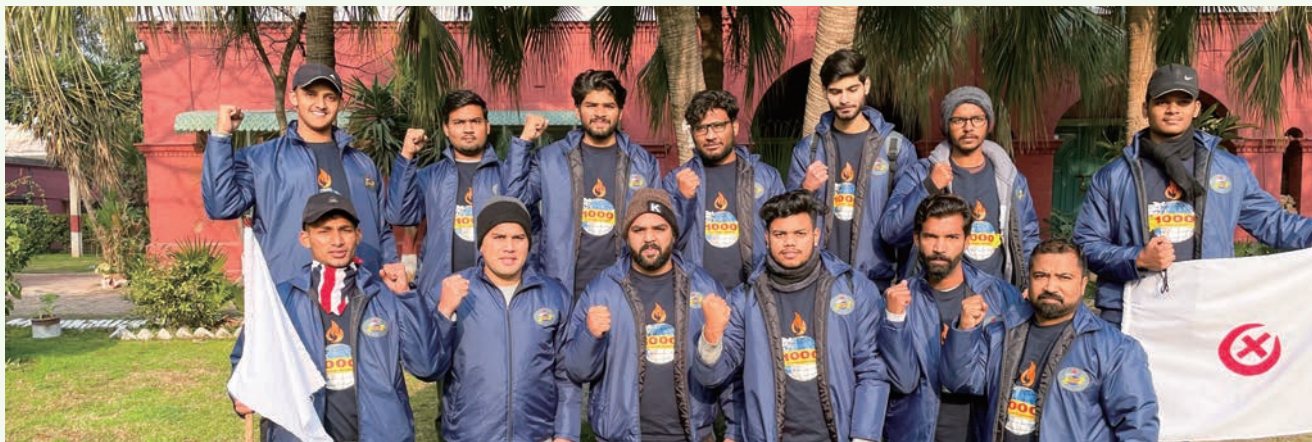
The first batch of missionaries in the 1000MM Pakistan Branch for 2022.

Precious souls accept Jesus as their personal Savior through baptism—having the mark of being a part of God's family.