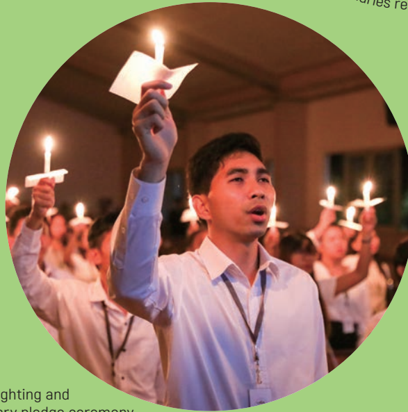
Candle lighting and missionary pledge ceremony. Before missionaries are dispatched to their respective mission fields, they go through a commissioning program, in which they pledge to faithfully serve in their fields.