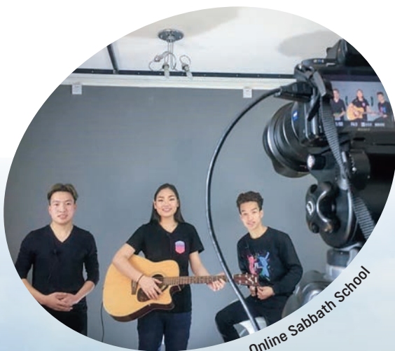
Online Sabbath School

Public Campus Ministries (PCM) leaders in Mongolia held an evangelistic series with 1,000 young people in 2019.