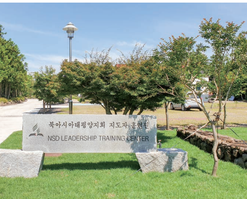
The center's sign at the main entrance.