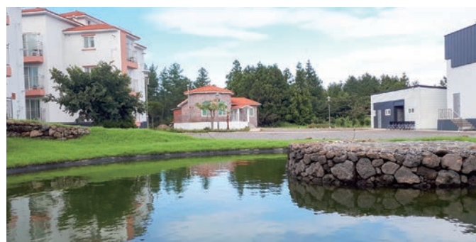
In 2019, the center remodeled the buildings for lodging and improved landscaping with a pond and a small prayer garden.