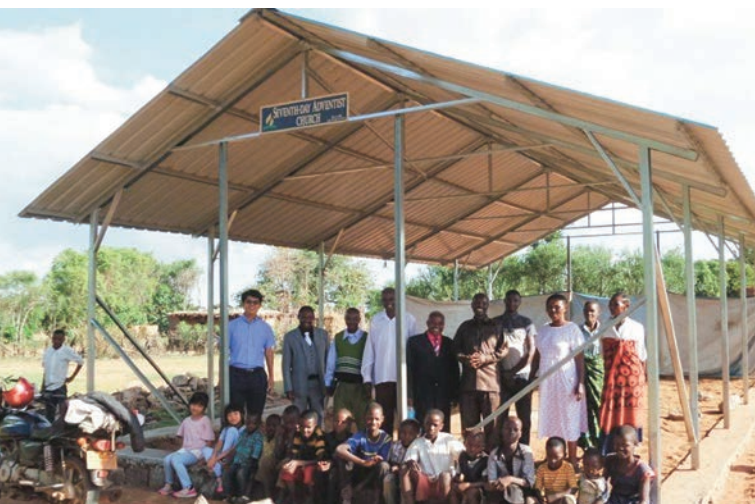
A PMM missionary and church leaders gather for an evangelistic meeting in Isanzu, Tanzania.