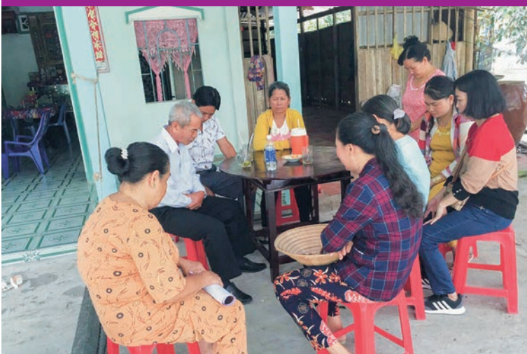
A PMM missionary plans to plant a home church in Vinh Long, Vietnam.

The biggest worry in the mission field is the obstacles that can stop mission work. Although religious freedom is guaranteed in Japan, for more than two years all church gatherings and mission programs have stopped due to COVID-19. When I started praying with my church members in this difficult time, our prayers were answered with three newly baptized members, and we realized that God works in any circumstance. The first person was a Japanese university student who studied the Bible in her extra time after her school closed. She joined the Bible meeting both online and offline to learn about Jesus and was baptized. The second person was a Filipina woman married to a Japanese man. She had turned away from the Christian faith for a long time due to a busy life. In 2021, she was invited to an Adventist church from her college and later was baptized. The third person was a Vietnamese student who studied at a vocational school and worked a part-time job. She met Adventists at work, and they invited her to Bible studies. When churches were closed, God led us to reach souls through friendship and personal invitations.