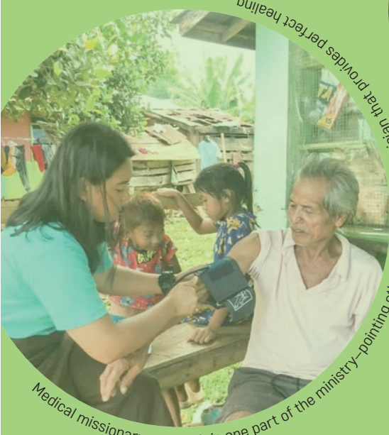
Medical missionary outreach is one part of the ministry—pointing others to the Great Physician that provides perfect healing.