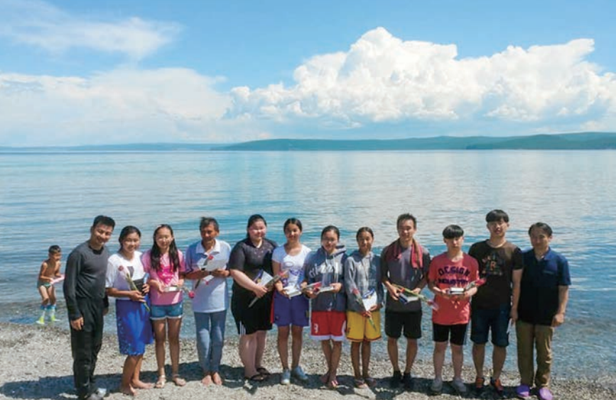
Baptismal ceremony of Darkhan Church in Mongolia.