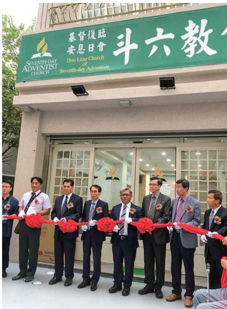
Douliu PMM Church in Taiwan has a special dedication service for their new church building.