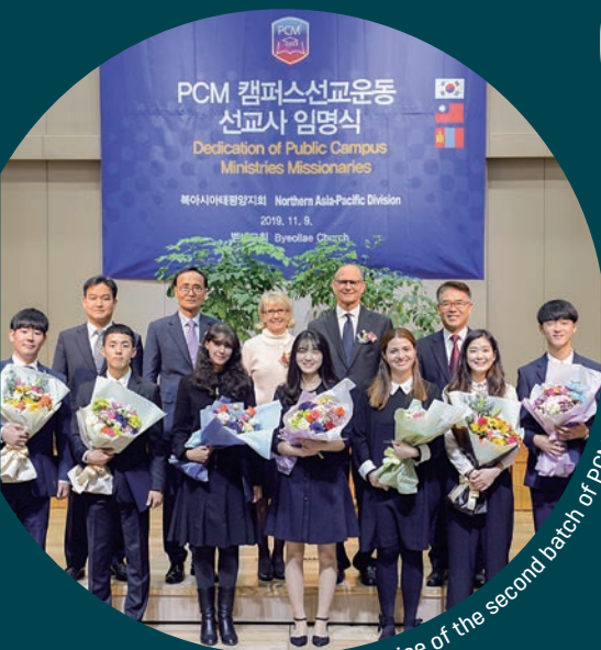
Dedication service of the second batch of PCM missionaries.