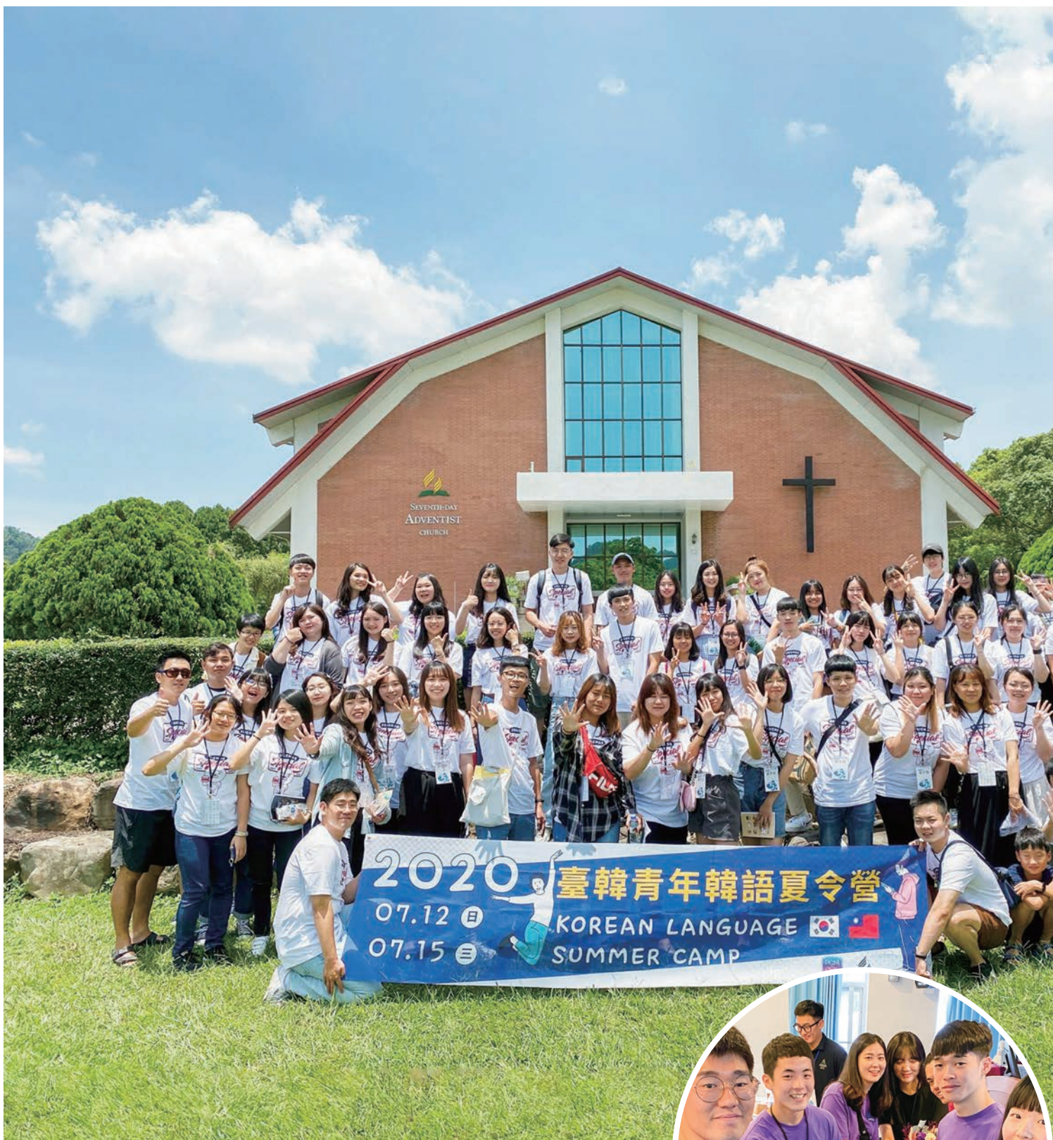
PCM missionaries from five churches in Taiwan held a Korean language camp meeting at Taiwan Adventist College Health Care Center, from July 12 to 15, 2020.