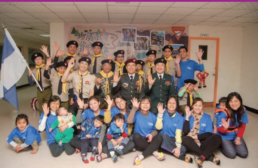
The "Little Drummers Pathfinder Club" of Saru Church in Taiwan—the club serves as a link between the church, club members' parents, and the community.