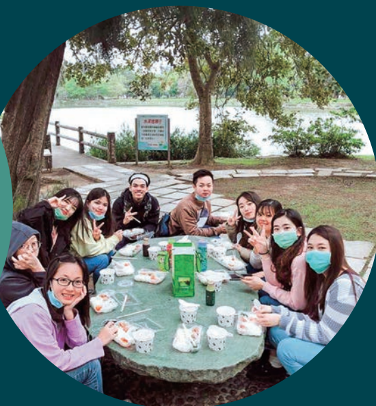
PCM missionaries deliver "lunch boxes with love" to students on campus and have a prayer meeting with them.