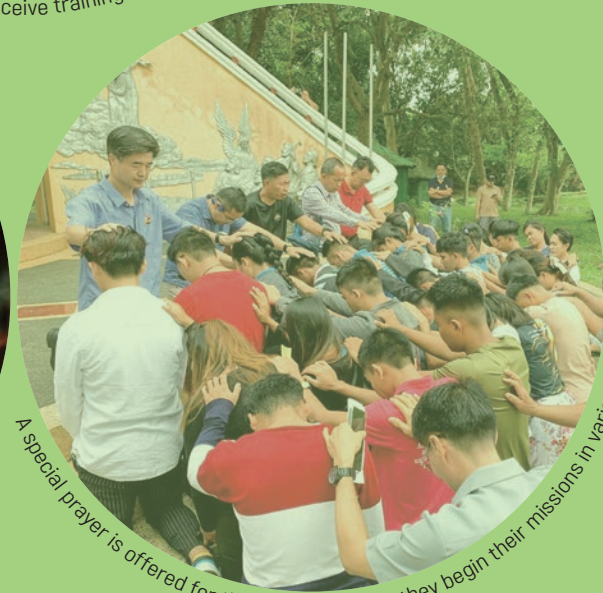
A special prayer is offered for the missionaries as they begin their missions in various parts of the world.