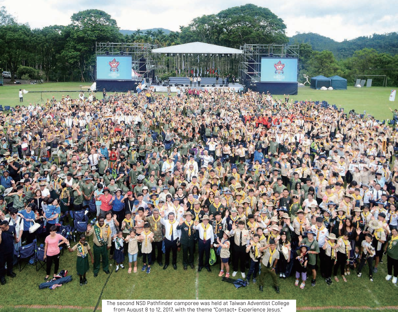
The second NSD Pathfinder camporee was held at Taiwan Adventist College from August 8 to 12, 2017, with the theme "Contact+ Experience Jesus."