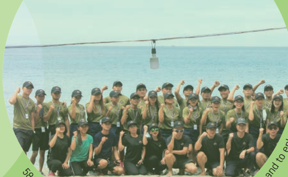
58th batch of missionaries receive training for spiritual unity and to enhance endurance.