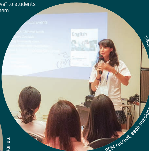
At a PCM retreat, each missionary reports on mission activities.