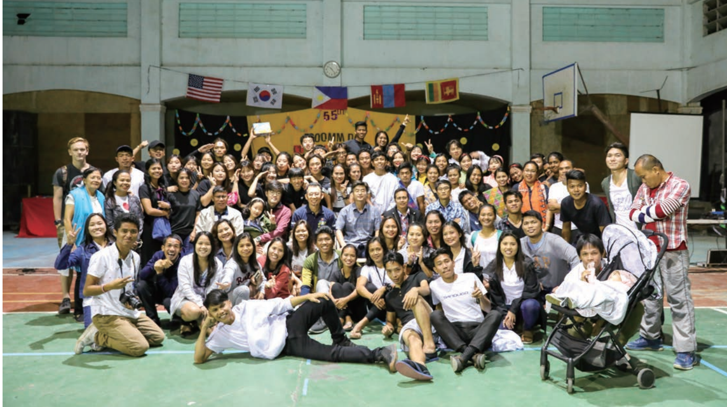
On 1000MM Day, missionaries gather after enjoying team activities.