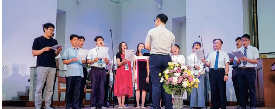
CLAP members visit a local church on Sabbath and provide a special song.