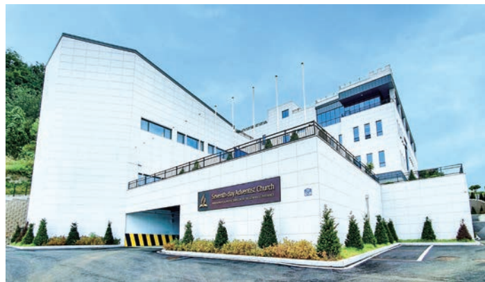
Dedication ceremony of the new NSD headquarters building was held on November 8, 2019, at the site of the new building in Yadang-dong, Paju City, Korea.