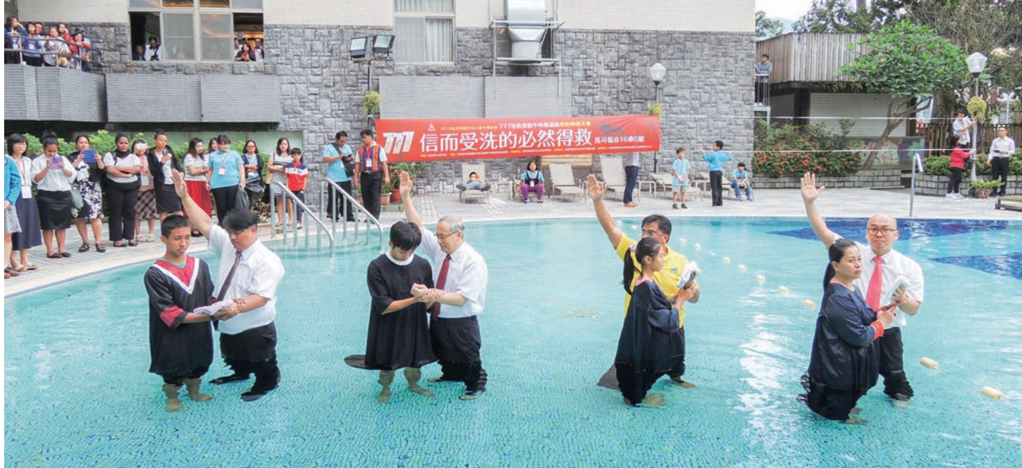
TWC Evangelism On November 26, 2016, three evangelistic meetings were held simultaneously in the northern, central, and southern parts of Taiwan's urban areas. The number of baptisms on that day was 74.