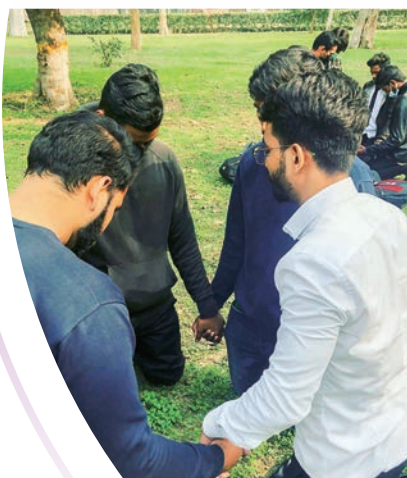
Week of prayer at Pakistan Adventist Seminary & College.