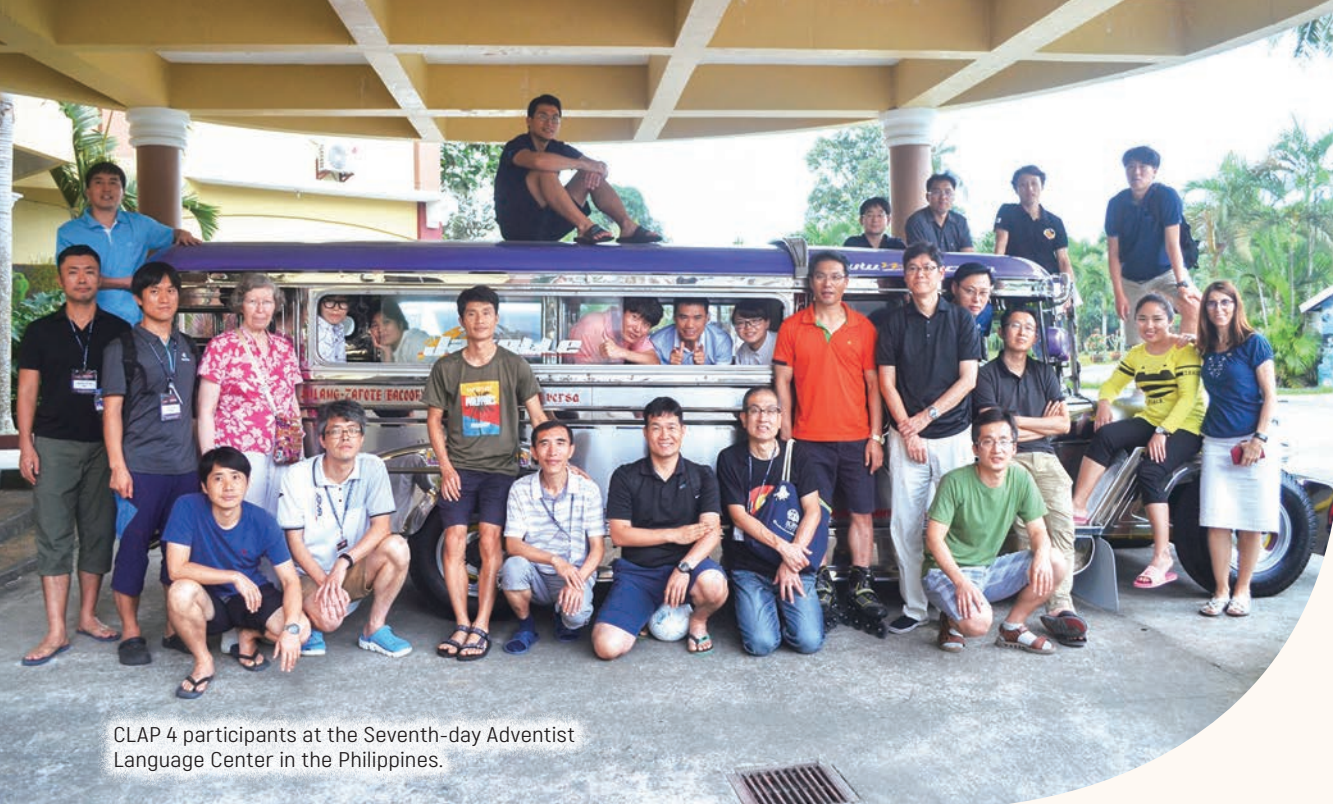
CLAP 4 participants at the Seventh-day Adventist Language Center in the Philippines.

CLAP (Communication & Leadership Advancement Program) is a distinctive program which began in 2008 to aid in the molding of future leaders for the Northern Asia-Pacific Division (NSD). The main goal of CLAP is to hone the spiritual leadership potential of future leaders as well as to equip them with an essential communication tool, expressing themselves clearly in English.