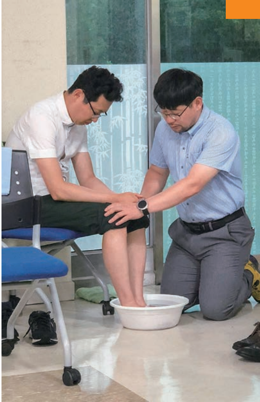
CLAP members participate in a special communion service including a foot-washing ceremony.