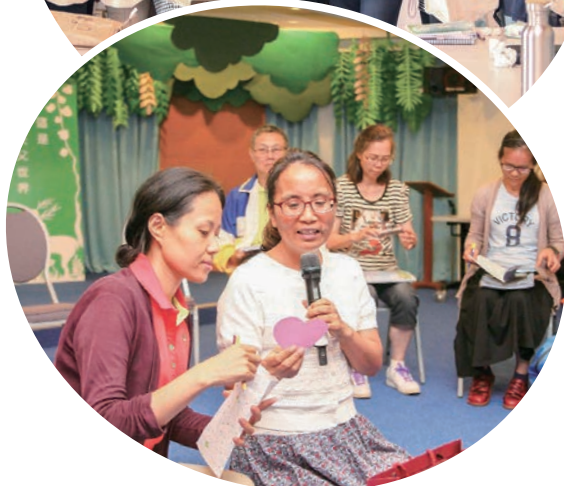
Children's Sabbath School Teacher Training Children's Sabbath School teachers in Taiwan gather to participate in a weekend training.