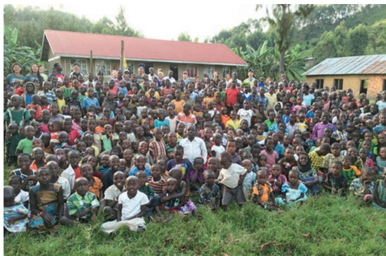
More than 600 children participate in a Vacation Bible School during the evangelistic series in the Marinde district in Uganda.