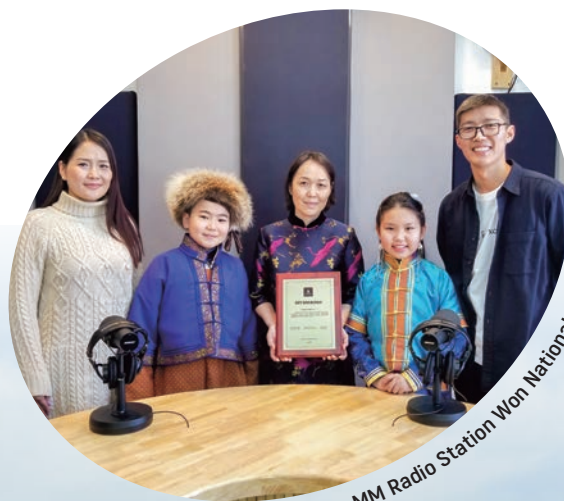
MM Radio Station Won National Contest

Due to COVID-19, MM started online Sabbath Schools and divine services.