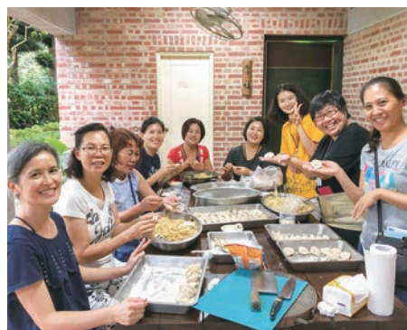
Retreat for Ministerial Spouses The Ministerial Spouses' Association of TWC organizes a retreat.