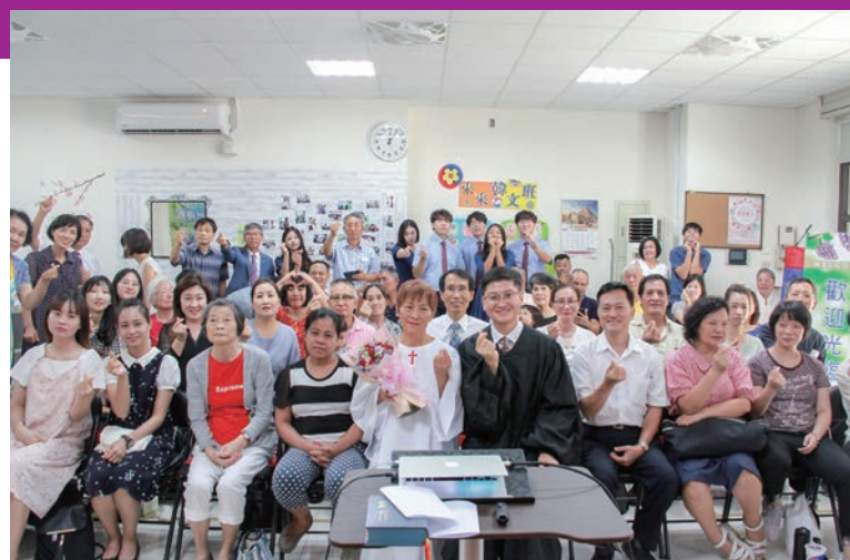
A baptismal ceremony of the Taoyuan Luzhu Church in Taiwan after conducting the evangelistic series with the Golden Angels.