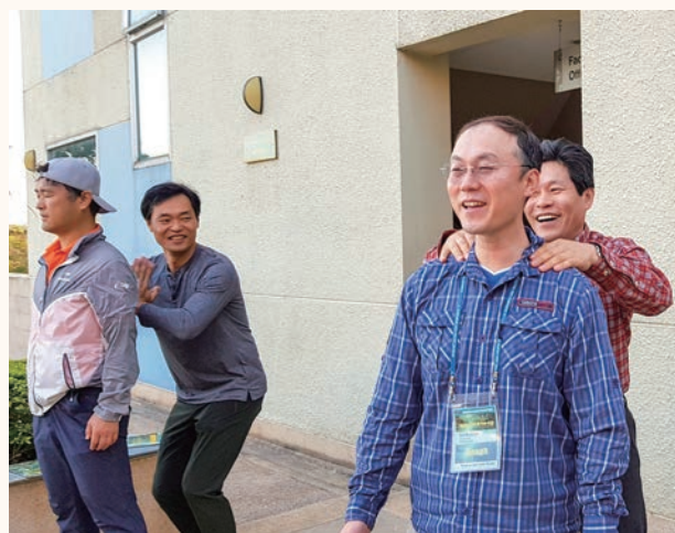
One of the goals for CLAP is to create an environment of trust and friendship where participants can bond with each other and provide support and encouragement.