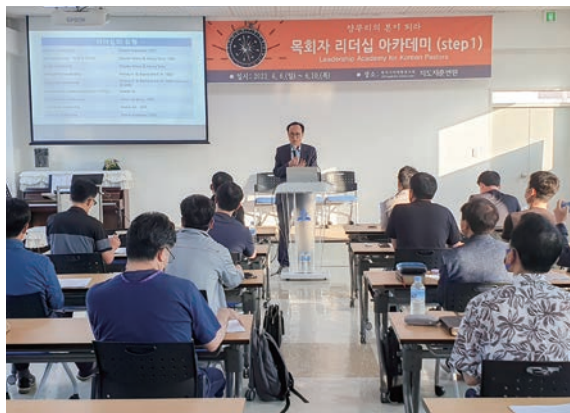
Leadership Academy for pastors in the center's main classroom to enhance the leadership capabilities of local pastors serving in the NSD territories.