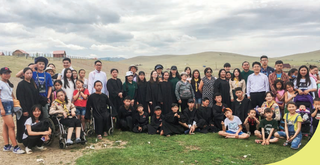
Golden Angels 15 on a mission trip to Mongolia.