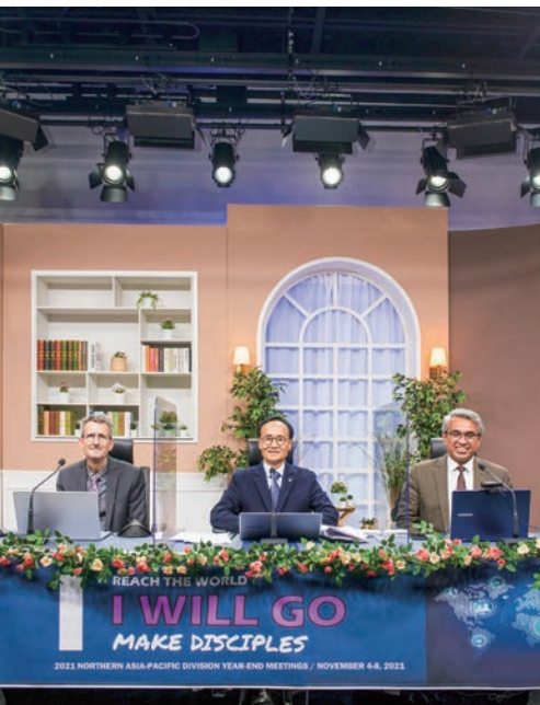
NSD held its year-end meetings on Nov. 1-8, 2021, with the theme "Reach the World: I Will Go Make Disciples!"

Leaders from NSD and organizations under the NSD visit 17 Adventist churches located near the Korean Demilitarized Zone to hold a special North Korea prayer Sabbath with church members.