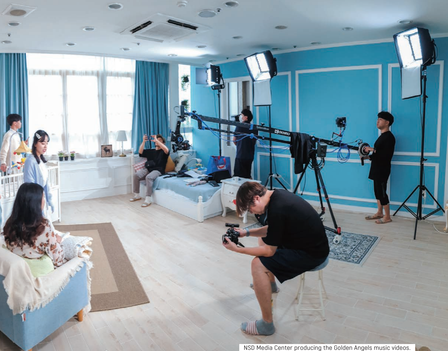
NSD Media Center producing the Golden Angels music videos.