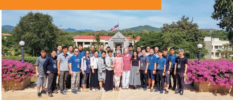
CLAP's 5th cohort was held at the Asia-Pacific International University in Thailand from November 17 to December 2, 2019.