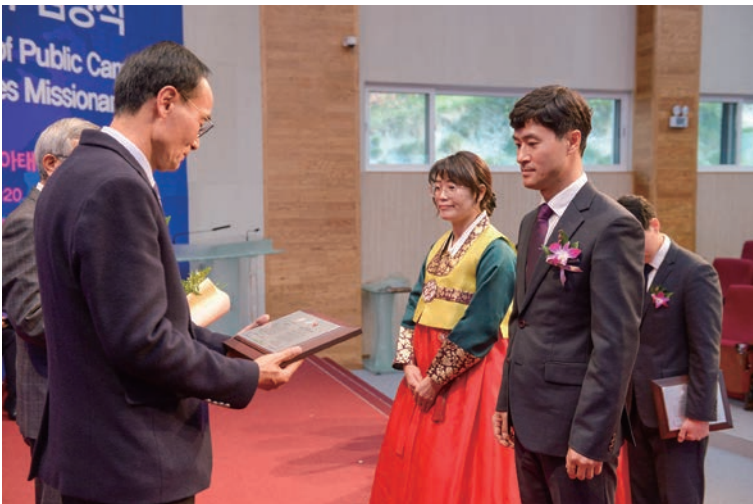
19th PMM dedication service.