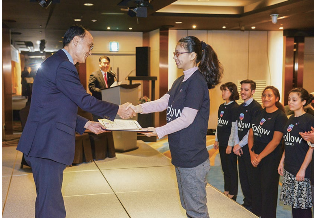
NSD held a commissioning ceremony for their first Public Campus Ministries (PCM) missionaries on January 13, 2019.