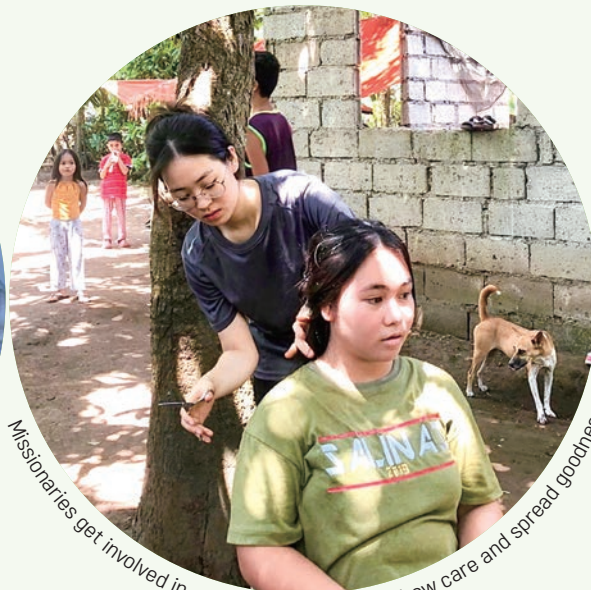
Missionaries get involved in community service to show care and spread goodness.