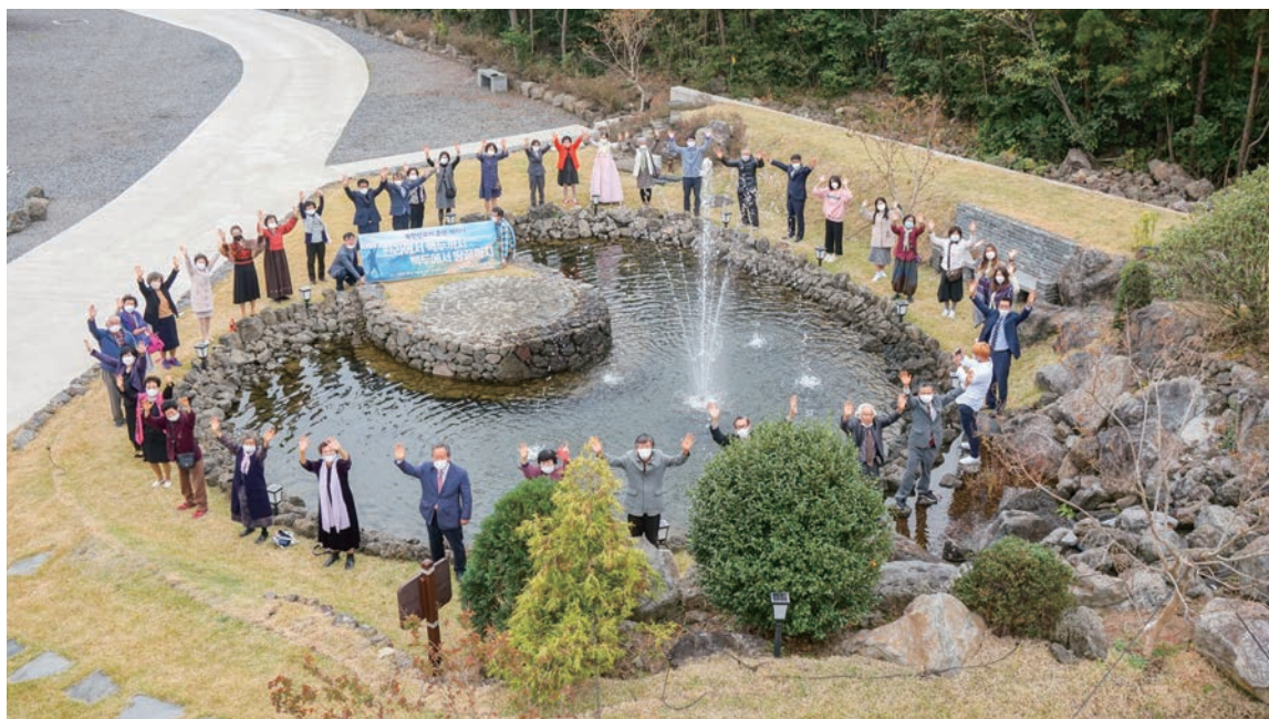
Participants of the training for North Korea mission gather in a circle around the pond.

The Northern Asia-Pacific Division (NSD) Mission Leadership Training Center, which commenced in 2014 on Jeju Island, Korea, is now training church leaders while developing their leadership skills. The center is used by organizations within the NSD territories as a designated leadership training site applying church vision goals through the guidance of the Holy Spirit as well as rest and relaxation. The territories include Korea, Japan, Taiwan and Mongolia.