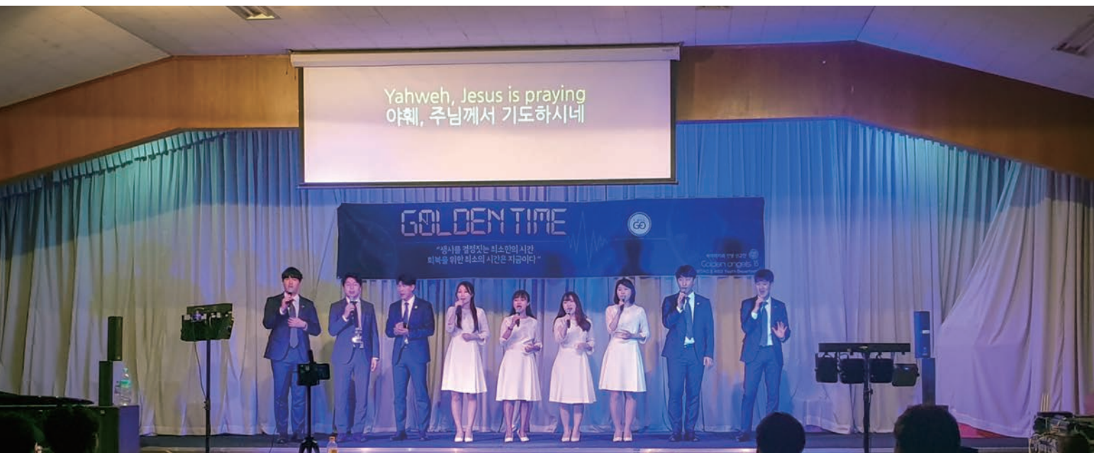
The Golden Angels 18th group organized and carried out a youth worship program, entitled "Golden Time."