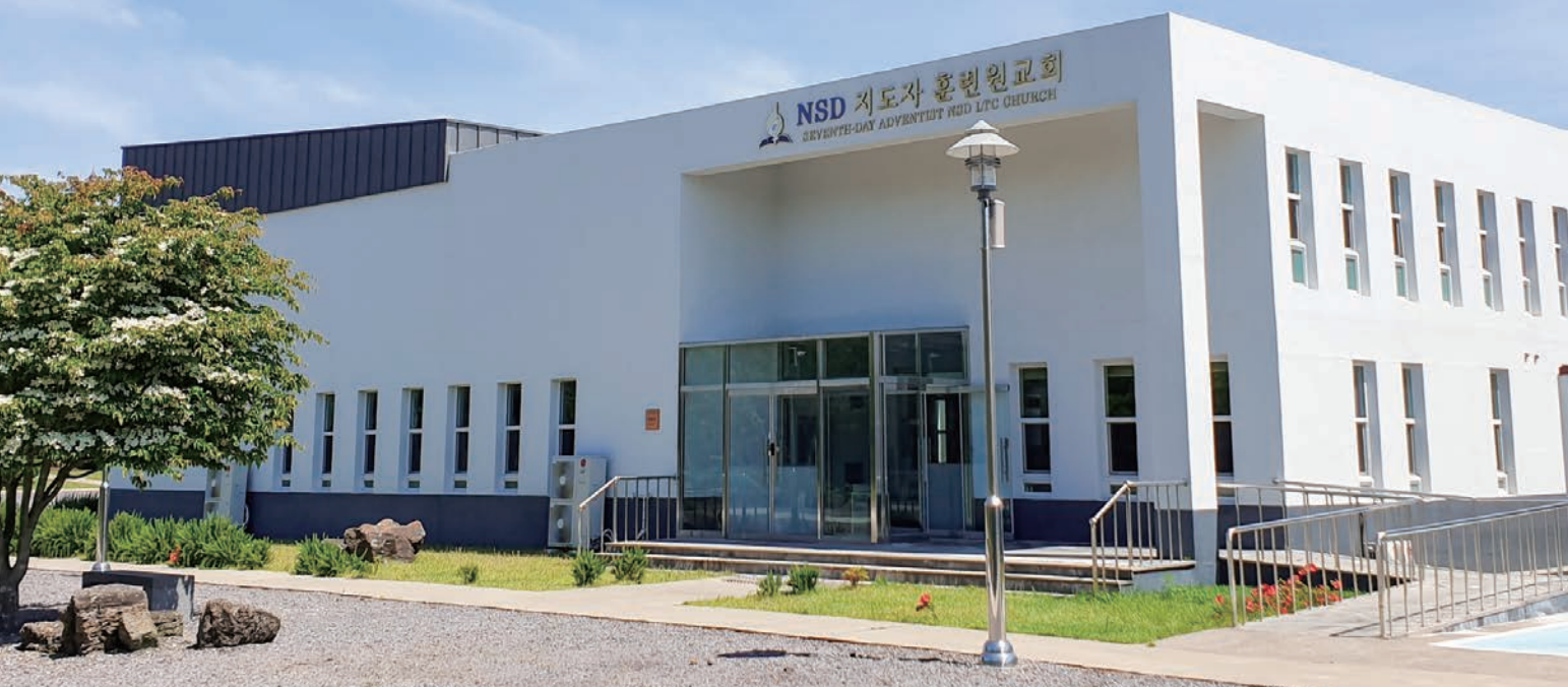
The main hall of the NSD Mission Leadership Training Center.