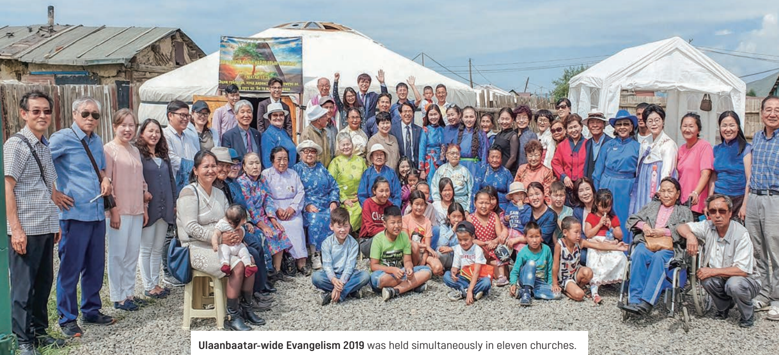
Ulaanbaatar-wide Evangelism 2019 was held simultaneously in eleven churches.

Khemnel Radio, a radio station operated by MM, recently won the National Best Children Content for Radio contest.