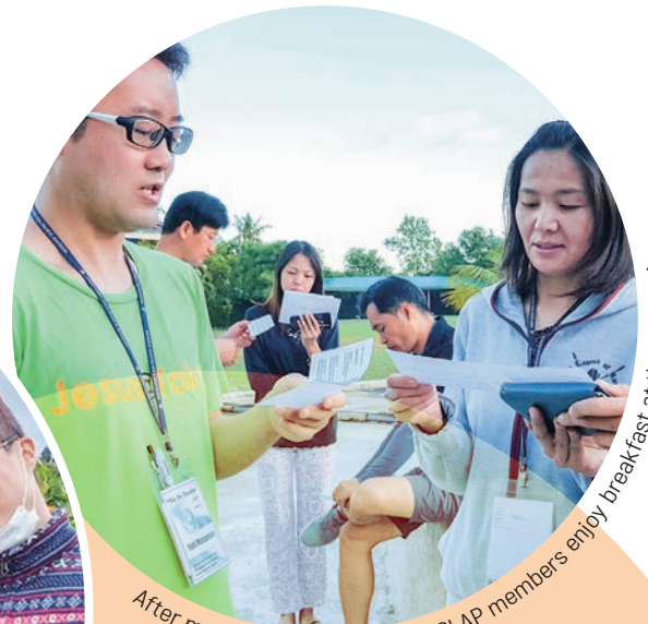
After memorizing a Bible verse, CLAP members enjoy breakfast at the cafeteria.