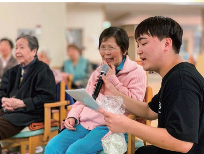
Golden Angels visit a nursing home to spend time with the elderly and to preach about the living God.