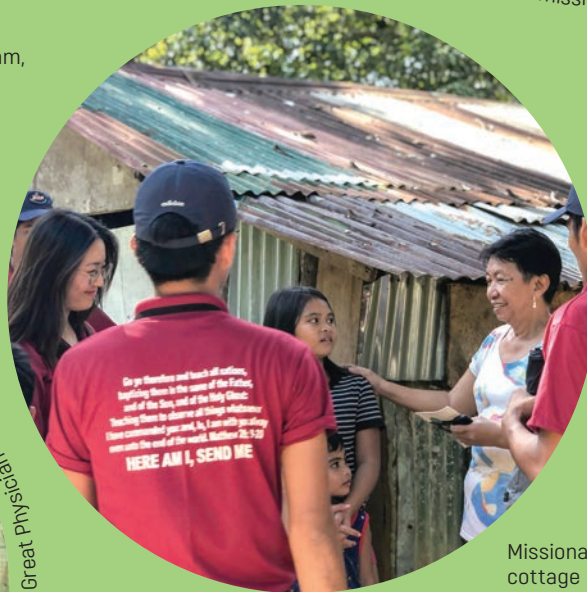
Missionaries hold a cottage meeting on Alabat Island, Quezon, Philippines, offering people prayer and pamphlets.