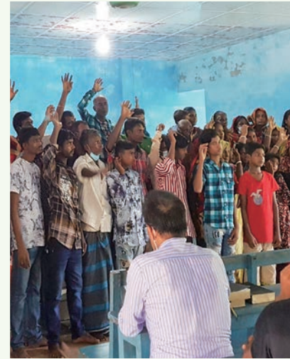
Missionaries serving in Bangladesh manifested baptism, which led to the salvation of 51 individuals.

dedicated service, the movement has drawn 11,396 young people from 64 countries to take part in the great commission of the Lord. With that number, the 1000MM has sent missionaries to 47 countries.