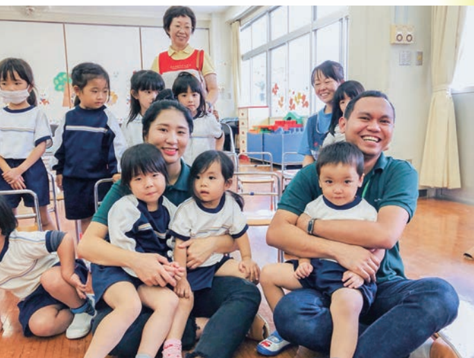
Golden Angels visit kindergartens to share the love of Jesus.