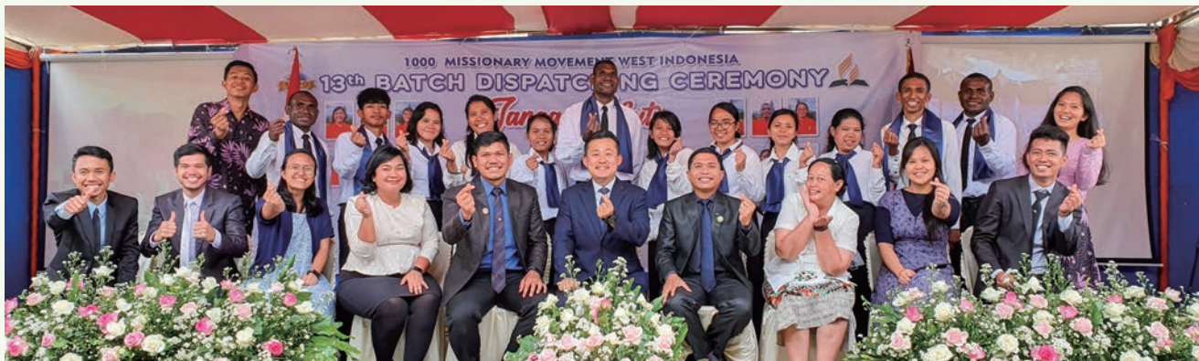
Missionaries in West Indonesia are ready to be dispatched to their respective mission fields.