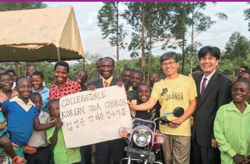
Individuals from the Collegedale Church in the U.S. donated a motorcycle to a missionary in Marinde, Uganda.