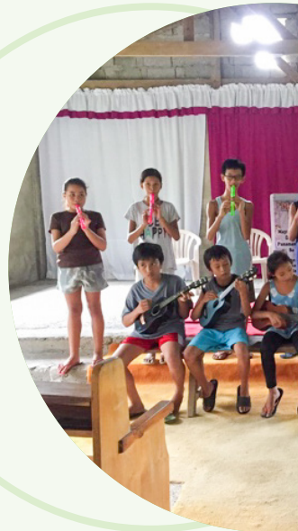
Missionaries run various programs to teach children the Bible.

Seniors can have the strength, health, wisdom, experience, and enthusiasm to provide excellent service. The SMM is open for them to contribute to the global mission.