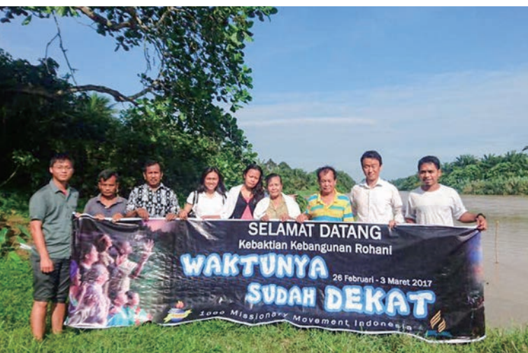
A baptismal ceremony in a Muslim-majority town in Indonesia.