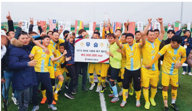
One of the Vietnamese teams won the 6th Multicultural Soccer World Cup, which was organized by the MFSC.

Ansan-si, with approximately 90,000 foreign residents making up 12 percent of the city's total population, is now called a "Global Village." The MFSC has hosted the event since 2014 to promote harmony and social integration between foreigners and Koreans. Through the Multicultural Soccer World Cup, Koreans and foreigners have been able to resolve prejudices against each other, recognize foreigners as valuable members of the multicultural society, and overcome cultural conflicts and differences. In the future, the MFSC will continue to contribute to the community through various cultural and sports events.