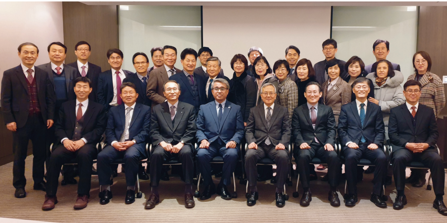
Korean Adventist education leaders at the 2020 KUC education council