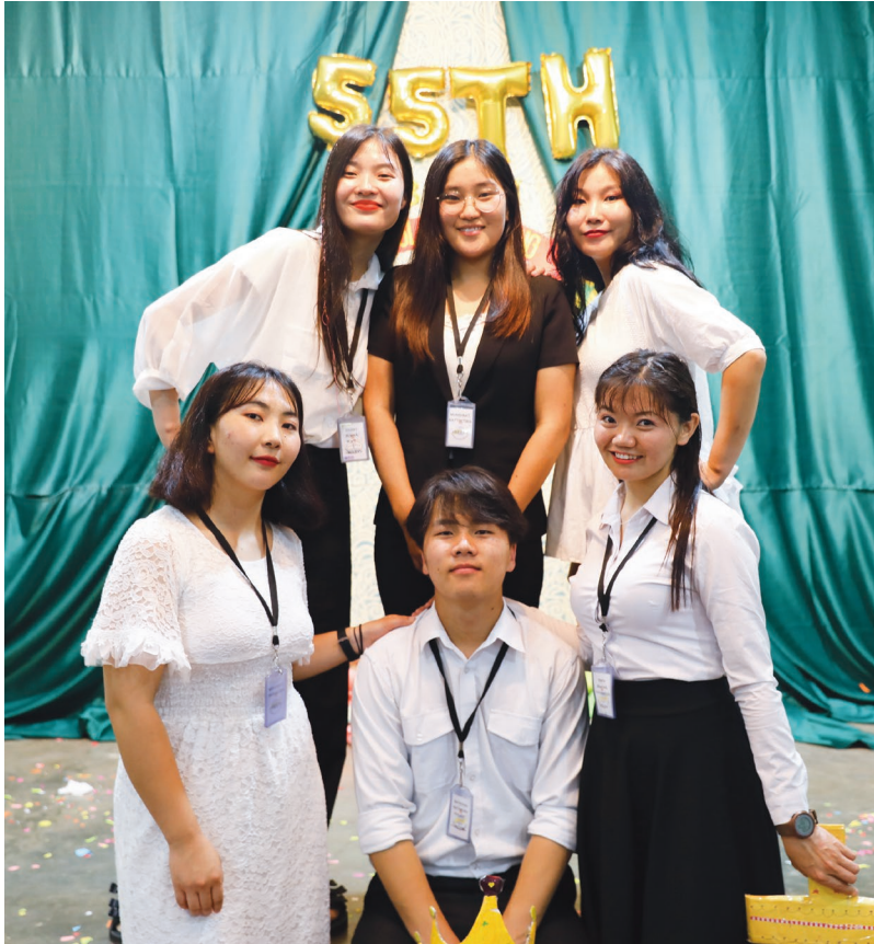
A group of the 55th batch missionaries from Mongolia