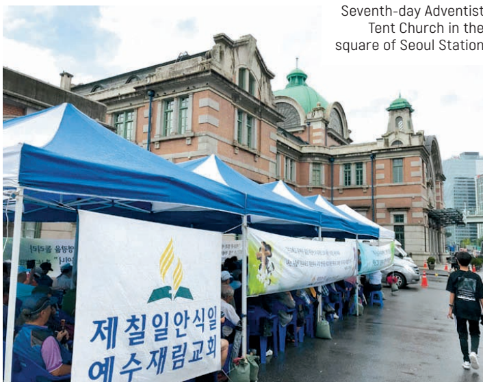
Seventh-day Adventist Tent Church in the square of Seoul Station

On a Wednesday afternoon in late autumn in 2019, I visited the square at Seoul Station. Light rain fell from the dull sky, and the wind made passersby zip up their jackets. Thirty minutes before 2:00 p.m., people started to set up a blue tent. A large screen, microphones, speakers, and other equipment were also ready. Volunteers wearing yellow raincoats did their part in spite of the growing raindrops. Men were busy pegging the tent to the ground to keep it from collapsing in the wind, and women wiped the chairs that were wet from rain. Lastly, they put up a banner, which read, “Worship him who made the heavens, the earth, the sea and the springs of water” (Revelation 14:7). In addition to the Bible verse, the banner included the words “Seventh-day Adventist Church.” It was the Tent Church in the square of Seoul Station, which has one of the highest foot traffic in Korea.