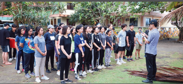
Regular morning assembly of missionaries