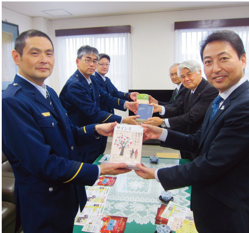
Above: A Signs of the Times gift presentation ceremony was held at the Kumamoto Prison director's office in December 2019.

At the last Japan Union Conference year-end meeting, I said, “We may not be able to personally visit the prisons and share the gospel with the prisoners. However, Signs of the Times will become an angel visiting prisoners and preaching the gospel to them for you!” A few days after my short appeal, one of the executive committee lay members called and said, “Please let me donate 100 subscriptions for the prison ministry. After hearing the testimony about Mother House, I was convinced that it is God’s work. Providing