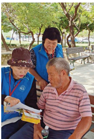
Six people got baptized through the evangelistic series held by Dandelion Mission at Dali Church.