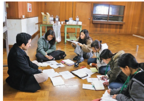
Bible camp focused on the prophecies of Daniel and Revelation.