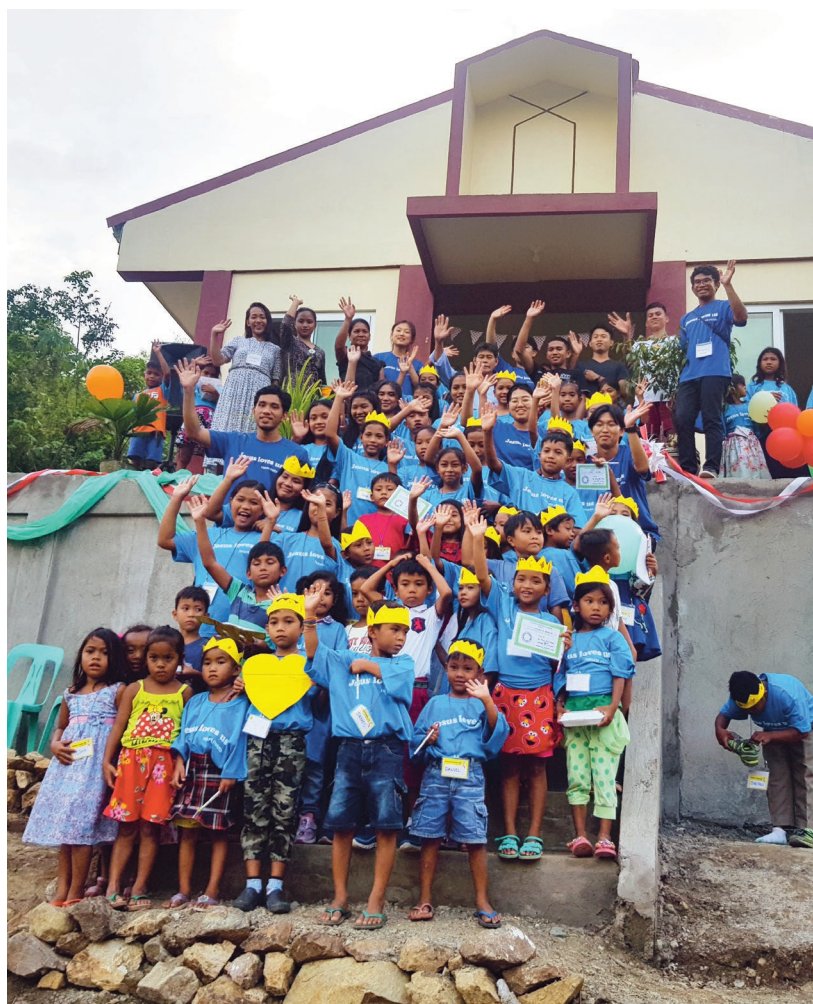
First Vacation Bible School in the new church building

November 11, 2019, was the first day of the construction of our church building. The sun was scorching, and the construction workers were full of enthusiasm. My two partners and I, missionaries of the 1000 Missionary Movement (1000MM), also picked up shovels, rolling up our sleeves. Our busy days had begun. Every morning worship focused solely on the church construction. We pulled sand from the river, and we carried gravel and bricks. There was not a moment I was away from the construction site. Once a truck loaded with building materials got bogged down in the sand along the river, and all the villagers gathered to pull it out. Sometimes cars were ruined by rocks buried in the river, or they got a flat tire. That was our experience for the first three weeks of church construction. There were a few troubles, but the construction seemed to be going quite smoothly.