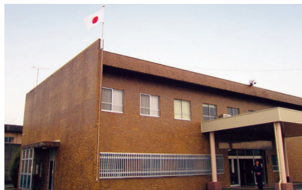
Below: The Japan Publishing House is planning to send 820 magazine subscriptions to prisoners in the Kumamoto Prison.

an opportunity for prisoners to know God and find new hope is a wonderful work. Please allow me to be part of this prison ministry!” That was 100 magazine subscriptions in one phone call—in other words, $5,000 USD. I was shaking with excitement and encouragement!