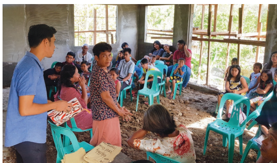
Church members so longed for a new church building that they had a worship service at the unfinished building.

In Patriarchs and Prophets , Ellen White said, "God was the designer, and Noah the master builder." Yes, God designed everything, and we followed His orders. Someone said to me, "There will be no mistake if your plan comes up while you are praying." I knew nothing about construction, but I am sure that our church is strong because it was built by praying knees, not just heads.