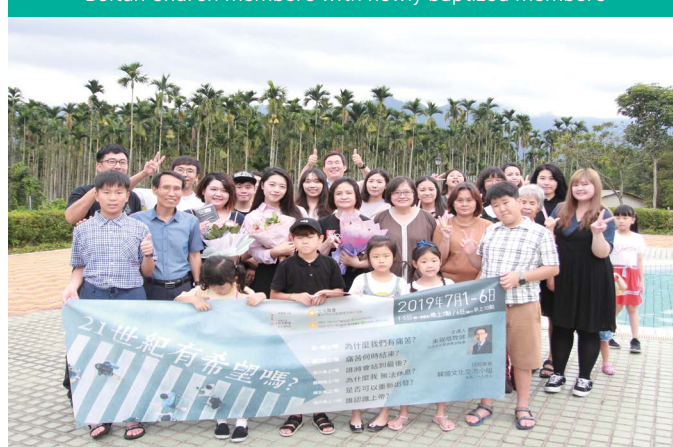
Beitun Church members with newly baptized members

As a result of the meetings, four people made the decision to dedicate themselves to God through conversion. One was converted into Adventism by confession and the other three by baptism. The baptismal ceremony was held at the swimming pool of the health center at Taiwan Adventist College. Among these four new members, two were led by their family members. Since most of the Beitun Church members attend the church alone, it is a blessing to have Adventist families in the church. Glory to God!