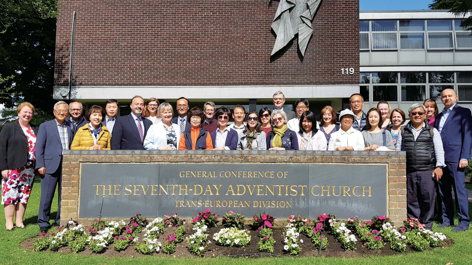
NSD PREXAD visited the Trans-European Division office in St. Albans, England.