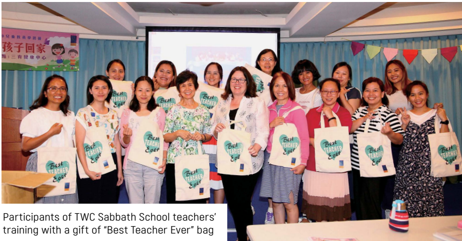
Participants of TWC Sabbath School teachers' training with a gift of "Best Teacher Ever" bag

Check out your children's Sabbath schools soon; encourage the leaders, and affirm the children. If you are inspired and convicted to do so, volunteer to help in one of the children's departments! The education and experience will be mutual; they will be blessed by your presence and attention, and you are never too old to learn from the youngest among us!