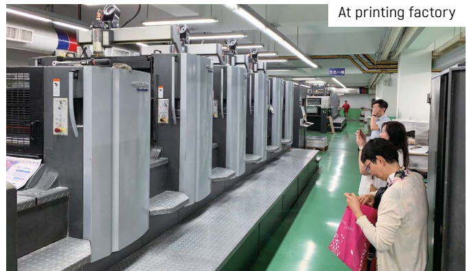
At printing factory