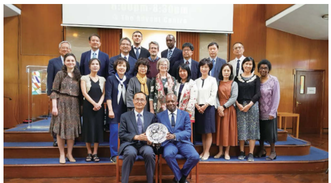
On the Sabbath during the itinerary, the NSD PREXAD attended the worship service at Central London Church.