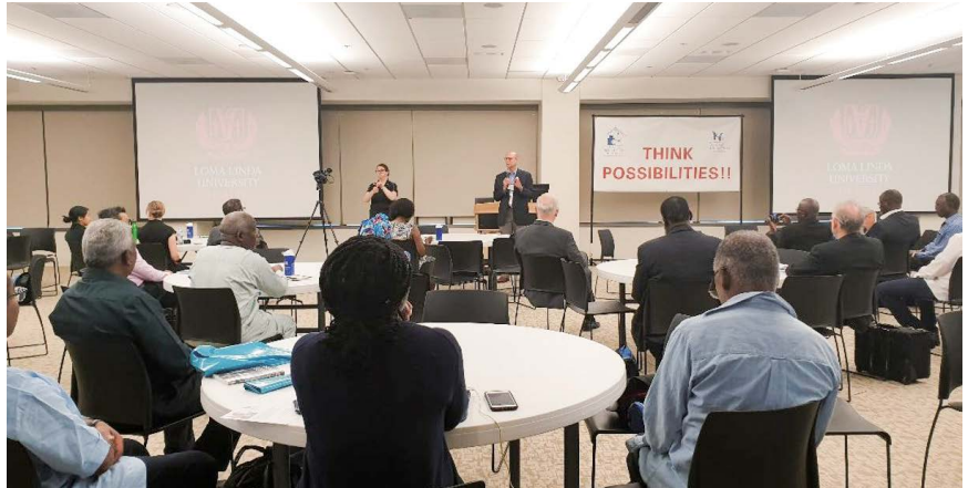
The first Global Conference for Special Needs Ministries was held with the theme of "Think Possibilities."

After the Global Conference on Health & Lifestyle, the first Global Conference for Special Needs Ministries was held at the Loma