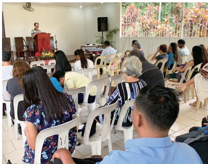
One of the CLAP family groups visited Munting Ilog Church one Sabbath, leading Sabbath School programs and divine worship.

sermons, Sabbath School lessons, and Sabbath School programs. They also led out in the morning programs. These four churches will be the places where we will have evangelistic meetings during the last CLAP session of this batch next year. We had meetings with the church members and discussed how we could effectively prepare and execute next year's evangelistic meetings. We hope that these 2018-2020 CLAP sessions will be finished with the fruitful harvest of souls by making the best use of what we have learned throughout the CLAP sessions. We pray that the Holy Spirit of the Pentecostal Day will be poured also upon His servants today.