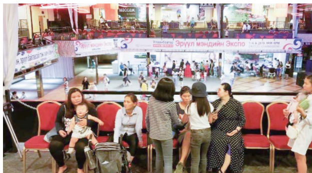
Mongolia Mission's second health expo, which was held at the Crocus Exhibition Hall, attracted an average of 500 daily visitors.