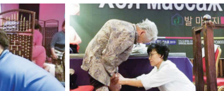
A variety of booths, including foot massage, hair stylist, and oriental medicine, were provided for visitors.