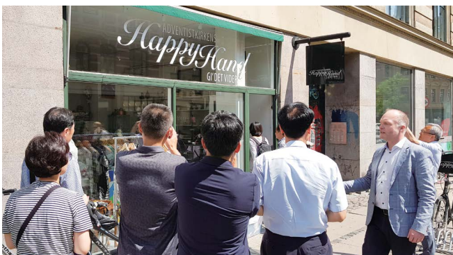
NSD PREXAD visited Happy Hand, the second hand clothing shop operated by the Danish Union.

In England, our final destination, we visited the TED office and Newbold College, which is operated by the TED. Although all of my previous visits were great experiences, I was most impressed by my visit to Central London Church. This church is located in a multicultural area, and the neighbors are composed of many immigrants as well as original residents. The church members are mostly composed of immigrants, including people from the Caribbeans, the Philippines, Romania, Ukraine, and other places. The Brazilians hold worship separately in Portuguese, and their number is almost the same as that of the main English congregation. They are struggling to reach the local people, especially the local British people, but they never give up. Recently, they have started the new City Life program, which is designed so that all church members can get to know their neighbor on a deeper level in their daily life. This is certainly the spirit of Total Member Involvement.