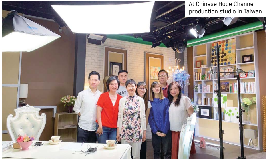
At Chinese Hope Channel production studio in Taiwan

The trip to Taiwan was spiritually uplifting. The LDSC editorial team is determined to give their best to serve the CHUM territories in the next 100 years, preparing their readers for the second coming of Christ.