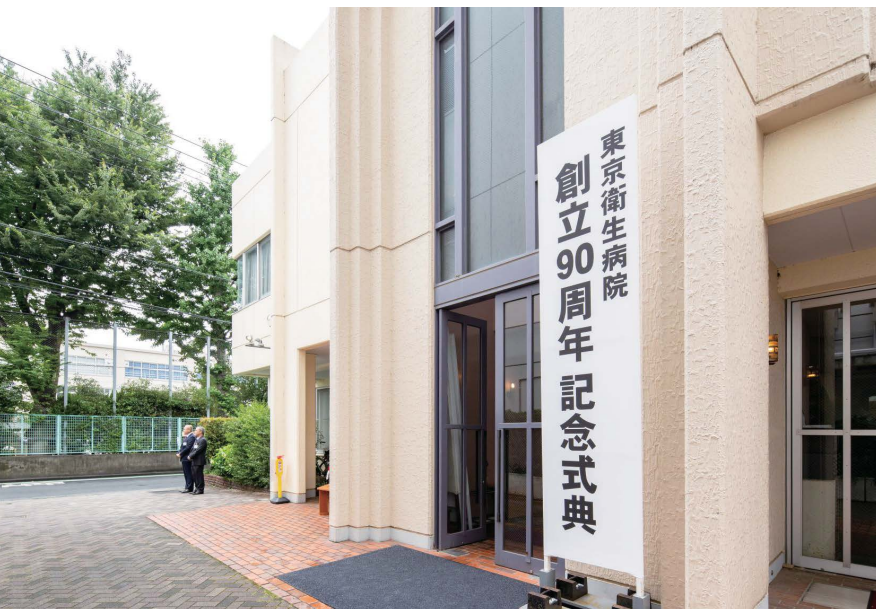
Tokyo Adventist Hospital celebrated its 90th anniversary on June 30, 2019.

Today, Tokyo Adventist Hospital is a 186-bed institution with more than 500