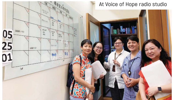
At Voice of Hope radio studio