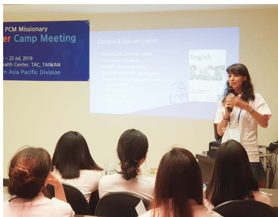
At the retreat, each of eleven PCM missionaries gave reports on mission activities for the past six months.