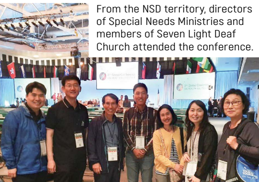
From the NSD territory, directors of Special Needs Ministries and members of Seven Light Deaf Church attended the conference.

The Special Needs Ministries covers several areas, such as the deaf, the blind, the physically handicapped, the mentally handicapped, orphans, widows, and caregivers. People who suffer from these disabilities are increasing at an alarming rate. We as God's servants will take care of them with hands of mercy.