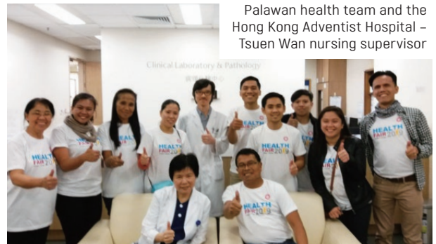
Palawan health team and the Hong Kong Adventist Hospital – Tsuen Wan nursing supervisor