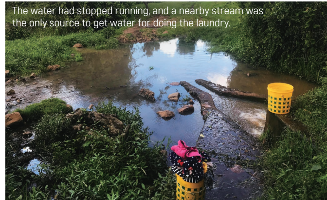
The water had stopped running, and a nearby stream was the only source to get water for doing the laundry.