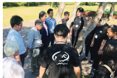
Golden Angels had a moment of prayer at a park in Biwako, where the earlier batch of Golden Angels visited ten years ago.

Ten years ago, the Golden Angels group from that time visited Biwako