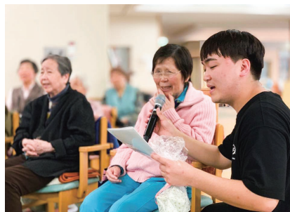
Golden Angels spent time with the elderly at a nursing home in Chiba to share the love of Jesus.