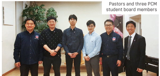
Pastors and three PCM student board members