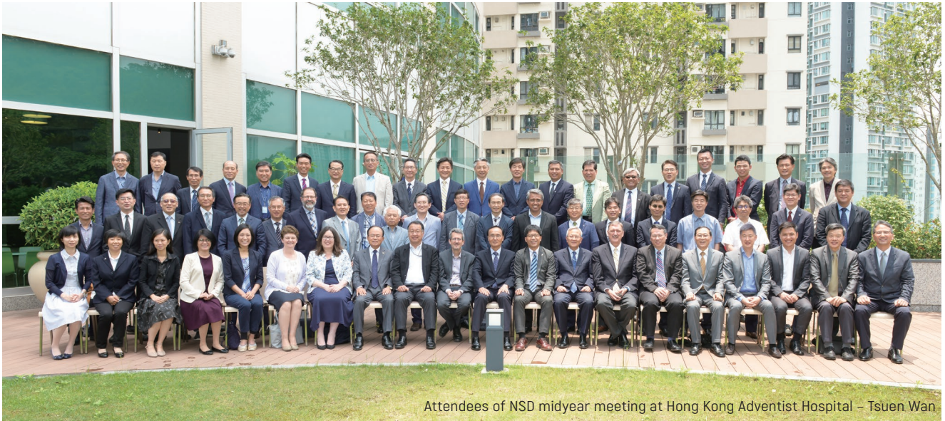
Attendees of NSD midyear meeting at Hong Kong Adventist Hospital – Tsuen Wan