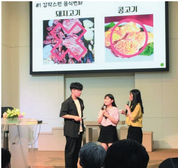
ACT members perform a short play about conflict that young Adventist experience due to their Adventist faith.

A short play was performed by the ACT (Adventist Collegians with Tidings) churches from the East and West Central Korean Conferences at the end of the seminar. It showed the different religious freedom issues that young people experience in their daily lives, such as opposition from non-believing parents, disrupted campus evangelical activities by those who classify the Adventist Church as heresy, and being outcast by friends for their religion.