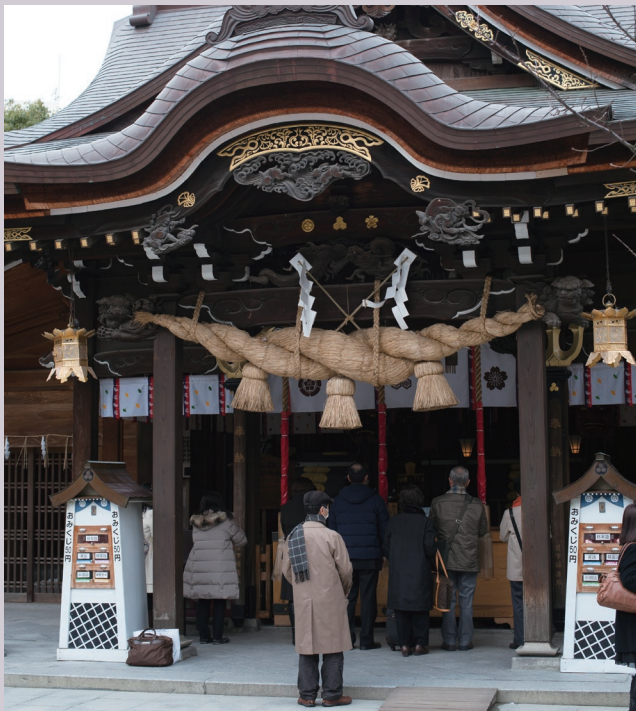
Japanese visit a Shinto shrine to pray to their god in the religion of Shinto.