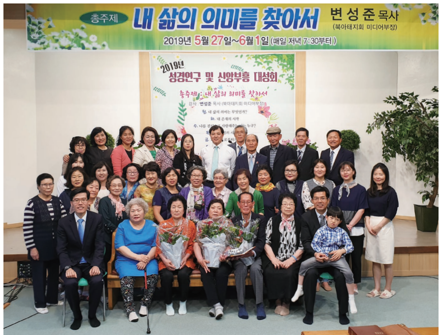
Gwangju Wolgok Church members welcomed three new members through baptism and profession of faith.