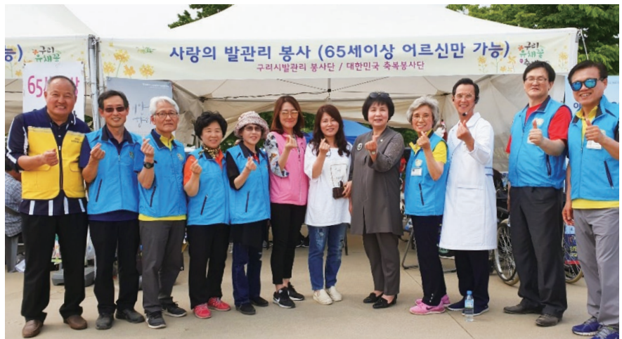
Foot care volunteers wearing blue vest uniforms