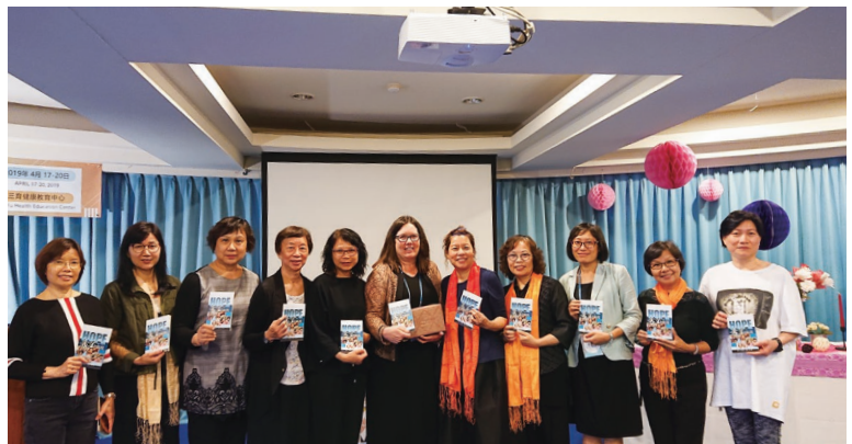
Hong Kong-Macao group with the 2019 family ministries sharing book

The family and its influence is so important! We praise God for His blessings and guidance during the past 100 years!