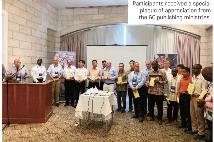
Participants received a special plaque of appreciation from the GC publishing ministries.

“Stronger Together Reaching Everyone” was the theme chosen for the 2019 week-long World Publishing House Congress. It was held in the beautiful country of Israel, a Holy Land with spiritual inspiration and historical significance.