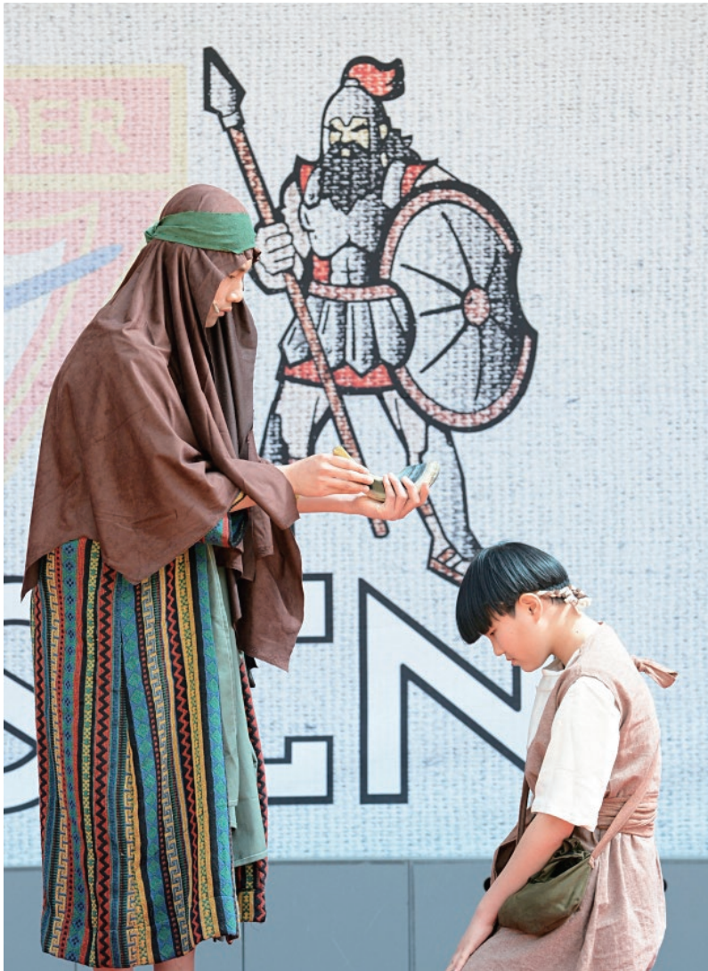
The theme of the 2019 ECKC & WCKC Pathfinder camporees was David.