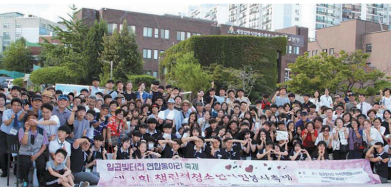
Participants of the Youth Volunteers Festival in 2018

Throughout this year, the Seven Lights Center will carry out various plans, including UCC (User Created Contents) contest on April 20, National Day of the Disabled, Youth Volunteers Festival in September, and additional training for club leaders and an award for volunteers in November.