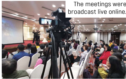
The meetings were broadcast live online.