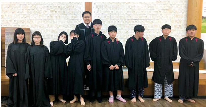
The S.O.S. Mission Movement, which is led by trained young Adventists, has borne fruits of souls in Korea.