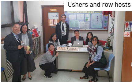
Ushers and row hosts