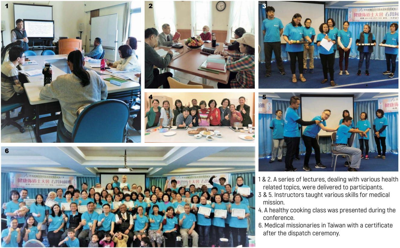
1 & 2. A series of lectures, dealing with various health related topics, were delivered to participants. 3 & 5. Instructors taught various skills for medical mission. 4. A healthy cooking class was presented during the conference. 6. Medical missionaries in Taiwan with a certificate after the dispatch ceremony.