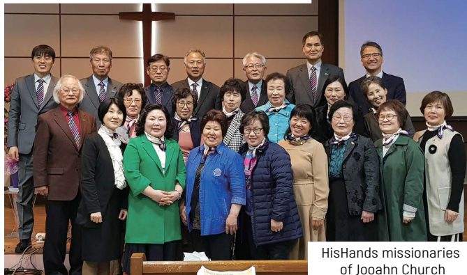
HisHands missionaries of Jooahn Church