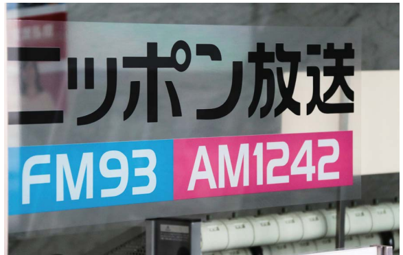
Health seminars at local Adventist churches in Tokyo are being announced through radio stations, including Nippon Broadcast, one of the biggest radio stations in Japan.