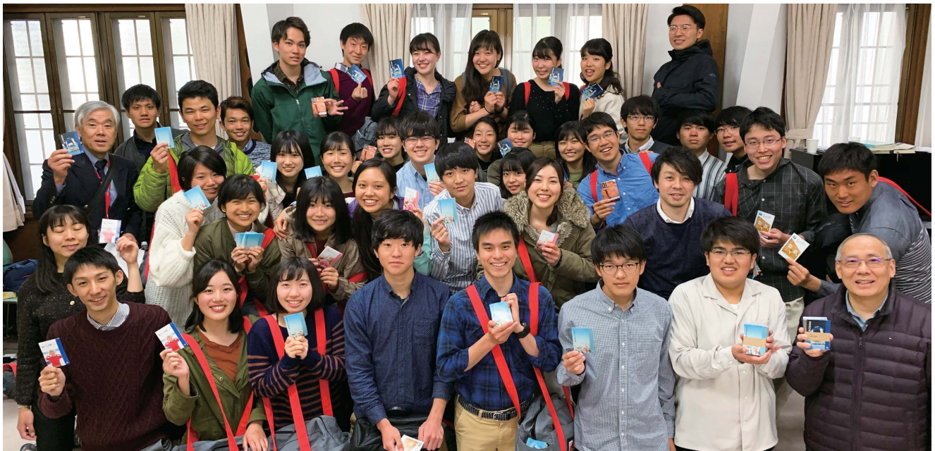
Youth Rush students are ready to go out to share the gospel through tracts and books in their bag.

“We Have in Jesus” with a beautiful melodious voice, the lady started crying uncontrollably. She was deeply touched. With tears, she kept repeating, “Thank you! Thank you! Please don’t stop what you are doing. What you are doing is amazing. Please don’t give up. Continue what you are doing!”