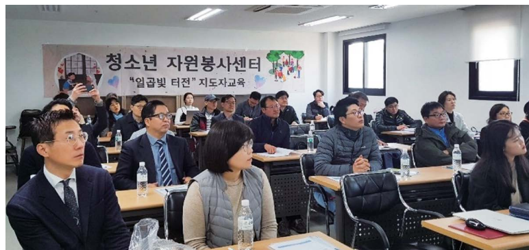
Attendees of the training for the Seven Lights Center club leaders