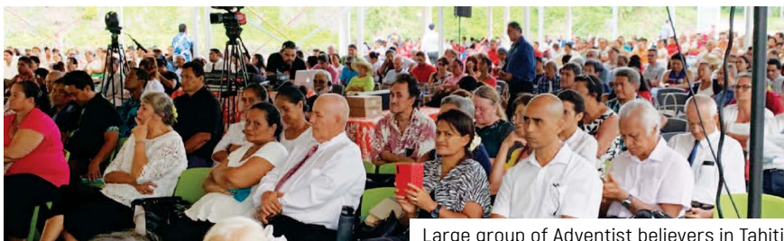
Large group of Adventist believers in Tahiti