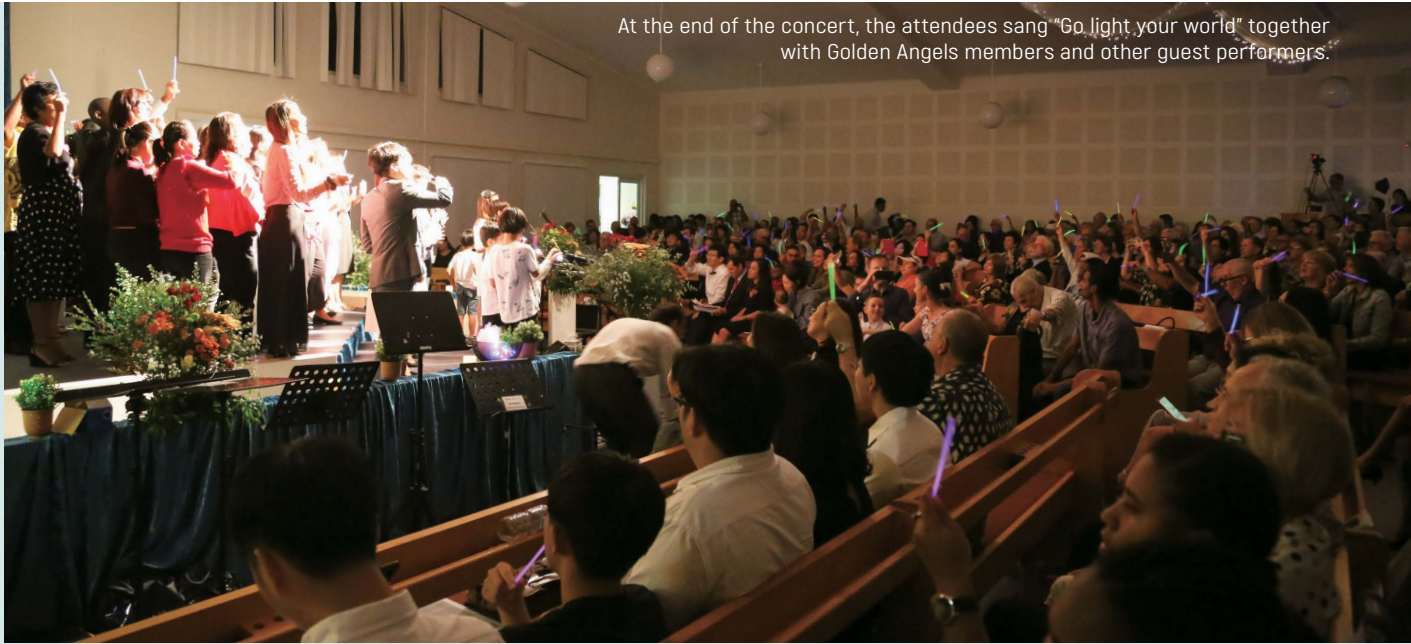
At the end of the concert, the attendees sang "Go, light your world" together with Golden Angels members and other guest performers.

impressed by the Golden Angels concert and she immediately remembered the voice she had heard that morning. She donated about 3,500 USD three days after the concert.