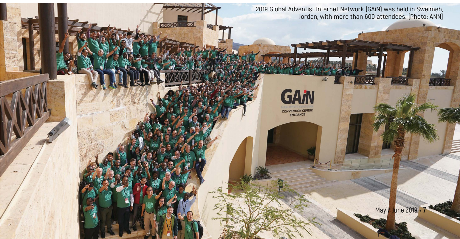
2019 Global Adventist Internet Network (GAiN) was held in Sweimeh, Jordan, with more than 600 attendees.

The 2020 GAiN Conference will be an online-only event, due to the General Conference Session. Dates are awaiting confirmation.