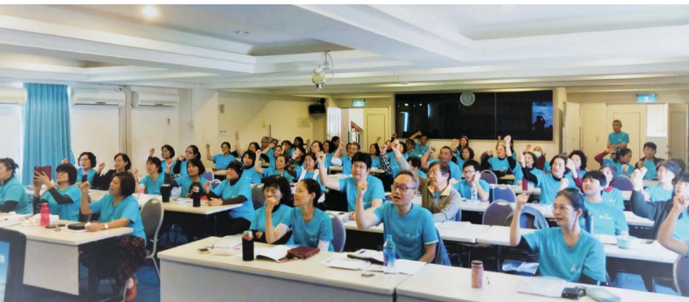
Medical missionary conference participants were encouraged to be active in mission in their local churches and community.