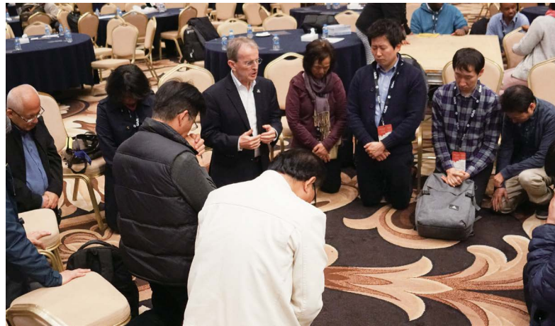
Hope Channel Network Leadership Conference attendees from Asian countries

May God bless the Hope Channel so that it can be a powerful tool in preparing more people for the second coming of our Lord Jesus.