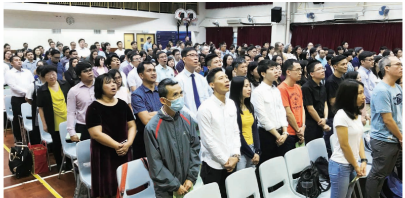
Above: About 250 teachers participated in the teachers' retreat.