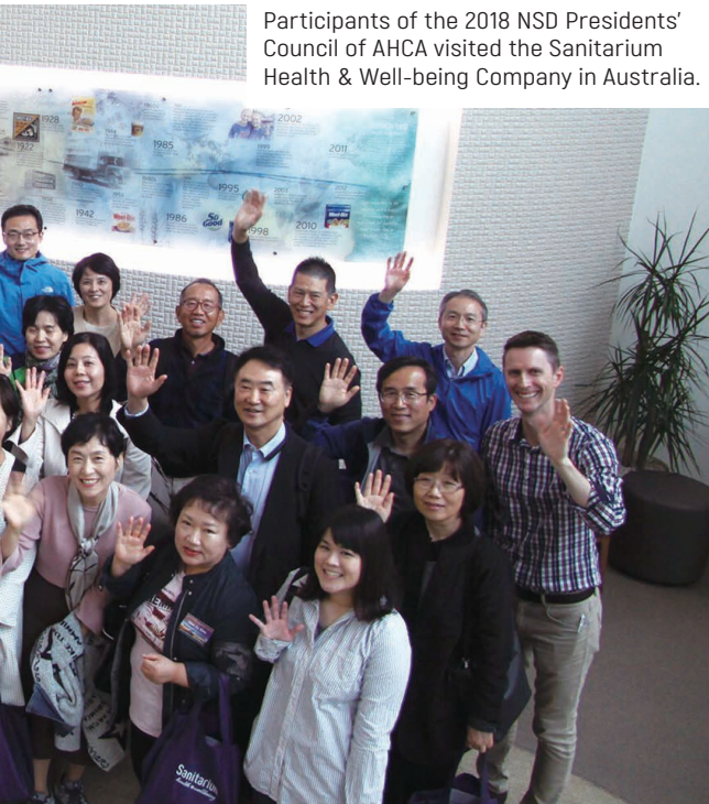
Participants of the 2018 NSD Presidents' Council of AHCA visited the Sanitarium Health & Well-being Company in Australia.

On the last day of activities, the group visited some of the Adventist historic sites in Australia, including the Sanitarium Health & Well-being Company, Avondale College, and the Sunnyside House where Ellen G. White lived for some years during her missionary trip to Australia from 1891 to 1900.