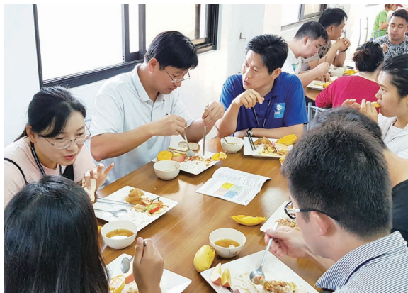
Left: CLAP participants had the opportunity to develop their English-speaking skills with the help of tutors and teachers. Right: Participants enjoyed fellowship as well as delicious food during meal time.