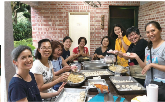
Participants of the retreat enjoyed a cooking class led by professional cooks.