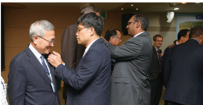
Attendees of the NSD Annual Council participated in the pin ceremony with prayers, for successful results of “TMI Evangelism 2019.”