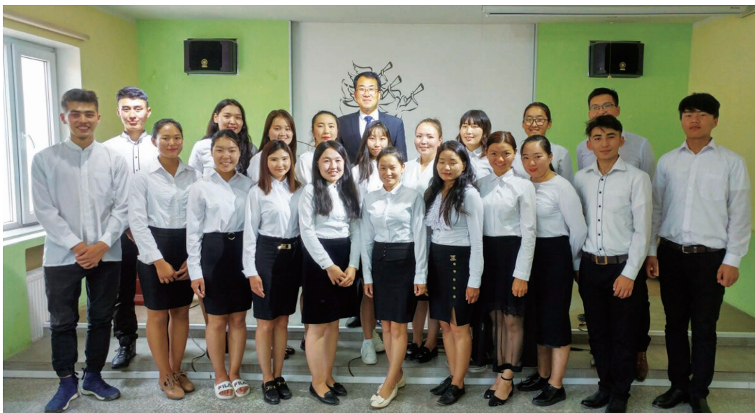
Twenty students from different areas in Mongolia moved to a newly launched missionary training center in Ulaanbaatar to serve for one year as student missionaries.

We solicit your prayers for the success of this mission program.