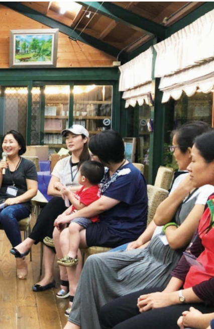
During the retreat, ministerial spouses of TWC shared their experiences and thoughts on ministry, talked about their difficulties, and encouraged each other.