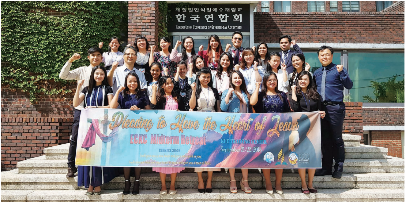
Twenty-three missionary of the ECKC participated in their annual missionary retreat, with the theme of "Pleading to Have the Heart of Jesus."

program started at 8:30 a.m. A group of missionaries presented a special feature entitled "Hang Man" during Sabbath School. They touched the hearts of the audience as they shared the story of Jesus who sacrificed His life for sinners. Then there was a lesson discussion by groups, and the missionaries got a chance to share their thoughts and reflections regarding the lesson.