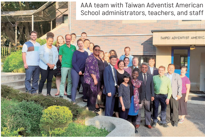
AAA team with Taiwan Adventist American School administrators, teachers, and staff

In 2018, NSD commission on accreditation conducted accreditation of 11 schools and colleges in the Division territory, both regular visits and interim visits. This is a contribution of the Adventist education to the retention of our young people.