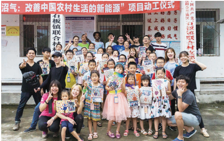
Youth volunteers spent time with children in Mianyang, Sichuan, after the biogas project.

his house, such as de-kernelling corn and sweeping up around his house. After their days of service, the volunteer group was able to enjoy the sights and spicy tastes of Sichuan as they relaxed and reflected on their trip.