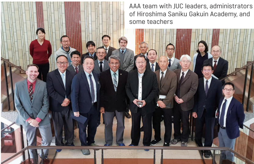
AAA team with JUC leaders, administrators of Hiroshima Saniku Gakuin Academy, and some teachers