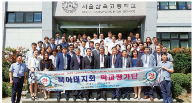
AAA team visited Seoul Sahmyook High School.

At the end of the visit, the team makes a recommendation to the Division Commission on Accreditation and AAA board, on the term of accreditation for the visited school. An exit report is given to the school administration, faculty, and staff.