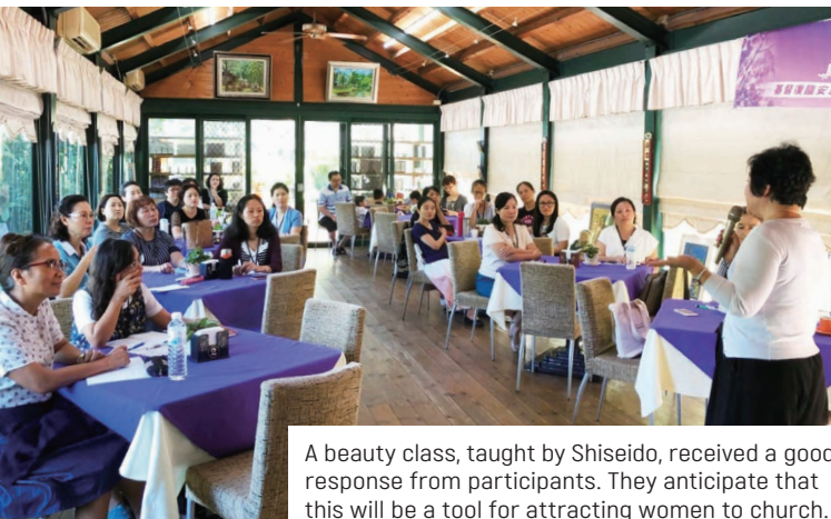
A beauty class, taught by Shiseido, received a good response from participants. They anticipate that this will be a tool for attracting women to church.