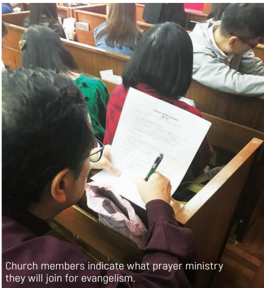
Church members indicate what prayer ministry they will join for evangelism.