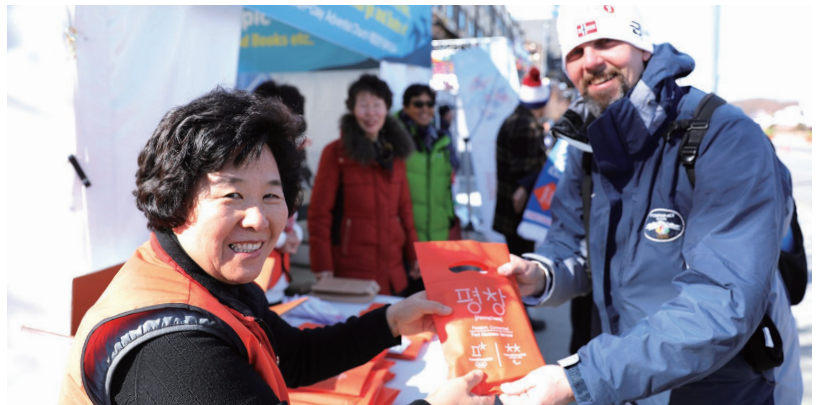
Above: HisHands missionaries gave Olympic visitors free foot massage service.