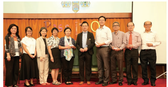
Lecturers of “Pass It On” program