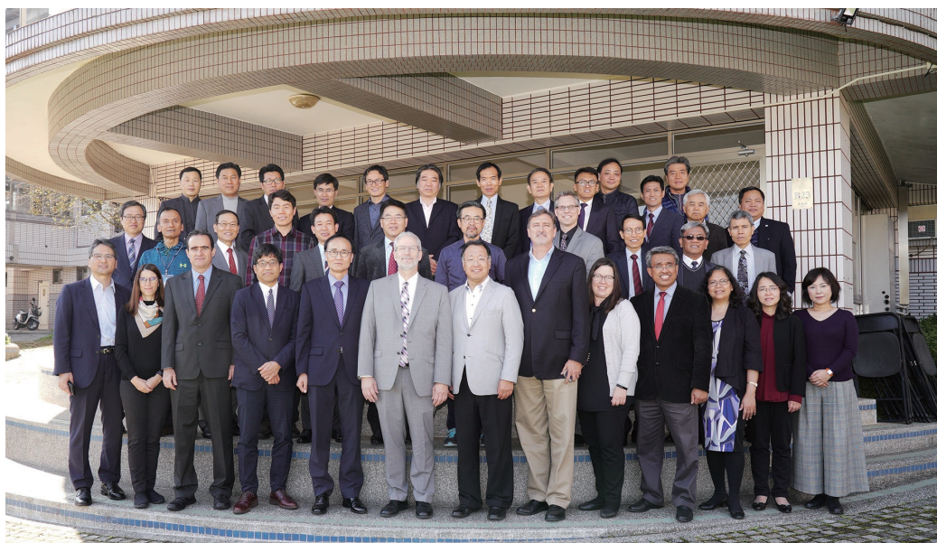
Participants of the NSD Retention Re-Emphasis meeting