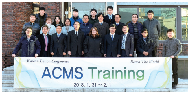
The training and implementation for the Adventist Church Membership System for JUC (left) and KUC (right)