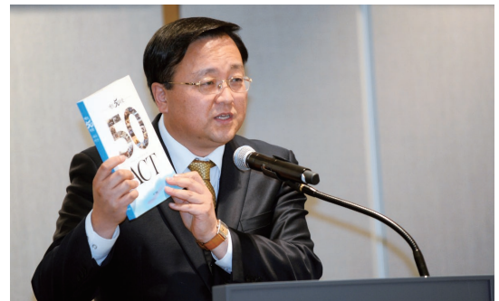
A specially made video and a book tracing the 50 years of ACT were revealed at the anniversary.