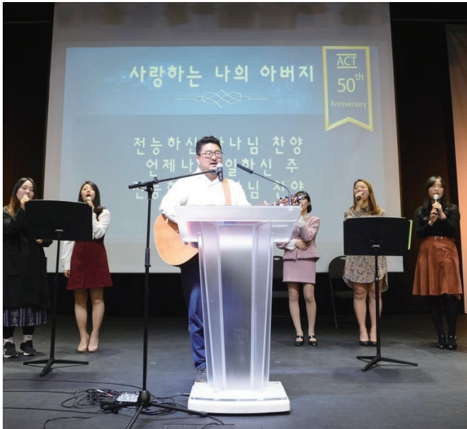
Left: Praise time at the celebration service of ACT's 50th anniversary Below: At the talk show, "Fifty Years of ACT with God," a host and four panelists talked about the history of ACT.