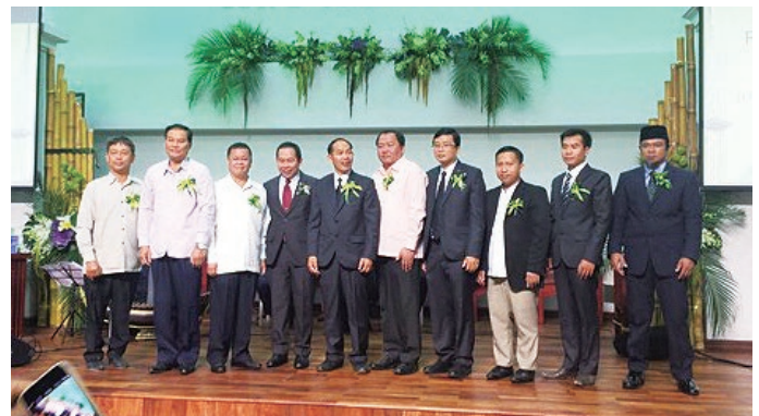
Government officials join the opening ceremony of a dental clinic.