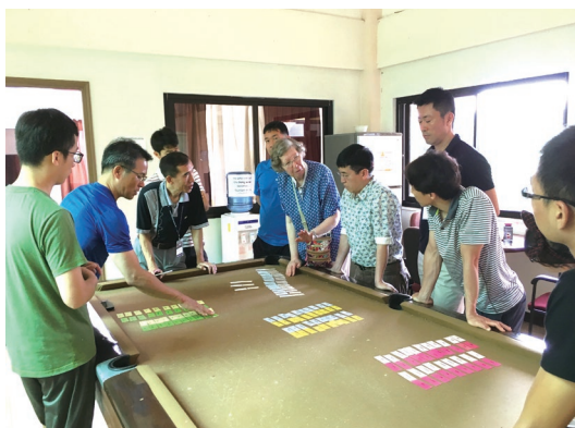
Left: CLAP participants had an opportunity to develop their English-speaking skills with help of tutors and teachers.