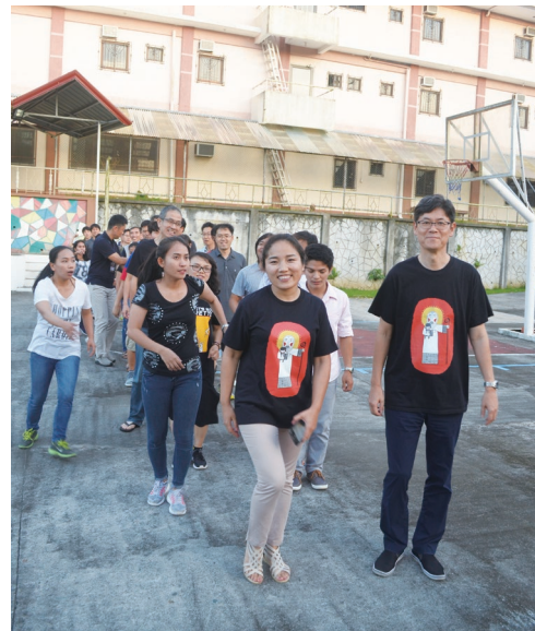
During the CLAP session, participants were encouraged to exercise every morning for their overall health.

We are grateful to God for His guidance in this past session. Next session will be the last intensive session for this CLAP 4 run. We are looking forward to meeting again with our CLAP friends. We are looking forward to discussing the questions our participants have prepared for next session's leadership topics, which will be led by NSD departmental directors, for a practical application of leadership concepts and a better understanding of how the church works in its goal of "Reaching the World." We appreciate your prayers for God's guidance in the completion of this program and also for the new group that will soon be part of CLAP run 5 (2018-2020).