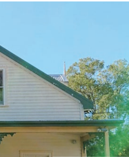
The NSD PREXAD team were inspired from visiting Sunnyside, Ellen G. White's residence for five years from 1896 to 1900.