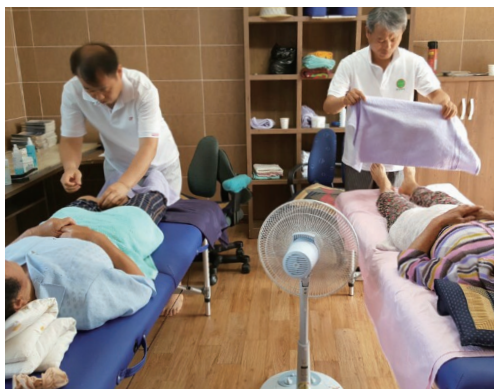
At the Pyoseon Church, foot massage served as a good way to reach people.

For this historic evangelistic series, the Northern Asia-Pacific Division dispatched nine pastors and provided a subsidy of about 22,000 dollars. Adventists on Jeju Island as well as church members in other regions prayed earnestly. God heard their prayers, softened the hearts of those on Jeju Island, granted showers of blessings, and guided the work with His almighty power.