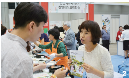
2. A missionary introduces Home & Health to a visitor.