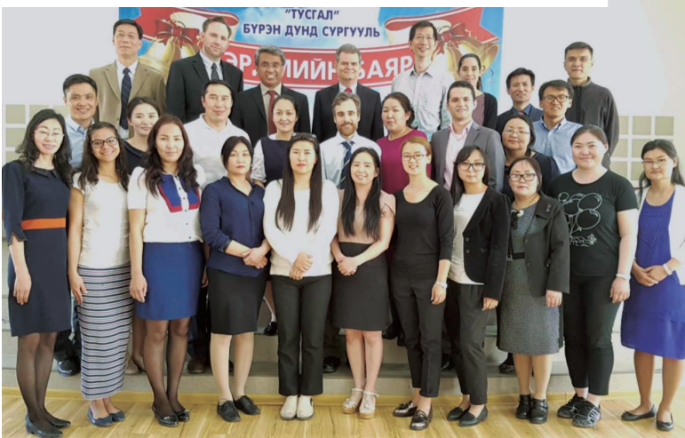
Tusgal teachers, administrators, board members, and AAA team

Two historic events just happened at Tusgal Secondary School in Mongolia. First, on May 22, 2017, it had its first graduation ceremony for the elementary level (grade 5), middle school (grade 9), and high school (grade 12). The high school produced five graduates as its first fruits! The second important event was the accreditation visit of the Adventist Accrediting Association (AAA) from May 22 to 24, 2017, which was the first ever since the school was established in 2009.