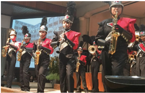
Performance by Tai Po Sam Yuk marching band received a rousing round of applause at Adventist secondary schools in Korea.

The marching band performance by Tai Po Sam Yuk won a good round of applause and cheering from the Korean audience. The atmosphere was welcoming and warm. The tour was an eye-opener for many Tai Po students who had not been to Korea. More exchanges between the schools are expected in the future.