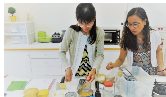
Below: Learning natural remedies was part of the training.