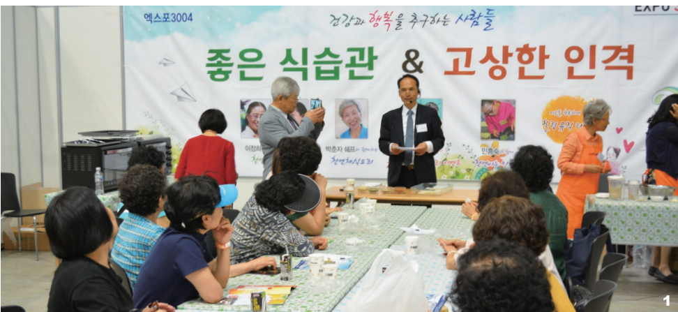
1. A seminar on natural healing was well received by Expo visitors. Daegu EXCO supported SDA Fair Mission by providing a large seminar room as well as booths.