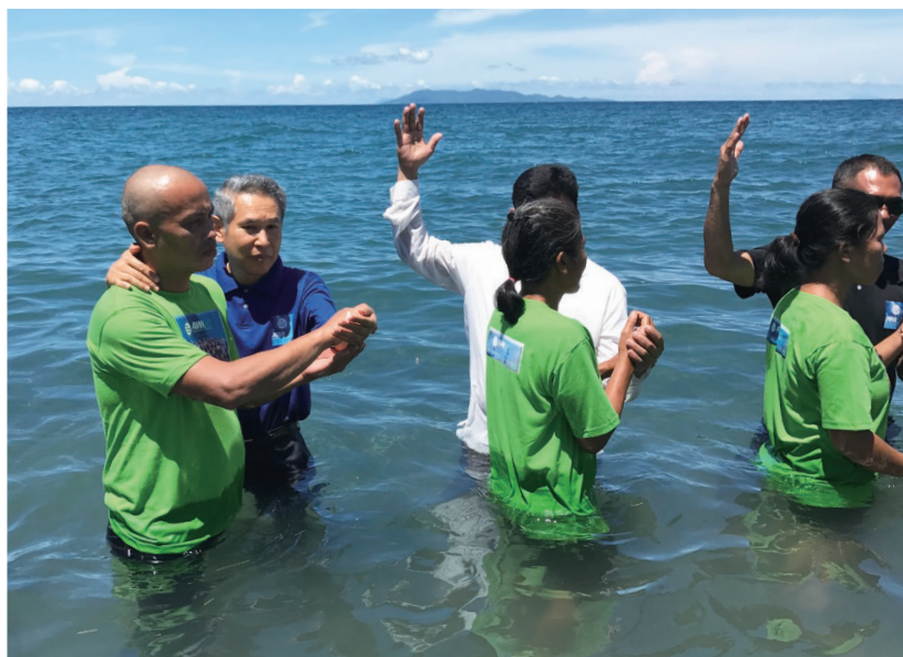
After 16 days of the evangelistic series in 48 locations all across the island of Mindoro, 868 people were reborn through baptism.

From June 7 to 25, 2017, a total of 48 people from Japan, including 26 pastors, 8 seminary students and 14 laypeople, went to Mindoro, Philippines. Mindoro is an island located south of the country's largest island, Luzon, where the capital city is located. About 1.3 million people live on this island. All across the island, each of the 48 Japanese held their own evangelistic meeting simultaneously. Speakers preached the gospel in English, which was translated into Tagalog by local church members and college students.