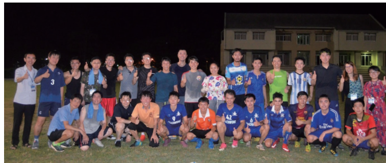
Above: It was one of the valuable opportunities for CLAP members to have a tutor for increasing English skills as well as exchanging ideas from different cultures.