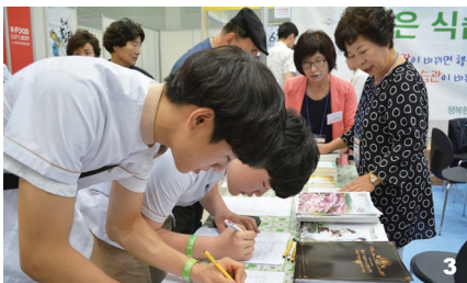
3. During the expo, 2,026 people participated in a survey, showing their interest in the booths of SDA Fair Mission.

is in his 15th year of battling against cancer, and they inquired about natural healing methods.