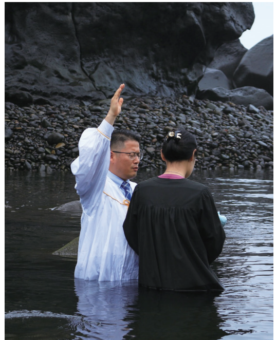
Golden Angels supported the evangelistic meetings at Seogwipo Church in Jeju. Seven souls were baptized as a result of the meetings.