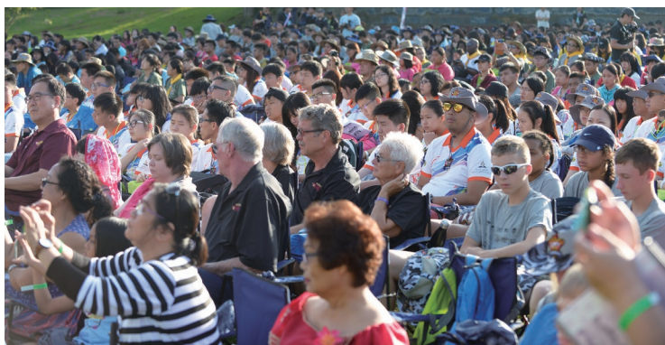
On the evening of August 8, the marching of the flag bearers marked the beginning of the second NSD International Camporee. About 2,000 Pathfinder members and leaders from 13 countries gathered at Taiwan Adventist College.