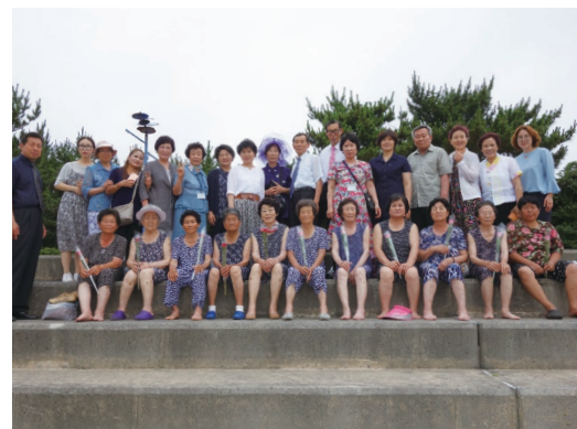
After their first evangelistic meeting in 17 years, Moseulpo Church had eleven baptisms.