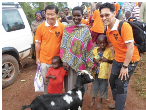
A family who had received a goat last year as a gift from the church visited the mission team.