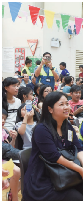
Visitors and honored guests enjoy the performances and entertainment program during the festival.