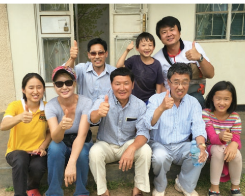
Medical missionaries from the church.

The missionaries gave away shirts with the words "Jesus Loves You. What About You?" imprinted on them to the school children. It is their hope that more people can learn about the love of Jesus when they see the children wearing the shirts.