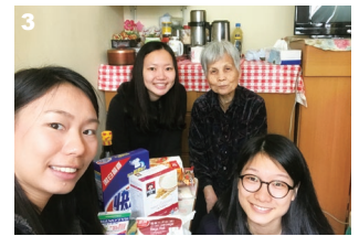
1. Donating blood was one of the HKMC's Global Youth Day activities this year. 2. Cleaning up the beaches / 3. Visiting senior citizens