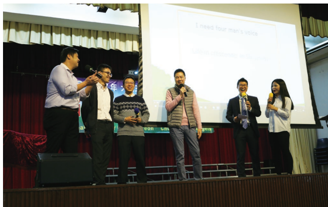
Golden Angels had a chapel at Taipo Sam Yuk Secondary School.