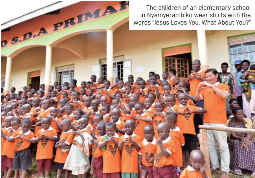
The children of an elementary school in Nyamyembiko wear shirts with the words "Jesus Loves You. What About You?"

More than 700 people benefited from the medical treatment offered by the mission team. There were people who had traveled all the way from Tanzania, which took them five days. These people came after listening to a radio program. Among them were some who were critically ill.