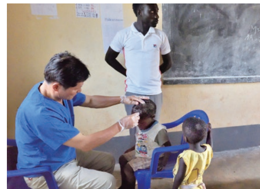
More than 700 people received medical treatment.