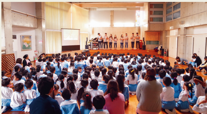
Golden Angels sing praise songs at Hukumasu Kindergarten.

During the second week, we participated in a crusade meeting held in Chiba, Japan. This was the second time we were meeting there this year. Before noon, we sang and distributed invitation flyers on the street. In the afternoon, we visited several facilities. It was especially meaningful revisiting the two