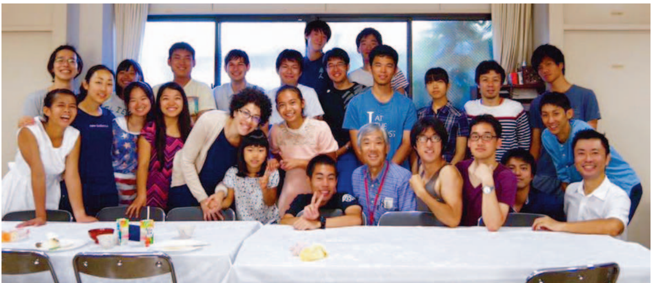
A total of 25 students in Tokyo and Shizuoka participated in the Youth Rush Japan programs in Summer 2016.