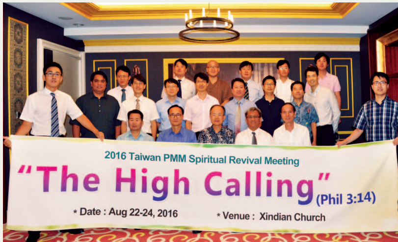
15 PMM missionaries in Taiwan had valuable time during the PMM Spiritual Revival Meeting.