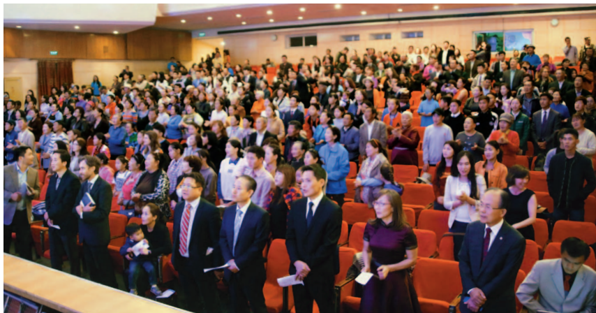
The joint service was held on the last day of "Mission 16" at Labor Union Palace, Ulaanbaatar.

on what kind of activities would work well for the local population. Altogether 14 people were baptized in this church. Earlier this year, the church had had only seven members and they had been meeting in a small two-room apartment. Through God’s blessing, an average of 70