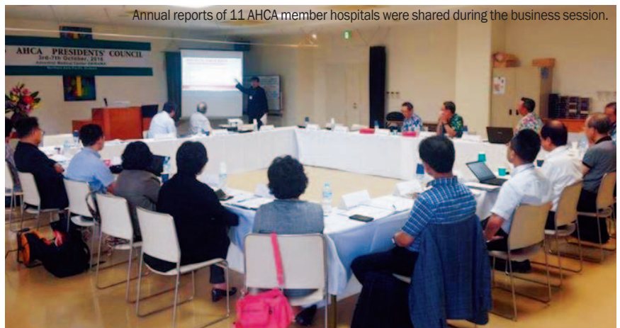
Annual reports of 11 AHCA member hospitals were shared during the business session.

AHCA is the umbrella organization over all the Adventist healthcare institutions within the Northern Asia-Pacific Division. The purpose of AHCA is to provide coordination, services, advice and networking among hospital administrators.