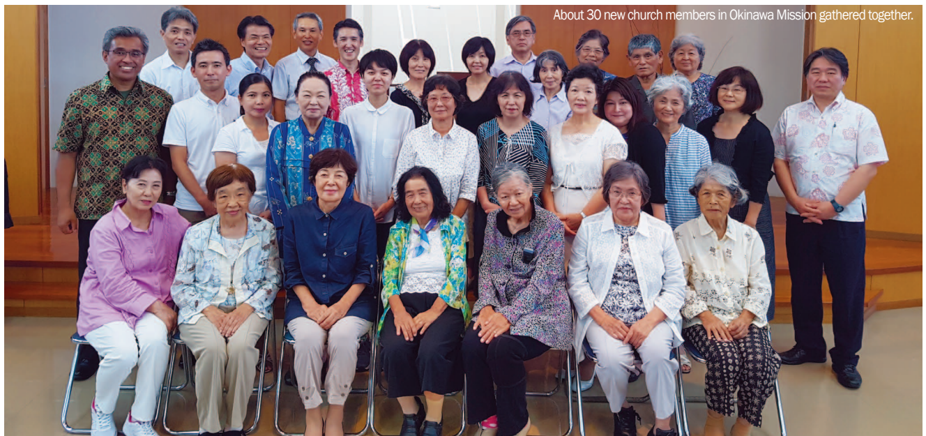
About 30 new church members in Okinawa Mission gathered together.

The program brought together new members from different local churches so that they could get to know each other and share their challenges and happiness. It also helped them to become better assimilated into the Seventh-day Adventist Church, which is vital for retention in the church.