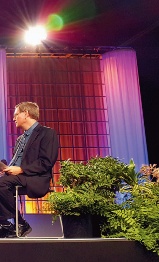
was invited on stage to share a mission project from the NSD.