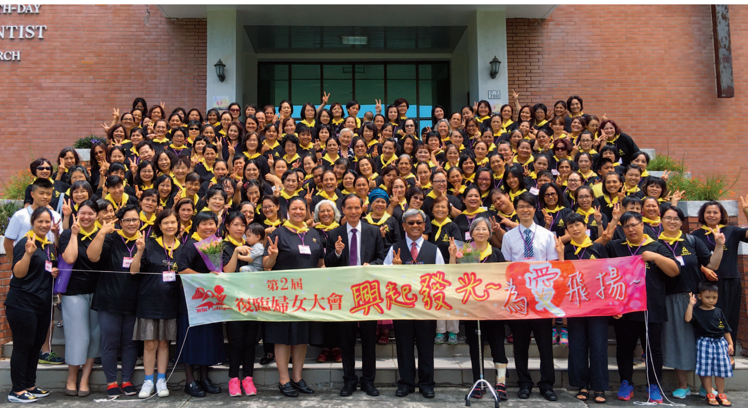
More than 200 people attended the Taiwan Conference Second Women's Congress.