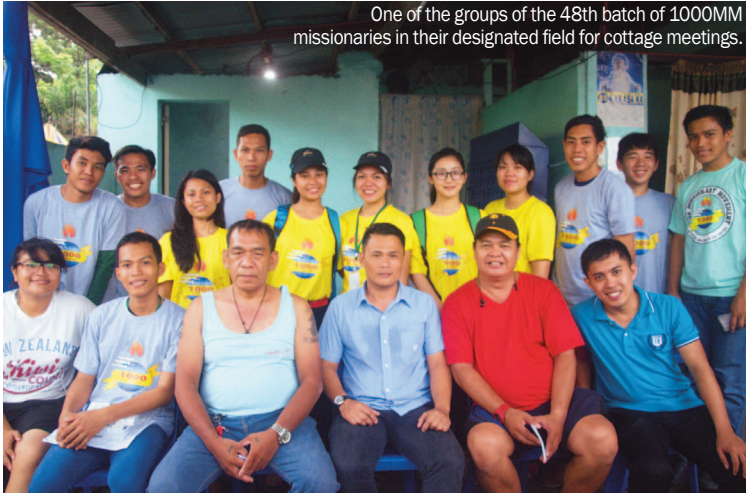
One of the groups of the 48th batch of 1000MM missionaries in their designated field for cottage meetings.