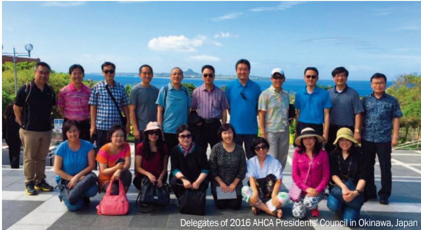
Delegates of 2016 AHCA Presidents' Council in Okinawa, Japan

The 2016 Presidents' Council of the Adventist HealthCare Association (AHCA) was held from October 3 to 7, 2016, on the beautiful island of Okinawa, Japan. About 25 Adventist hospital administrators, medical doctors, department heads, and guest speaker representing 11 member hospitals from the Northern Asia-Pacific Division joined the council.