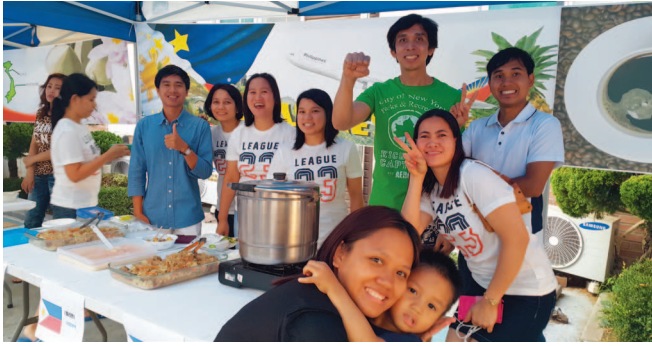
The Philippines team participated in a multi-cultural cooking contest hosted by MFSC.