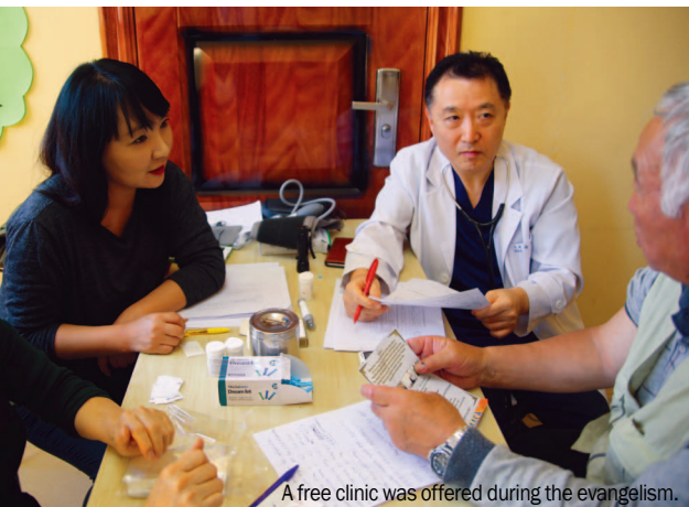
A free clinic was offered during the evangelism.

As the result of the total member involvement of all seven members of the church and by the abundant grace of the Lord, 14 people were baptized and three are waiting for the upcoming baptismal ceremony. An additional 13 people began to attend the church. From 7 members to 37 is surely a miracle from the Lord.