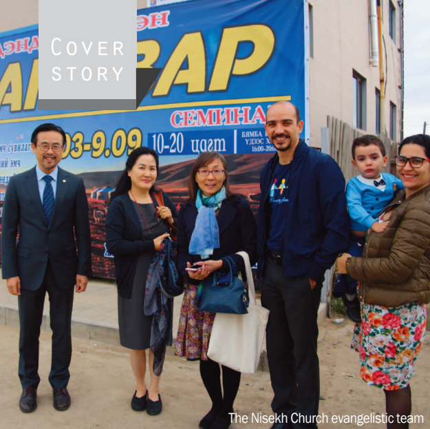
The Nisekh Church evangelistic team