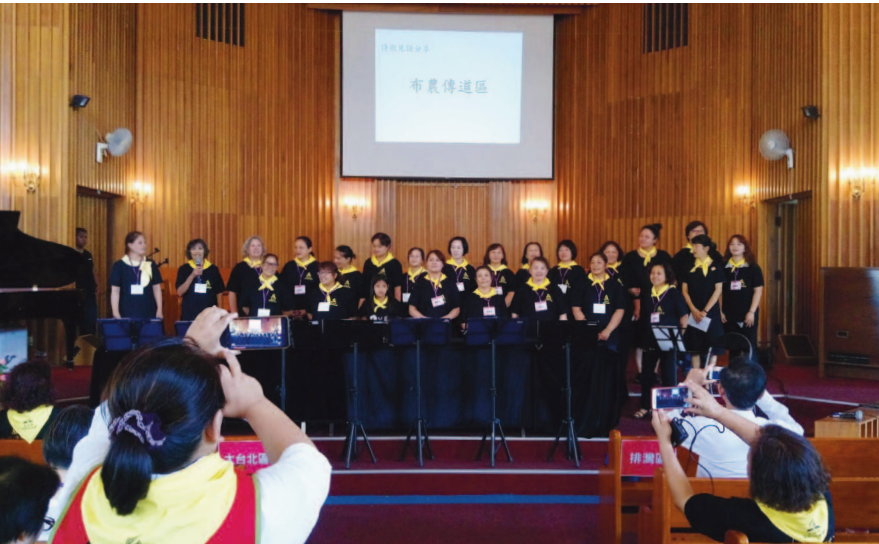
A group of women give a special song at the congress.