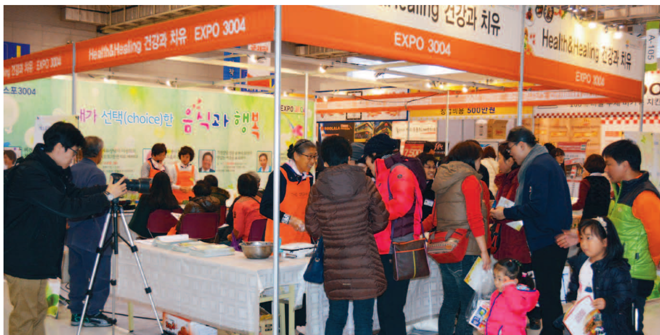
Many people visit the SDA Fair Mission booth and show an interest in health messages and healthy cooking.