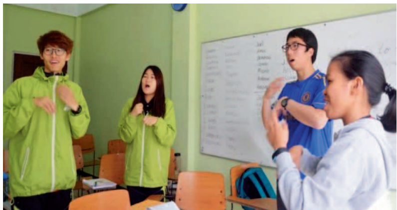
Above: Group of 1000MM missionaries undergoing English language training Below: 1000MM missionaries learn English praise songs.