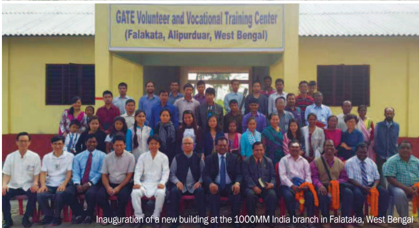
Inauguration of a new building at the 1000MM India branch in Falakata, West Bengal

was no construction sound to be heard. We prayed to God seeking His help diligently. We were on our knees day and night, and we believe that our Lord was always beside us holding our hands.