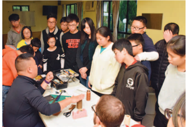
Pathfinders could learn various skills and knowledge from honors classes.

By the grace of God, the camporee was a success. The Pathfinders learned about the “Power of One,” and they