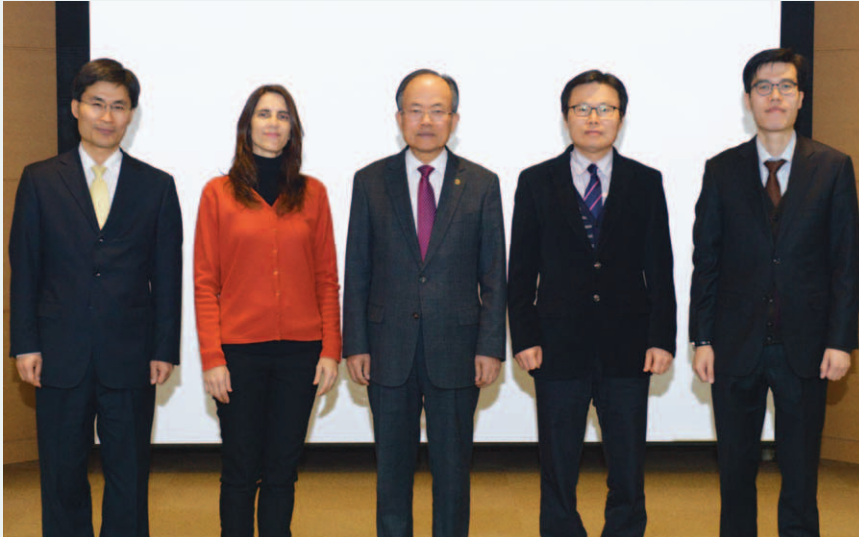
The five speakers of the NSD Week of Spiritual Emphasis