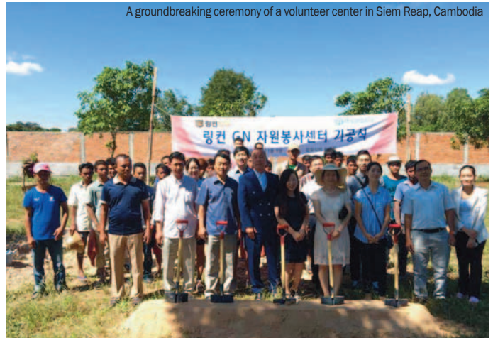
A groundbreaking ceremony of a volunteer center in Siem Reap, Cambodia

ADRA Korea used to operate in Pusat, the northern part of Phnom Penh, but this year, it changed its strategic location to Siem Reap. Siem