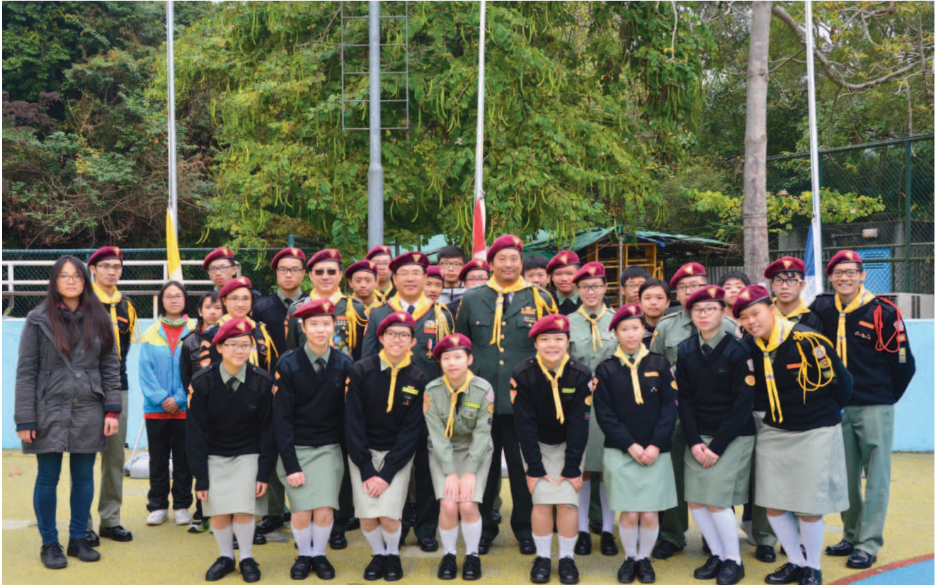
A group of Pathfinders and leaders who participated in the camporee held by HKMC