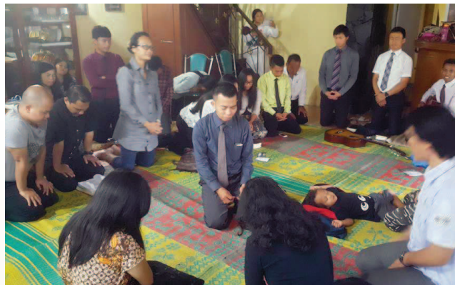
Members of a local church in Indonesia have a prayer meeting.

Exactly five minutes later, I received a phone call from my wife. "Honey, praise the Lord! An elder called from Korea, and he wants to give a donation so that we can purchase a car."