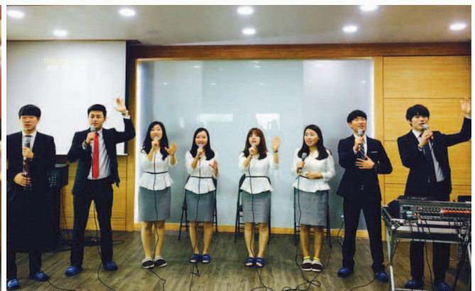
Golden Angels visit the Jingok Countryside Church in Korea.