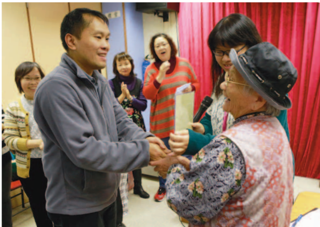
The elderly give a heartfelt thanks to CHUM staff members.

On December 15, 2015, three groups of Chinese Union Mission (CHUM) staff headed for three elderly centers operated by the Hong Kong-Macau Conference (HKMC). They were joyfully carrying boxes of small gifts. Their goal was to share the love and care of Christ with the elderly as Christmas drew near.