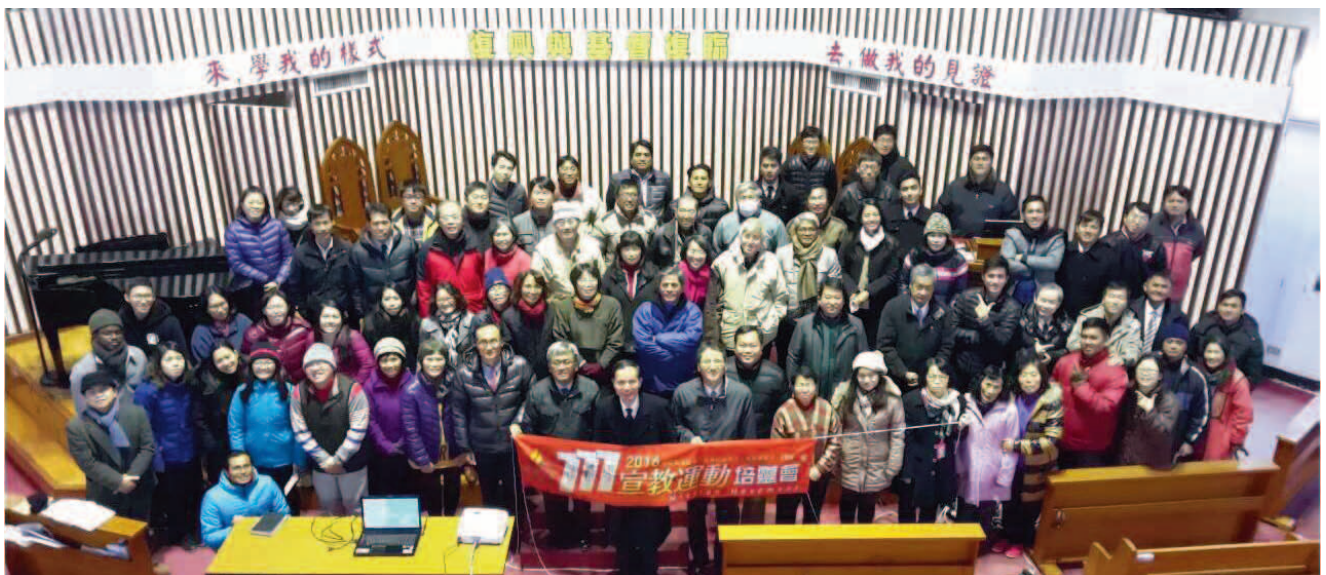
President of Taiwan Conference