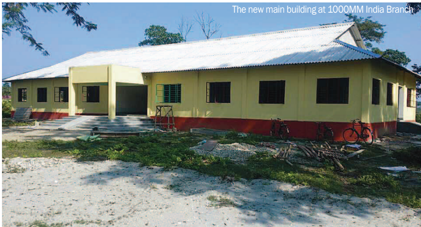
The new main building at 1000MM India Branch