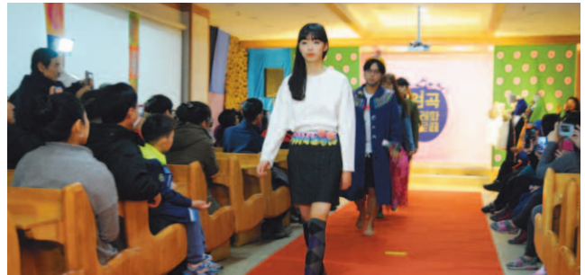
Above: The Russian team won the cooking contest with their traditional potato salad. Below: Models walk on a runway at the MFSC fashion show.