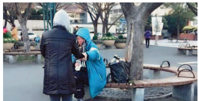
Missionaries give out food at the Busan train station

We continued giving out food to others. Noticing this, more homeless people started to come, surrounding us. One man said, "The two of you are not Koreans, but you