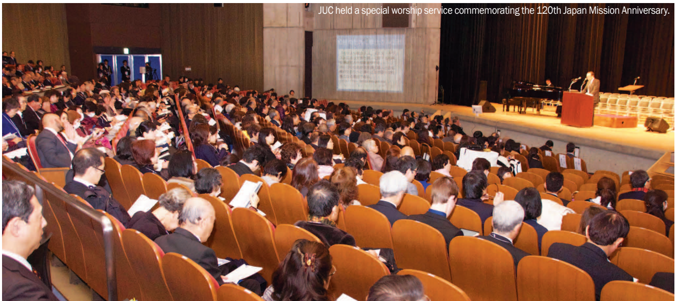
JUC held a special worship service commemorating the 120th Japan Mission Anniversary.

season." However, through the reports given by the JUC president and other executive leaders, we were able to see God's grace and leading in the work of evangelism in Japan. We had a time of repentance and thanksgiving. In the year 2012, Japan had the lowest number of baptisms. Since then, we have had three consecutive years of growth in the number of baptisms. Amid the severe winter season, God has given us hope.