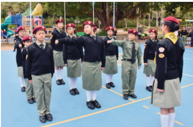
A Pathfinder club holds marching and drill presentation.

The Pathfinder and Adventurer Camporee of the Hong Kong-Macao Conference (HKMC) was held from December 27 to 30, 2015, at a beautiful resort campsite in Sai Kung, Hong Kong. About 200