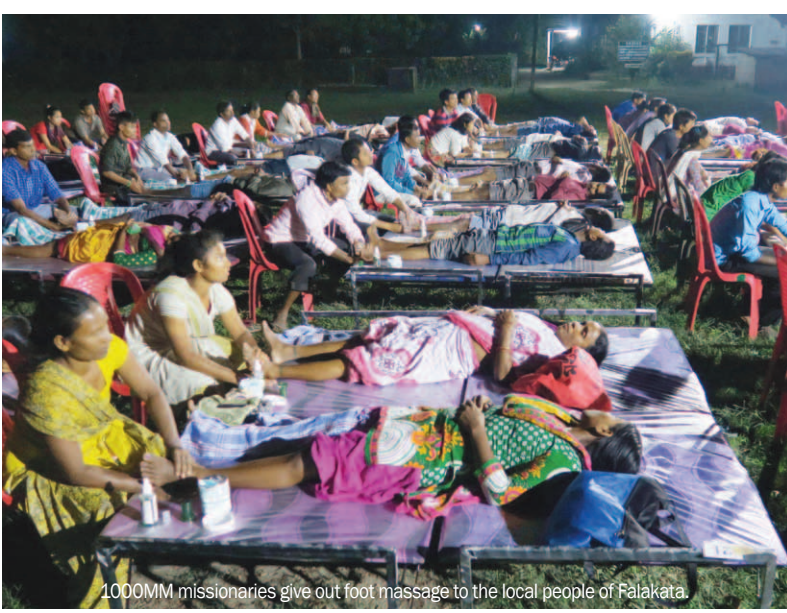
1000MM missionaries give out foot massage to the local people of Falakata.

We hope that the local people will receive the gospel of God and His love. We pray that one day they will accept God as their personal Savior. It is our motto to share His love with those who do not know the living God.