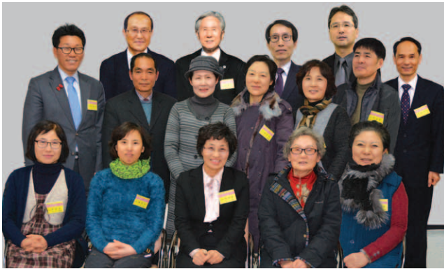
SDA Fair Mission missionaries with speakers of the workshop