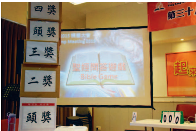
Above: Elder David Ripley (right) serves as the main speaker at the camp. Below: Camp participants could Bible games.

A total of 264 people attended the three-day meeting, including 37 children and young people. They were provided with meaningful and fun activities suitable for their age.