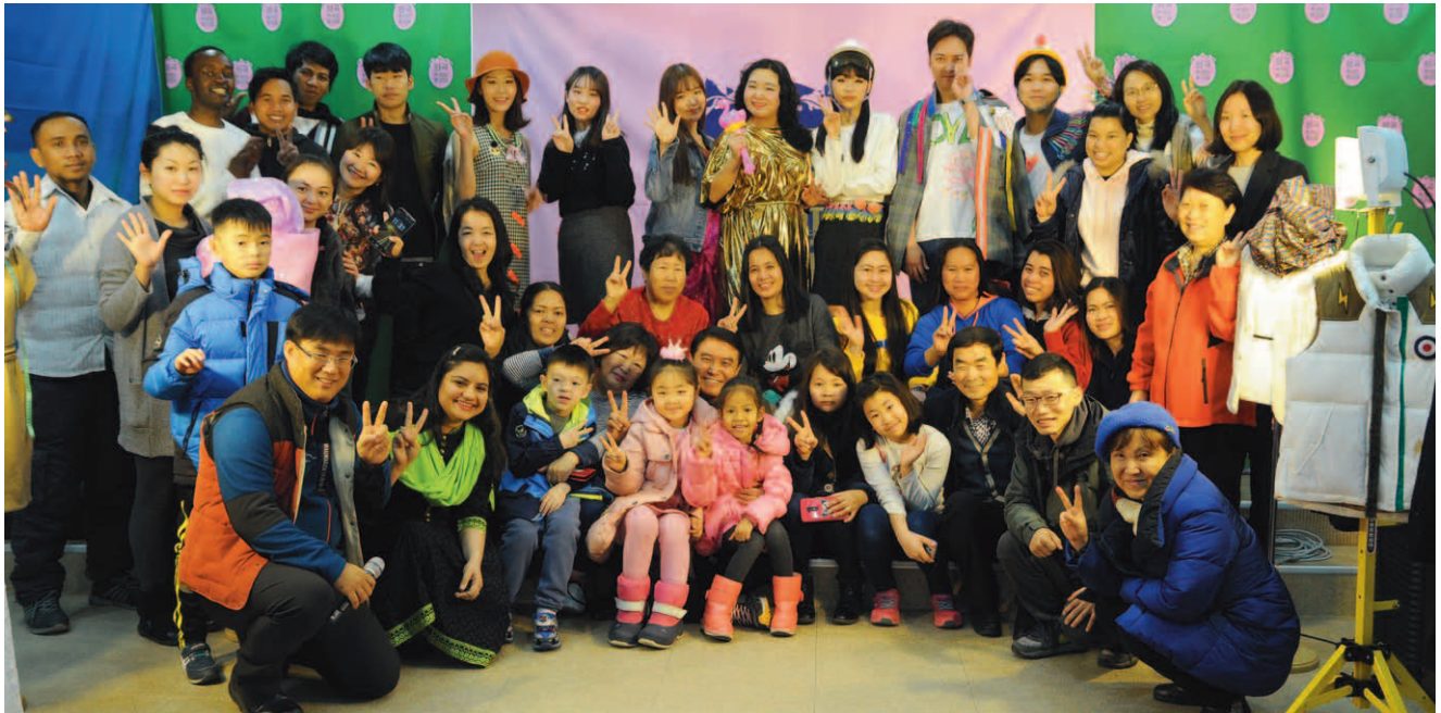
MFSC families after finishing their fashion show

It has been seven years since the MFSC was established and started reaching out to foreign workers and multicultural families. Some of them were suffering from fraud, delayed payment of wages, assault, and a feeling of alienation. The MFSC will continue trying to help them to live happier lives and to ultimately share God's love with them through the different activities.