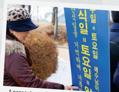
A passer-by reads the words on the banner, "Sabbath=Saturday=The Seventh Day/ Remember the Sabbath day by keeping it holy."