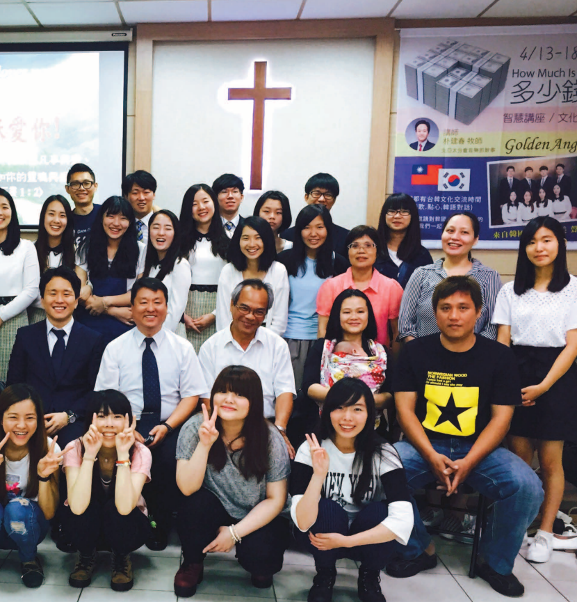
Left: Taiwan Beitun Church members Below: The Golden Angels are busking in the city of Beitun.