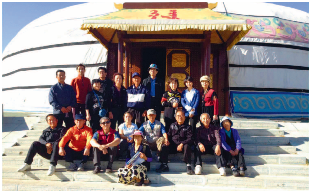
A group of people visit Mongolia in order to evangelize people there with tracts and books.

There were three un-entered counties in the southeastern part of Korea. Last year, this group visited these three counties with booklets and tracts. They did not skip a single house as they searched for seekers. As a result of their effort, by the grace of the Lord, they were able to establish three congregations in each of the previously un-entered counties in the Southeast Korean Conference with the aid of Global Mission