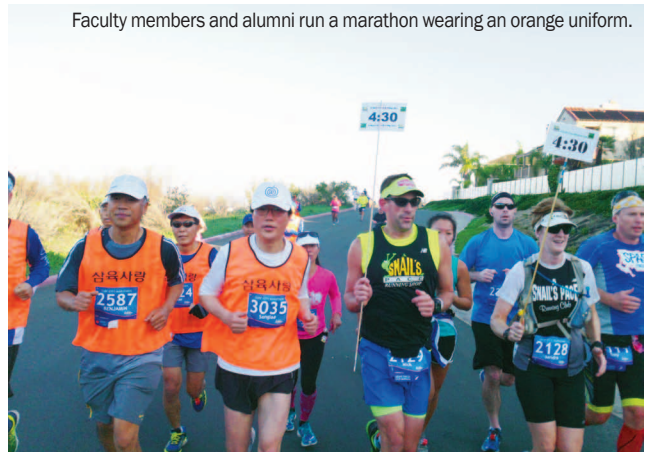
Faculty members and alumni run a marathon wearing an orange uniform.