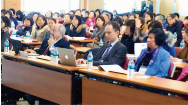
Attendees of a Vegetarian Nutrition Conference