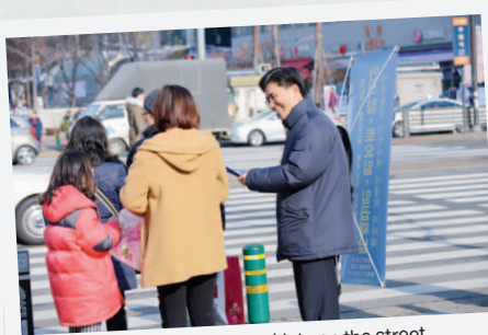
Mr. Song hands out booklets on the street.