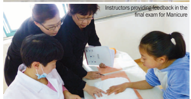
Instructors providing feedback in the final exam for Manicure