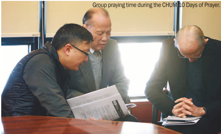
Group praying time during the CHUM 10 Days of Prayer.