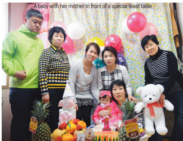
A baby with her mother in front of a special feast table