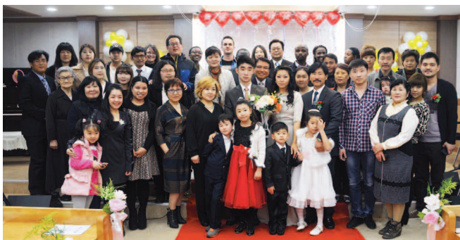
A Korean-Russian couple gets married with congratulations from wedding guests.