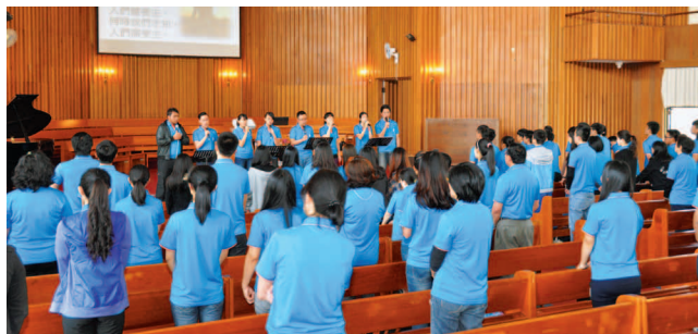
HHMM missionaries have a praise and worship session.