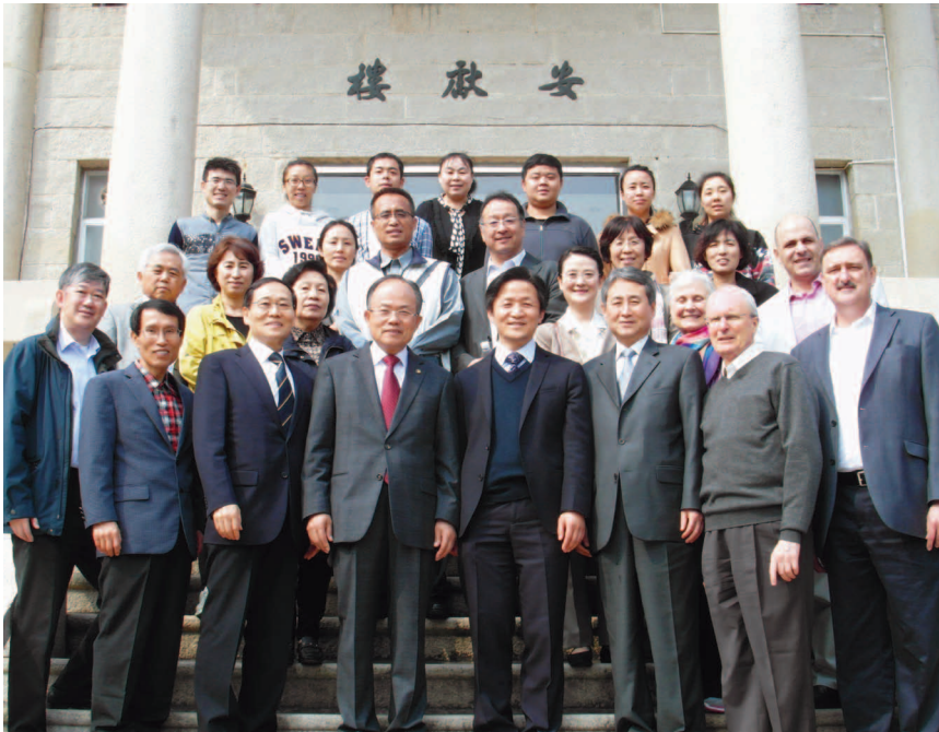
A group picture of 2015 NSD PREXAD delegates