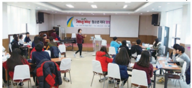
Twenty youth leaders participate in the MWKC Youth Leader Training School