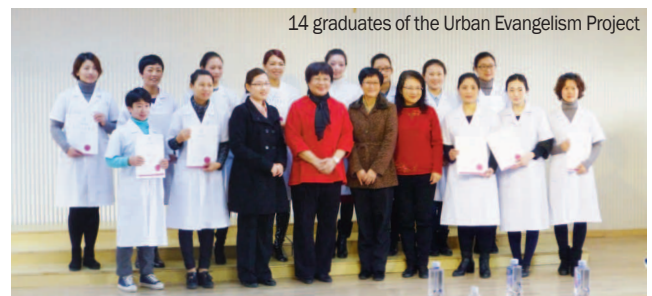
14 graduates of the Urban Evangelism Project

Next in the lineup is Mongolia Mission, which is gearing up its preparations to hold an urban evangelism course in June and August 2015. This novel project, which holds great potential, is being funded primarily by the NSD in cooperation with the local union/mission and women's and family ministries departments of the General Conference.