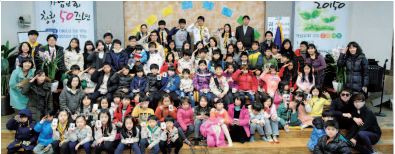
105 Pathfinders from eight clubs in the East Gyeonggi area gathered together.