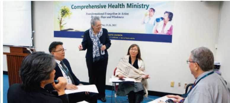
Delegates create a plan for comprehensive health ministry.