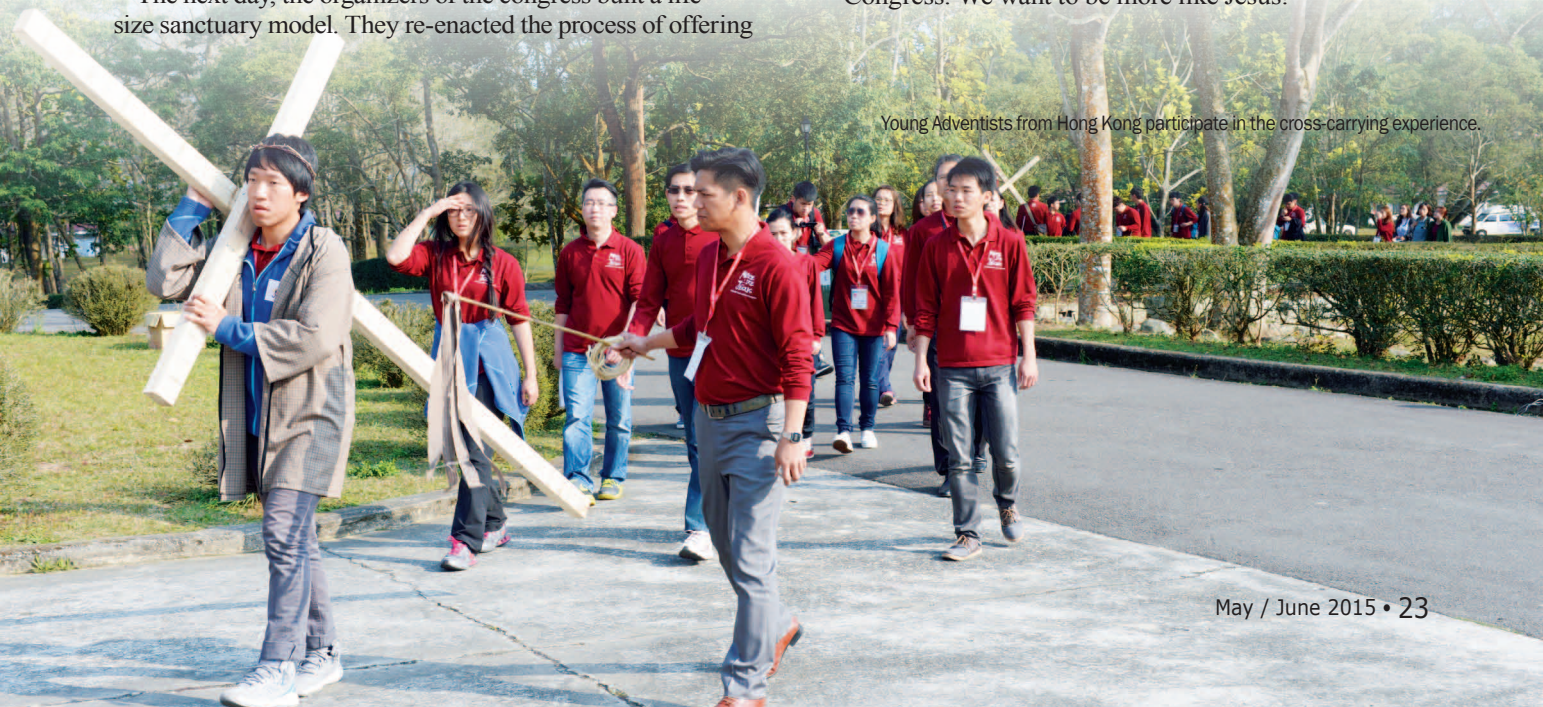
Young Adventists from Hong Kong participate in the cross-carrying experience.

We were blessed by the first NSD Youth Leadership Congress. We want to be more like Jesus!