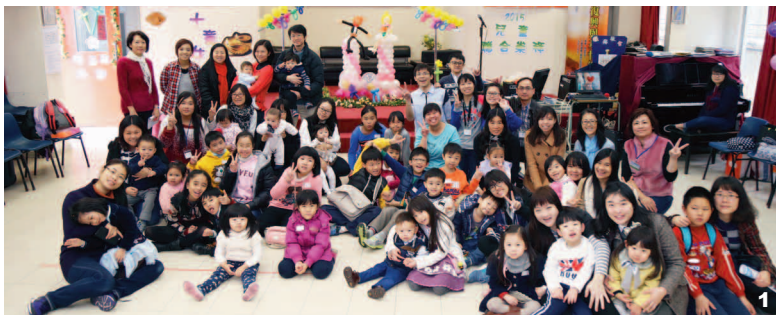
1. New Year worship for the kids/ 2. Special music at the united worship 3. Church members of Hong Kong-Macau Conference

Indeed, the United Worship Service wrapped Adventists in Hong Kong with the word of God and the love of Christ.