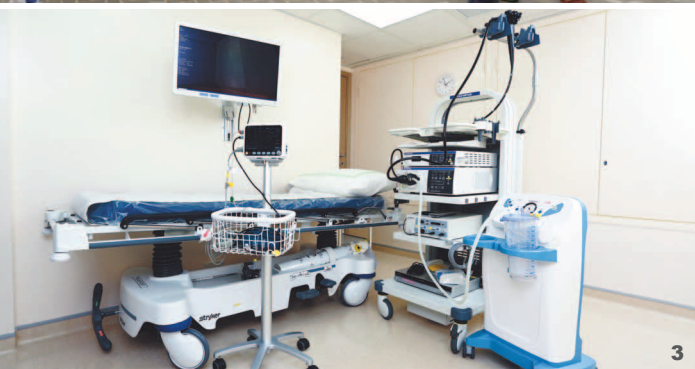
1 & 2. Last Christmas, Adventist volunteers from Hong Kong Adventist Hospital, Tsuen Wan Adventist Hospital, and other institutions had an event at ferry piers. 3. Hong Kong Adventist Hospital opened a new clinic at Causeway Bay.