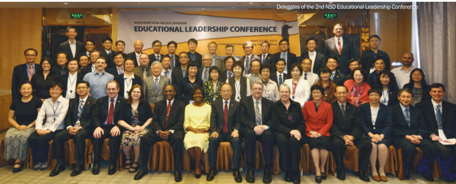
Delegates of the 2nd NSD Educational Leadership Conference