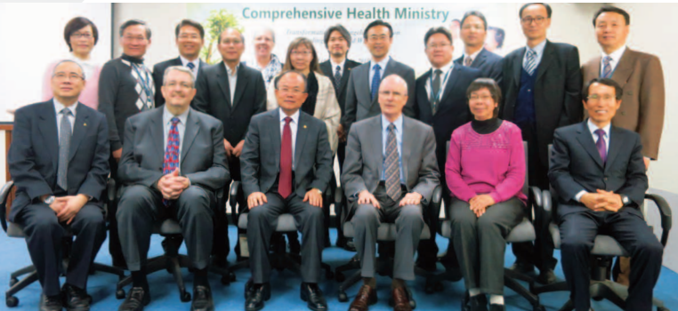
The Ministerial and Health leaders in the NSD territories.