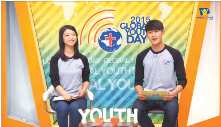
KUC broadcast a special 2015 Global Youth Day program through satellite.