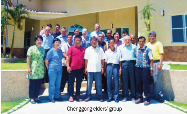
Chenggong elders' group