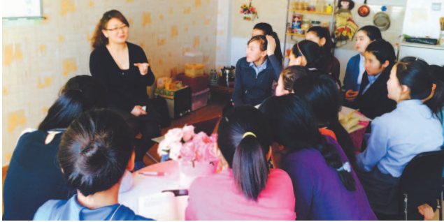
The ages of the seminar participants range from 11 to 18 years old.