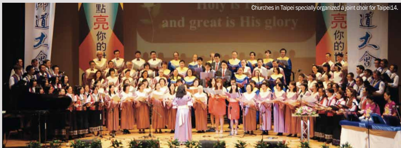
Churches in Taipei specially organized a joint choir for Taipei14.

The last day of Taipei14 was November 1, 2014, and 1,600 members from all the churches in Taipei and