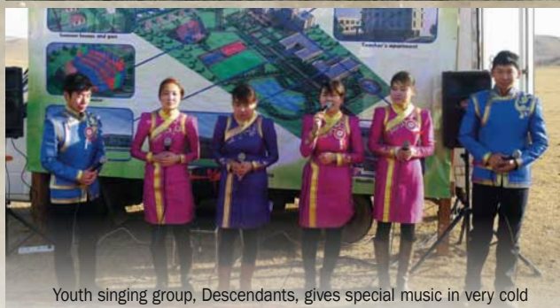
Youth singing group, Descendants, gives special music in very cold -15° C weather wearing Mongolian traditional dress.