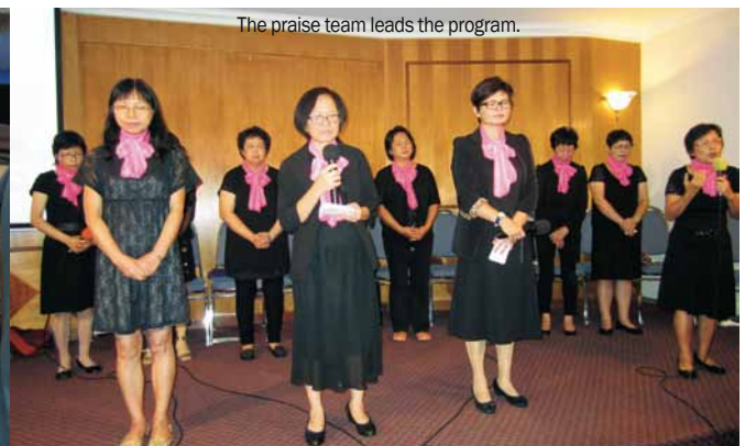
The praise team leads the program.