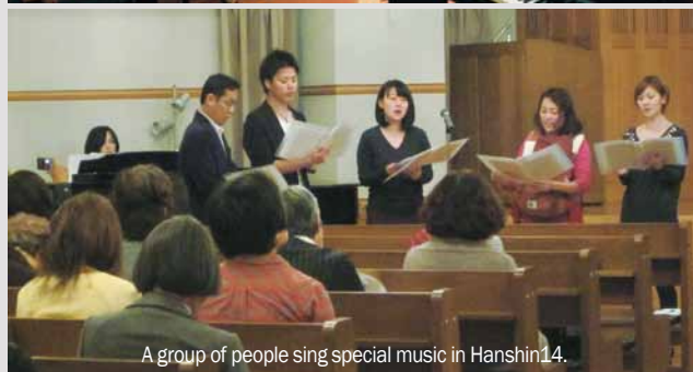
A group of people sing special music in Hanshin14.

The MTC evangelism organizing committee of Hong Kong-Macau Conference would like to thank God and to also express many thanks to all the participants from various churches, institutions and schools who contributed their effort to make the meetings successful.