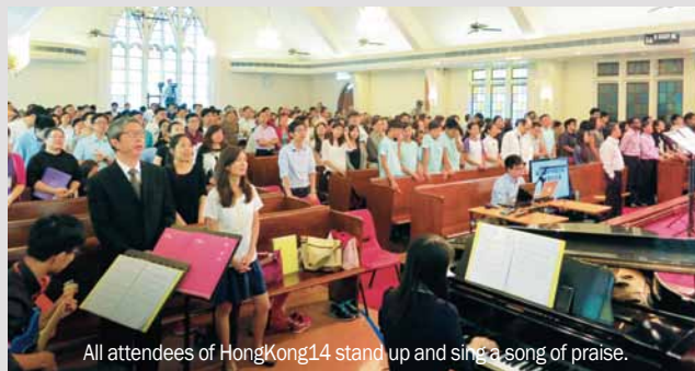
All attendees of HongKong14 stand up and sing a song of praise.

Churches, schools and many young people and children plus elderly members participated in this evangelistic series by giving special music, worship dance, and skits. Every night an average of 30 children came for the children’s classes. During the eight nights of meetings, an average of 300 adults attended the meeting. About 20 percent of those who attended the meetings were non-Adventists. By the leading of the Holy Spirit, at the end of the Hong Kong14 MTC evangelistic series, 12 people were baptized and four accepted Adventism by profession of faith. Two of the newly baptized members were more than 90 years old. More than 20 people also made a decision to join the Bible study class on a regular basis.