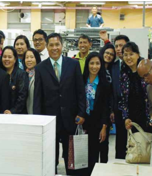
Staff members from 1000MM headquarters visit Sijosa, the Korean Publishing House