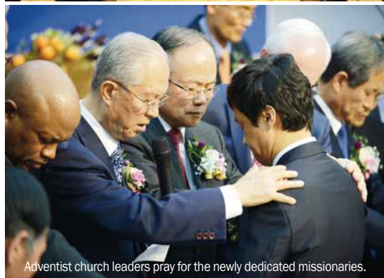
Adventist church leaders pray for the newly dedicated missionaries.