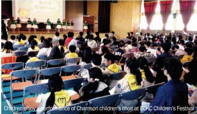
Children enjoy a performance of Chamsori children's choir at ECKC Children's Festival

The Children's Ministries Department at the East Central Korean Conference (ECKC) held a festival of God's Word for children at Seoul Sahmyook Elementary School on October 25, 2014, with attendance of 352 students and teachers. The festival began with the children's sermon. Four children representing each district in ECKC area delivered God's Word through their sermons. After that, there was a program called "Bible Adventurer," which had children visit twenty-two booths and carry out the tasks. As the program was based on the children's Sabbath school lessons, children could review and experience what they had learned. The event finished with an awards ceremony. Certificates and memorial pins were given to those who had achieved a score of 70 or more on the certification test, which included reciting 52 memory verses and Bible verses in Adventists' Fundamental Beliefs for Children .