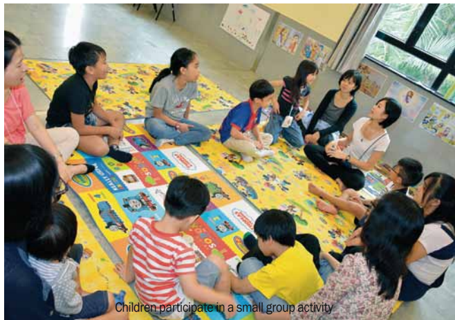
Children participate in a small group activity