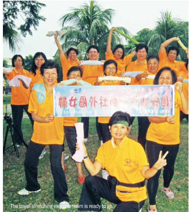
The towel stretching exercise team is ready to go.

In Kuala Lumpur, the group was able to visit the Chinese Church and conduct their program in two locations as well as participate in a City Health Promotion Day in the community. They received a lot of positive responses especially for the music and testimony program. They proclaimed how God performed miracles in their lives, helped them detach themselves from bad habits, healed them and made them well from diseases and led them out of the valley of darkness. Their testimonies