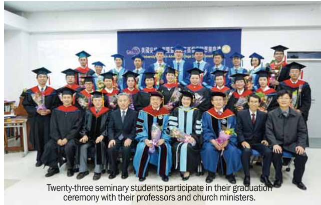
Twenty-three seminary students participate in their graduation ceremony with their professors and church ministers.

After the graduation, the graduates immediately started the training offered by NSD Leadership Training