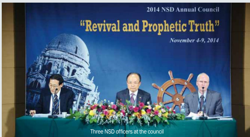
Three NSD officers at the council