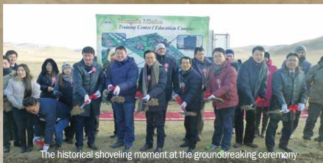
The historical shoveling moment at the groundbreaking ceremony