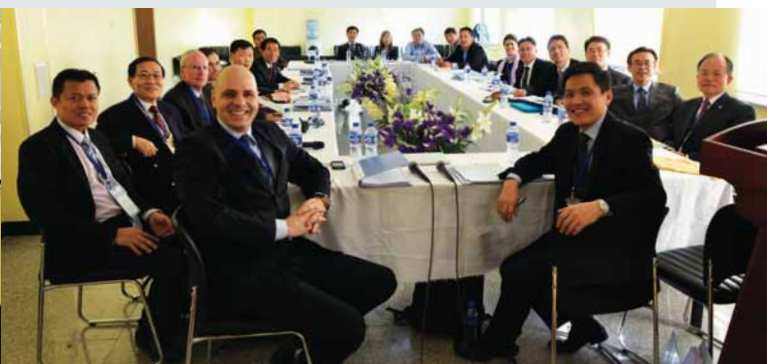
Delegates of the 2014 Mongolia Mission Annual Council