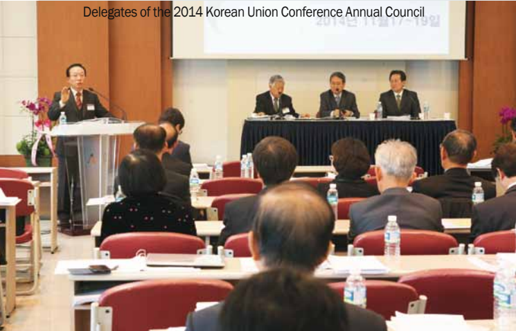
Delegates of the 2014 Korean Union Conference Annual Council