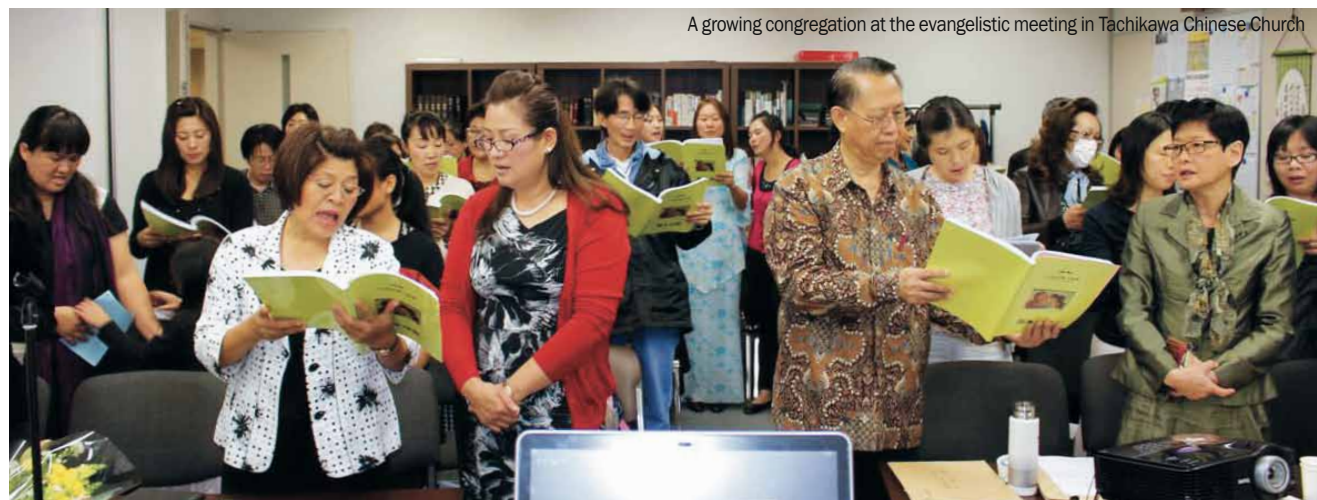
A growing congregation at the evangelistic meeting in Tachikawa Chinese Church

NSD Women's Ministries Director, CLAP Coordinator