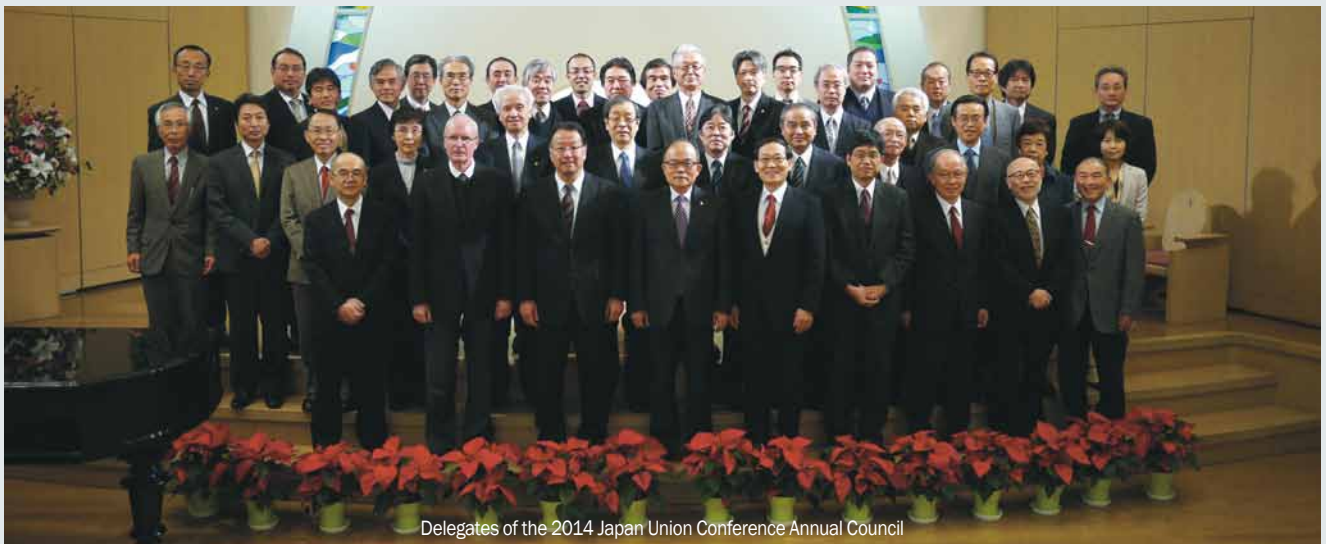
Delegates of the 2014 Japan Union Conference Annual Council

On the other hand, there are still many challenges for the Lord’s cause in this country. Attendees openly discussed these matters, and all delegates were involved in the decision making. They believe they can overcome all difficult things by God’s grace and providential guidance. JUC decided to move ahead with “All Japan15” and all churches in JUC are expected to join the city evangelism effort in their respective areas. JUC’s baptism goal for 2015 is 500, an unprecedented number for JUC.