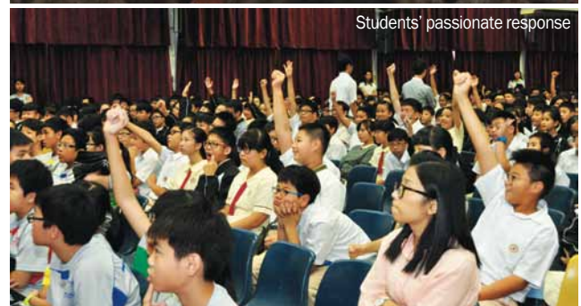
Students' passionate response