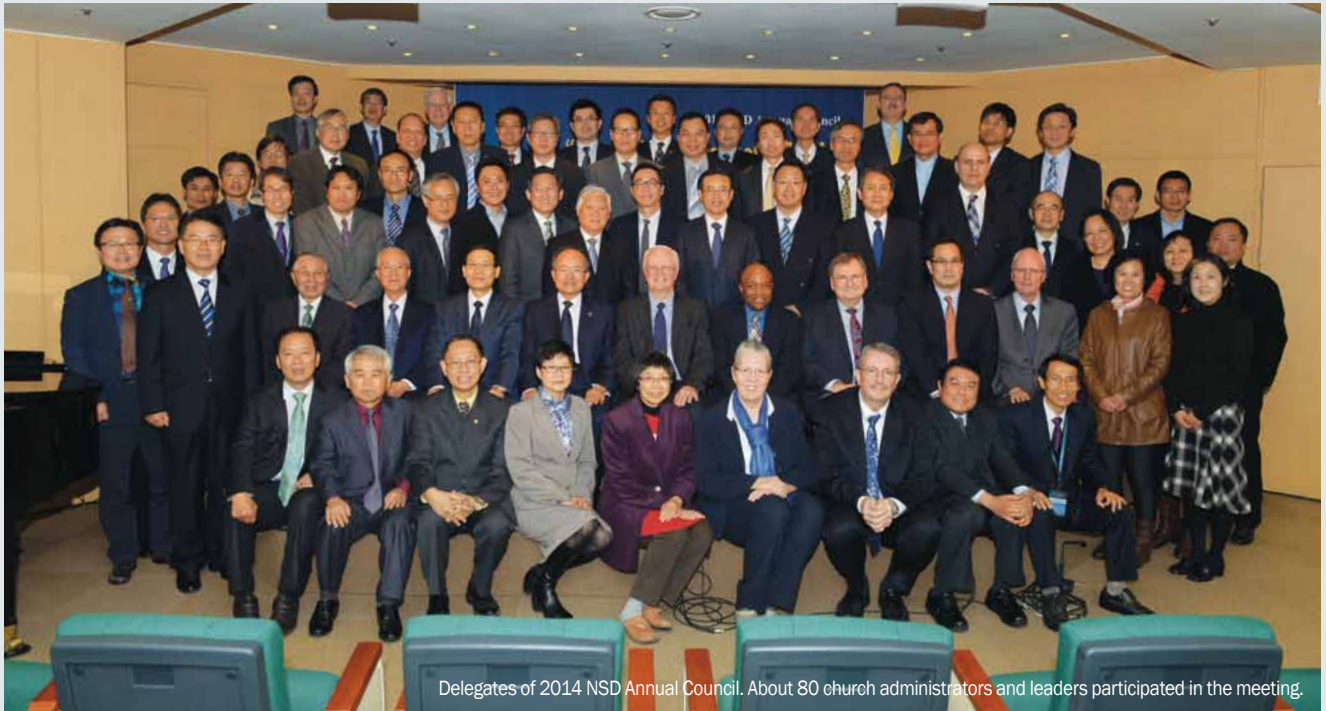
Delegates of 2014 NSD Annual Council. About 80 church administrators and leaders participated in the meeting.