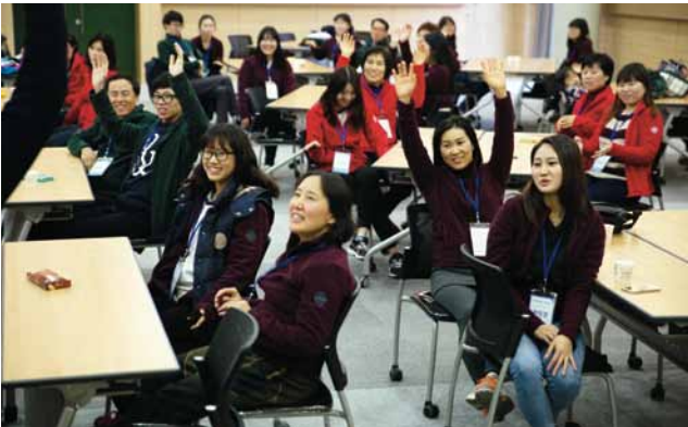
Families enthusiastically participated in a camp program.

Sahmyook Health University College (SHUC) held “Sahmyook Happy Family Camp” from November 15 to 16, 2014, at Gapyeong Good Morning HRD Center in Gyeonggi Province. A total of 24 families made up of SHUC students and faculty members participated in the camp.