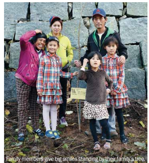
Family members give big smiles standing by their family's tree.

Fringe trees will begin to blossom in April or May next year. Attendees prayed for happy families like a blooming fringe tree.