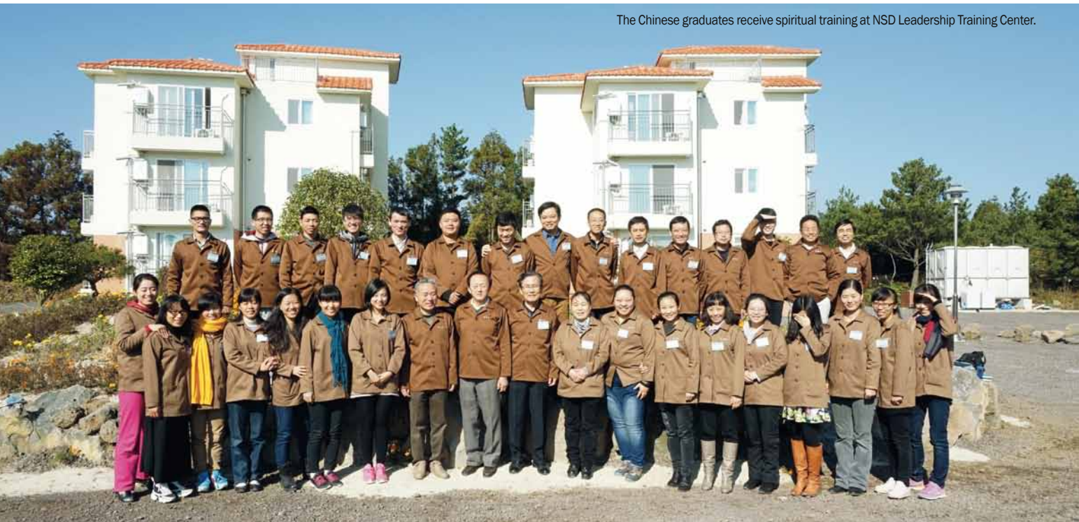
The Chinese graduates receive spiritual training at NSD Leadership Training Center.

The students departed from the center full of the Holy Spirit. When they feel exhausted from their work, they can bring to mind the earnest prayer they prayed at the Jeju Center. Their eyes will be directed toward Him again, and they will recall that they received the promise of the Spirit.