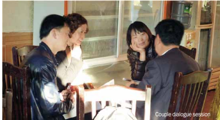
Couple dialogue session

The participants from nine different churches were encouraged to attend as couples, but due to various reasons, a few had to come without their spouses. They had been administered the Prepare/Enrich questionnaire prior to the first