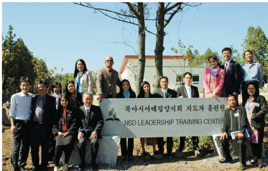
Staff members from 1000MM headquarters visit NSD Leadership Training Center in Jeju, Korea.