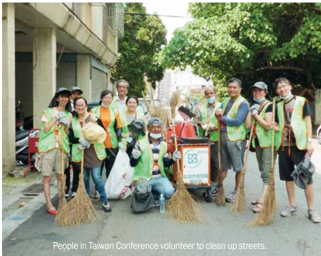
People in Taiwan Conference volunteer to clean up streets.

It was a blessing from God that a total of twenty-five souls were together on Mission Day. Moreover, Taiwan Conference was able to build a bridge between the conference and the local community through this event. Taiwan Conference plans to invite them to other events as follow-up. Two days later, as an extension of Mission Day, the staff of Taiwan Conference went out onto the streets in groups to clean the neighborhood. When they shared their love with the local people, they could also reveal the love of Jesus.