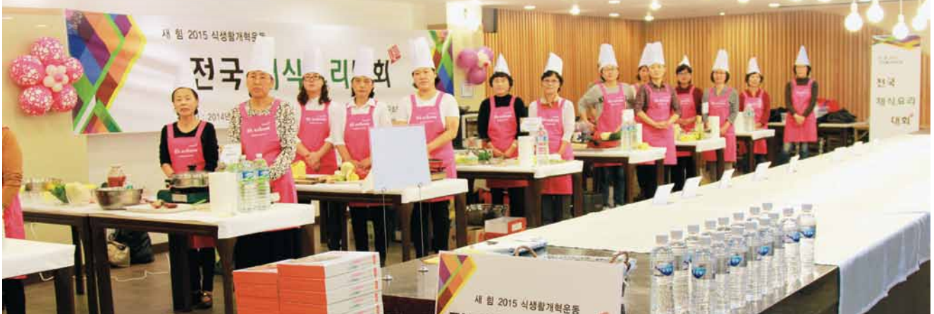
Participants are ready to compete in the first nationwide vegetarian cooking contest held by KUC.

The first nationwide vegetarian cooking contest was held at Bonbu Church under the auspices of Korean Union Conference (KUC) health ministries department on October 26, 2014. The purpose of this contest was to choose the best vegetarian foods that reflect the health message of the Adventist Church. Eight teams from each conference competed in the contest.