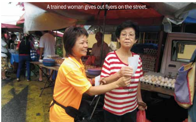
A trained woman gives out flyers on the street.

During the tour, every member felt the presence of God in a very real way. This first-time experience for most of them helped to draw them closer as friends. The positive outcomes served as encouragement for them to continue their service to God using the skills they have acquired.