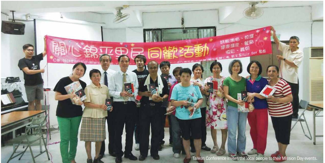
Taiwan Conference invites the local people to their Mission Day events.