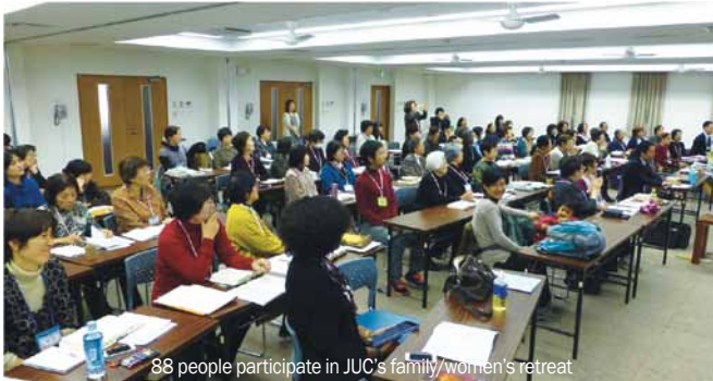
88 people participate in JUC's family/women's retreat