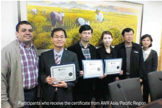
Participants who receive the certificate from AWR Asia/Pacific Region