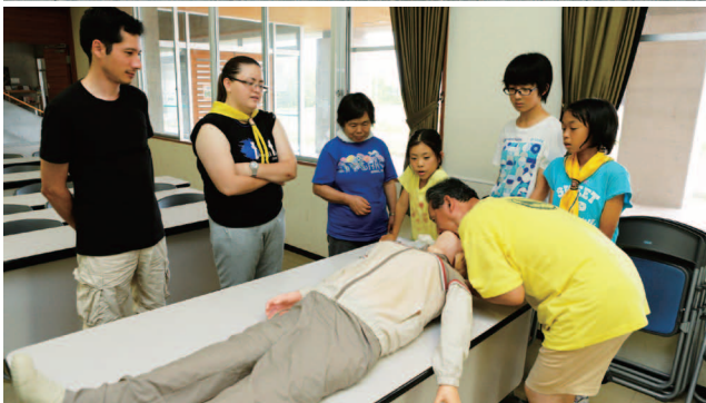
Above: Bird watching by the Japan Pathfinder campers Below: Japanese Pathfinder members learn CPR