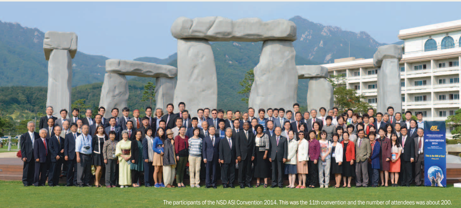
The participants of the NSD ASI Convention 2014. This was the 11th convention and the number of attendees was about 200.