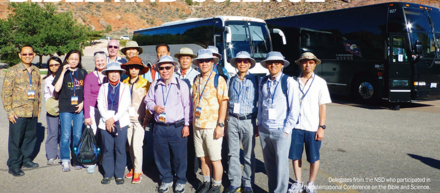
Delegates from the NSD who participated in the International Conference on the Bible and Science.

August 15, 2014, saw the beginning of a momentous 10-day event of the Seventh-day Adventist Church affirming “Creationism” with the attendance of more than 450 church administrators, academic deans, Bible chairs or deans of schools of theology and science, General Conference (GC) and division education directors, chaplains, pastors, and many others at the Renaissance Las Vegas conference hall in Las Vegas, Nevada. Nineteen science and Bible professors and instructors from universities and colleges and some K-12 schools in the Northern Asia Pacific Division (NSD), with some of their spouses, plus the NSD treasurer and education director were also present at the conference.