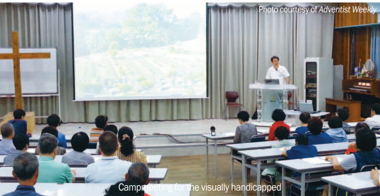
Campmeeting for the visually handicapped