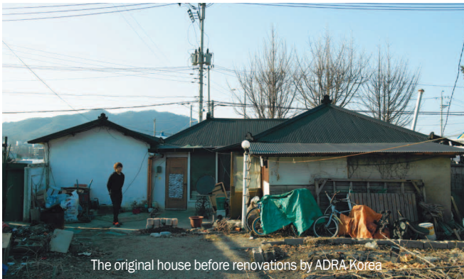
The original house before renovations by ADRA Korea