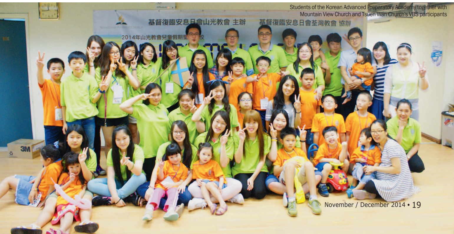
Students of the Korean Advanced Preparatory Academy together with Mountain View Church and Tsuen Wan Church’s VBS participants

Adventists living in Hong Kong-Macao Conference territories care for the spiritual wellness of their young people. This year’s VBS programs were as successful as ever in bringing little ones to Christ.