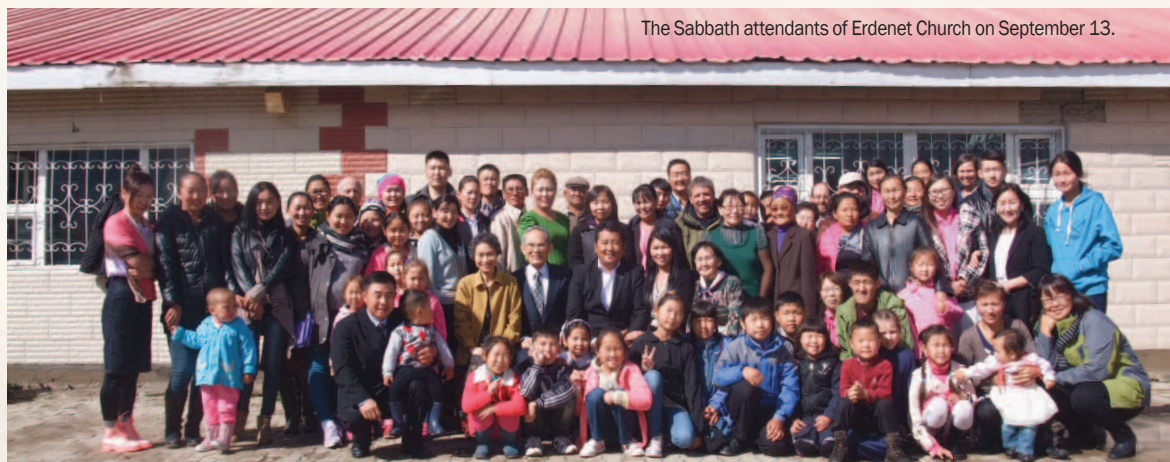
The Sabbath attendants of Erdenet Church on September 13.

The merciful Lord was so good to make children's hands effective even though I, like stones, had no words.