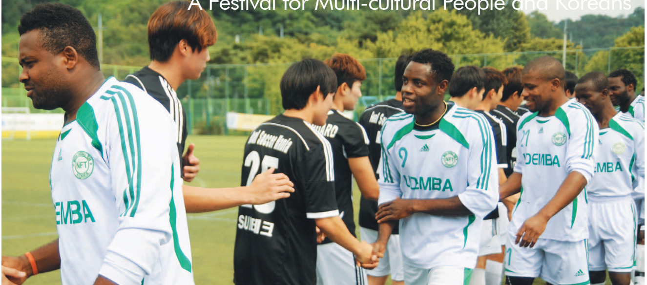
Players of the 1st Damunwha World Cup shake hands before they begin the soccer game. The players from 40 teams plus 1,000 supporters participated in the game.

On August 24, 2014, the opening ceremony for the “2014 1st Damunwha World Cup” was held in Ansan Wa Stadium. This festival was an opportunity for multi-cultural people and Koreans to mingle and better understand each other. The starting games began with a kick-off on three different football grounds. The games were held from August 24 through October 5.