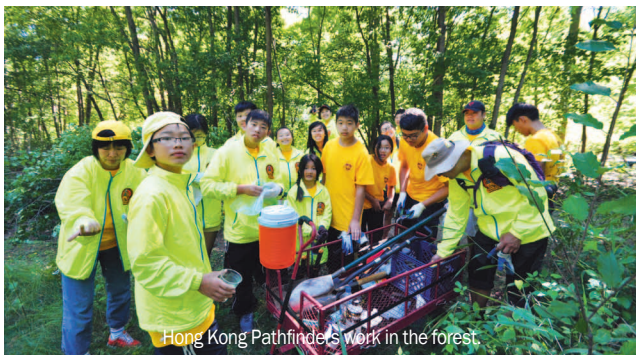
Hong Kong Pathfinders work in the forest.