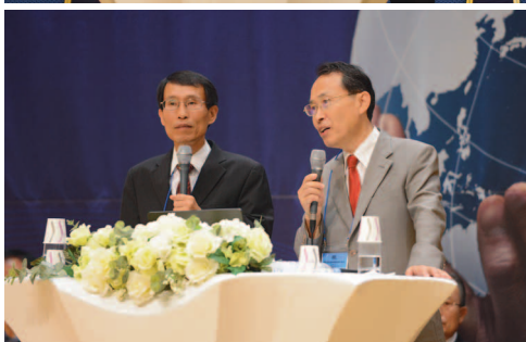
Above: The AHCA business session Below: Kobe Adventist Hospital