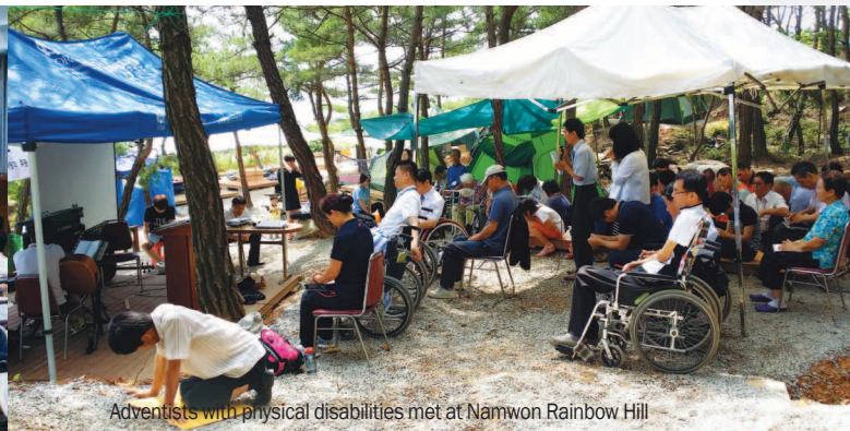
Adventists with physical disabilities met at Namwon Rainbow Hill