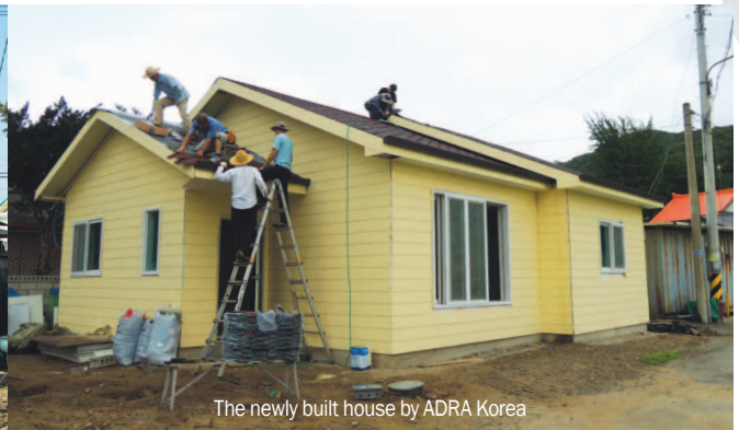
The newly built house by ADRA Korea