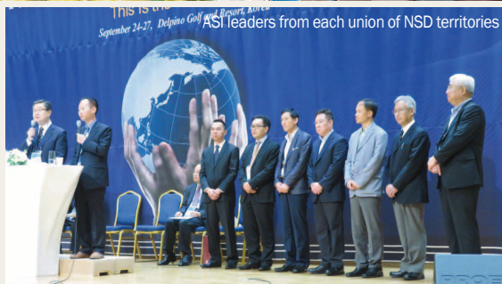
ASI leaders from each union of NSD territories