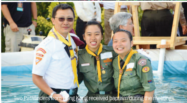
Two Pathfinders from Hong Kong received baptism during the meetings.

Twenty-eight Pathfinders led by Youth Ministry of Hong Kong-Macao Conference attended the International Camporee 2014 from August 11 to 16 in Oshkosh, Wisconsin, USA. Some of the delegates had attended the last camporee five years ago and were excited to see old friends from different parts of the globe.