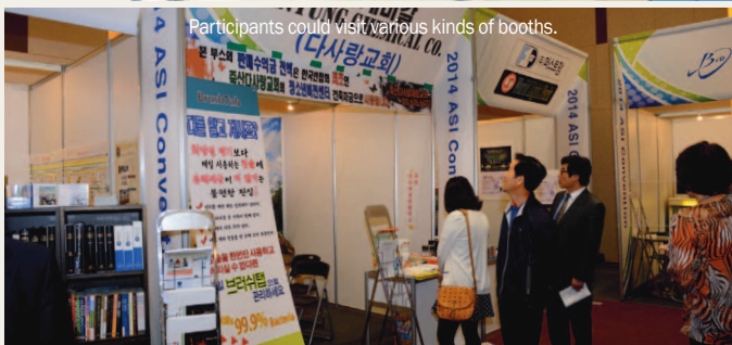
Participants could visit various kinds of booths.