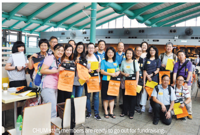
CHUM staff members are ready to go out for fundraising.

Hong Kong citizens responded to the Adventists' efforts with enthusiasm as they put pocket change into the collection bags. Although there were about 100 fewer bags this year, the total amount of donations collected exceeded HKD250,000 (USD 32,000), which beat the 2013 record by a wide margin.