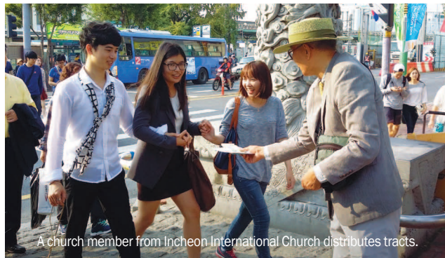
A church member from Incheon International Church distributes tracts.

The church distributed 20,000 evangelistic tracts and packs of wet tissues to Korean and foreign visitors during the Asian Games. The Northern Asia-Pacific Division (NSD) HisHands provided financial support for some of the production cost and free booklets. The Korean Publishing House donated 12,000 copies of a health magazine. Other churches in Incheon also gave financial support. In addition, some individual Adventist members supported the project through donations and participation, experiencing the promise that “those who go out weeping, carrying seed to sow, will return with songs of joy, carrying sheaves with them.”