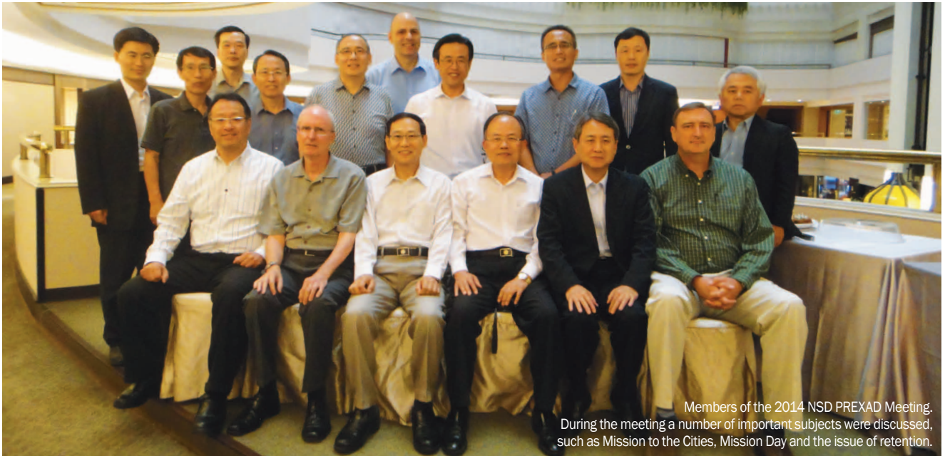
Members of the 2014 NSD PREXAD Meeting. During the meeting a number of important subjects were discussed, such as Mission to the Cities, Mission Day and the issue of retention.