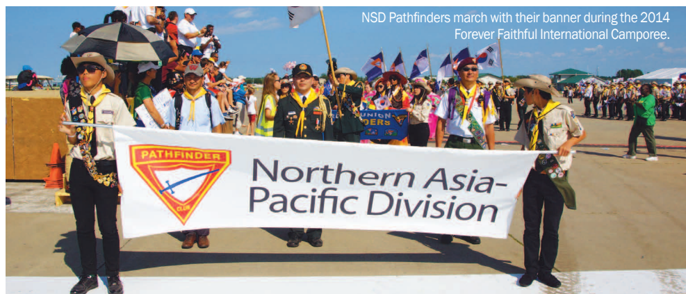
NSD Pathfinders march with their banner during the 2014 Forever Faithful International Camporee.

2014 Forever Faithful International Camporee ran 31 activity booths, 66 honor booths, and 11 special interest-area booths. Through booth activities, world Adventist youth were able to establish their faith and strong connectedness as an Adventist member.