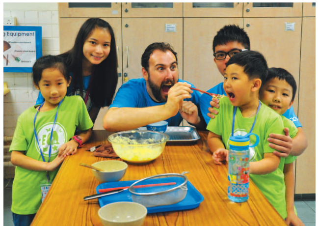
Above: Children eagerly participate in the VBS program. Below: Teachers and children enjoy English class during VBS.

how to put on the armor of God in order to become strong spiritual warriors.