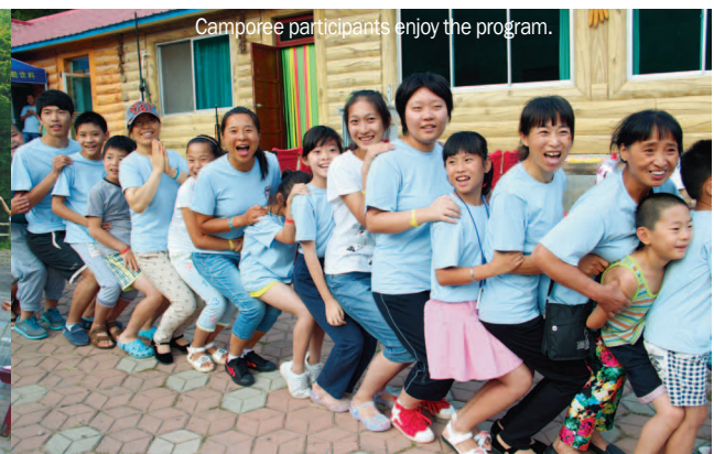
Camporee participants enjoy the program.