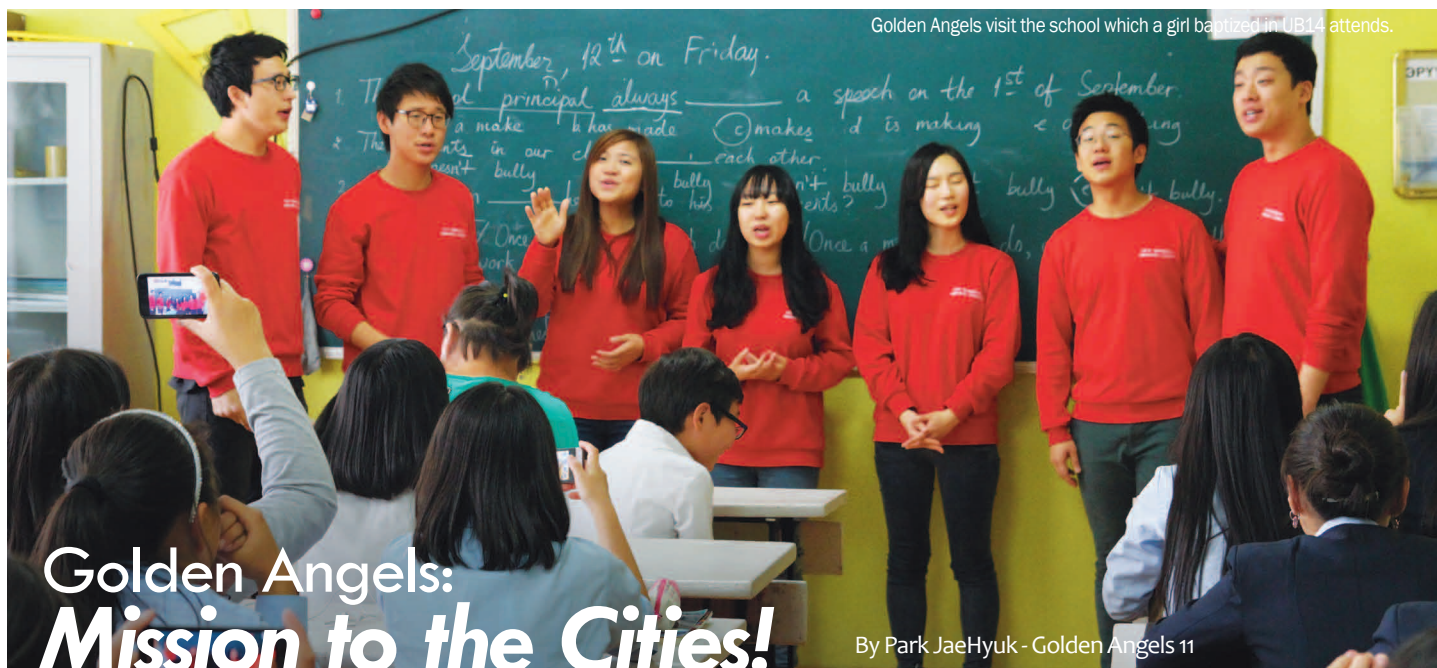
Golden Angels visit the school which a girl baptized in UB14 attends.