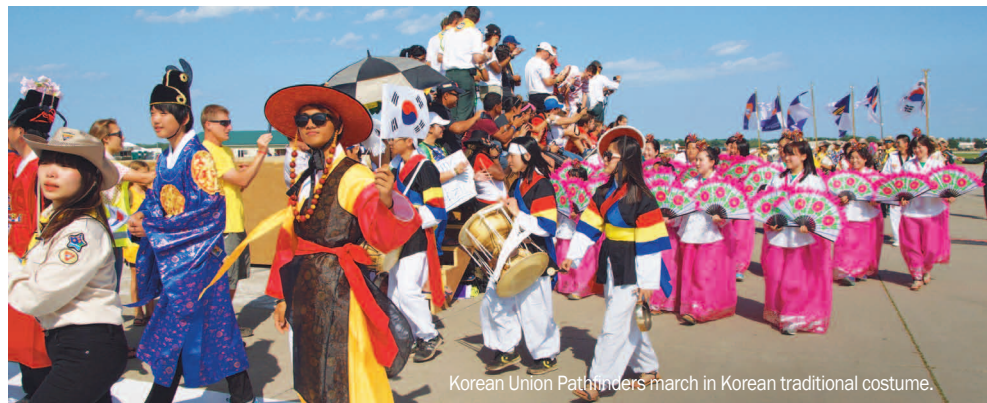
Korean Union Pathfinders march in Korean traditional costume.

Second, the well-organized and well-ordered programs were impressive. It was a very well-prepared event and in perfect order.