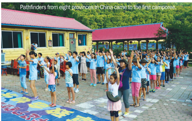
Pathfinders from eight provinces in China came to the first camporee.

The spirit of the first camporee in China will have a long-lasting impact upon the future work in the country.