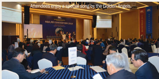
Attendees enjoy a special song by the Golden Angels.