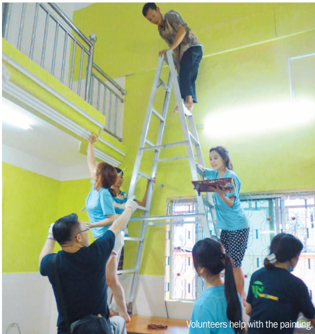
Volunteers help with the painting.