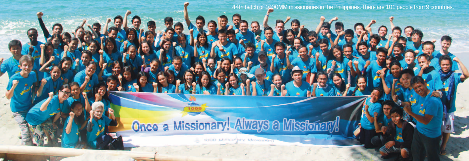
44th batch of 1000MM missionaries in the Philippines. There are 101 people from 9 countries.

couple was sent to Nepal, and another Korean missionary and one Filipino missionary were sent to Cambodia. The missionaries are being sent to the world to hasten Jesus' coming. Let us pray for them.