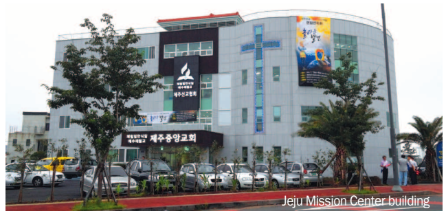
Jeju Mission Center building

The participants said, "We received rich blessings throughout the week. It was also very meaningful to have an evangelistic event together with all the other Adventists on Jeju Island." One of the newly baptized members said, "I had no idea about Christian religion. However, I was so impressed by the lives of the Adventists around me. That's what made me an Adventist and led me here. I thank God for His grace."