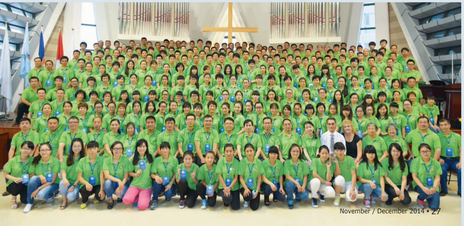
About 300 devoted ministers and youth leaders attend the 3rd CHUM Youth Leadership Conference

The "Building Houses for Neighbors" program aims to improve living conditions for people who are in poverty and are neglected. The program has been executed in various parts of the country. Also, since 2008, it has been sponsored by Adventist K-pop singer Kim JunSu.