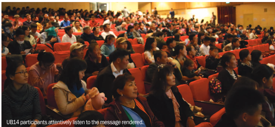
UB14 participants attentively listen to the message rendered.