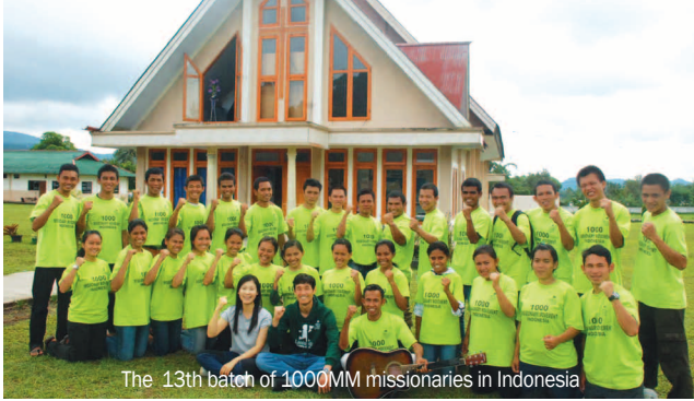
The 13th batch of 1000MM missionaries in Indonesia