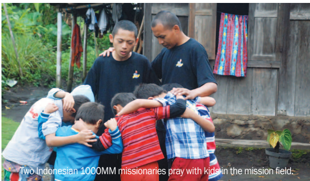
Two Indonesian 1000MM missionaries pray with kids in the mission field.