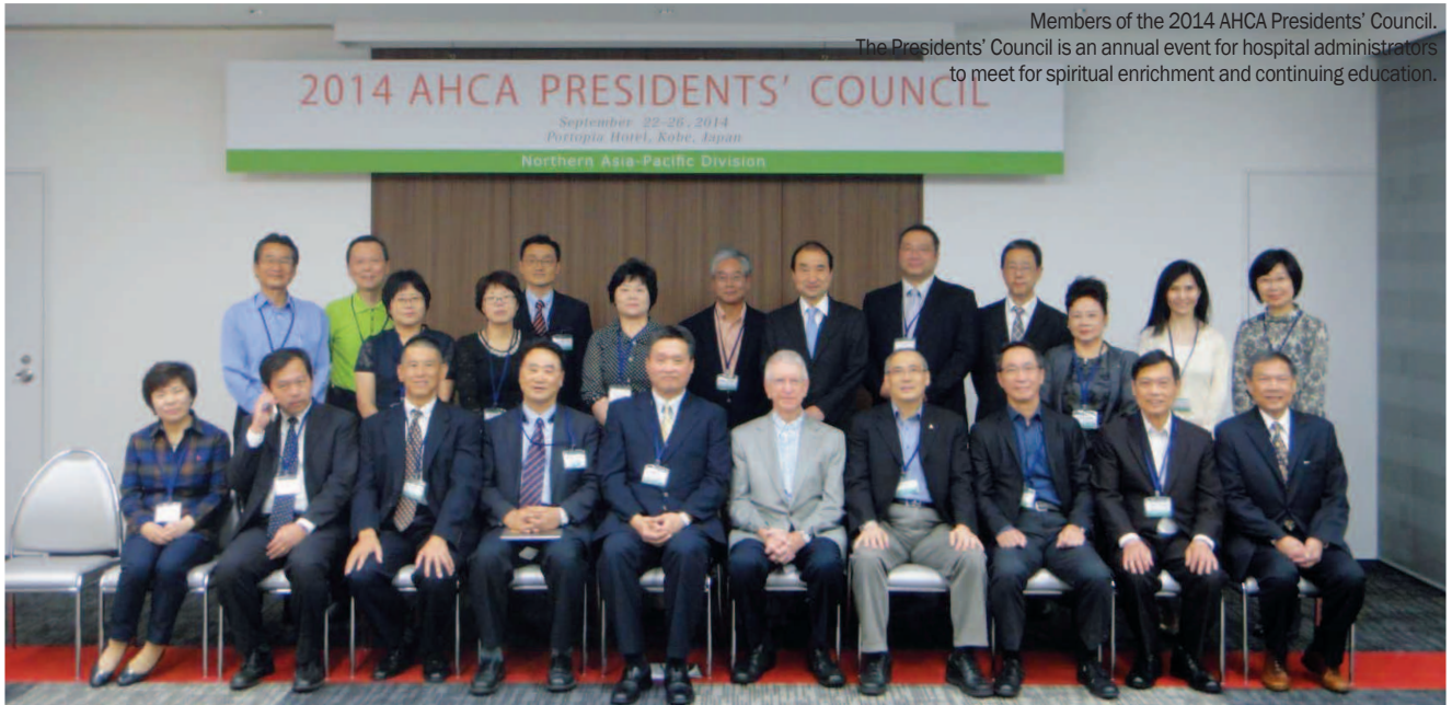
Members of the 2014 AHCA Presidents' Council. The Presidents' Council is an annual event for hospital administrators to meet for spiritual enrichment and continuing education.