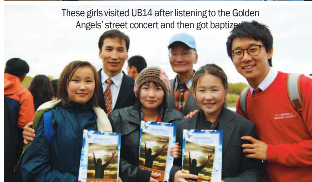
These girls visited UB14 after listening to the Golden Angels' street concert and then got baptized.