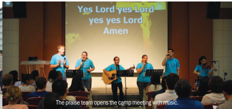
The praise team opens the camp meeting with music.