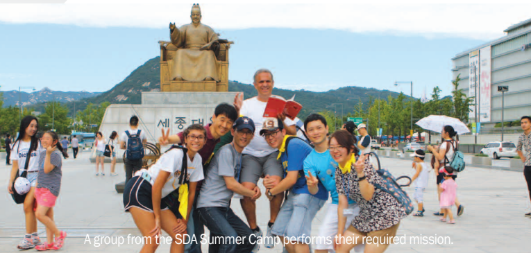
A group from the SDA Summer Camp performs their required mission.