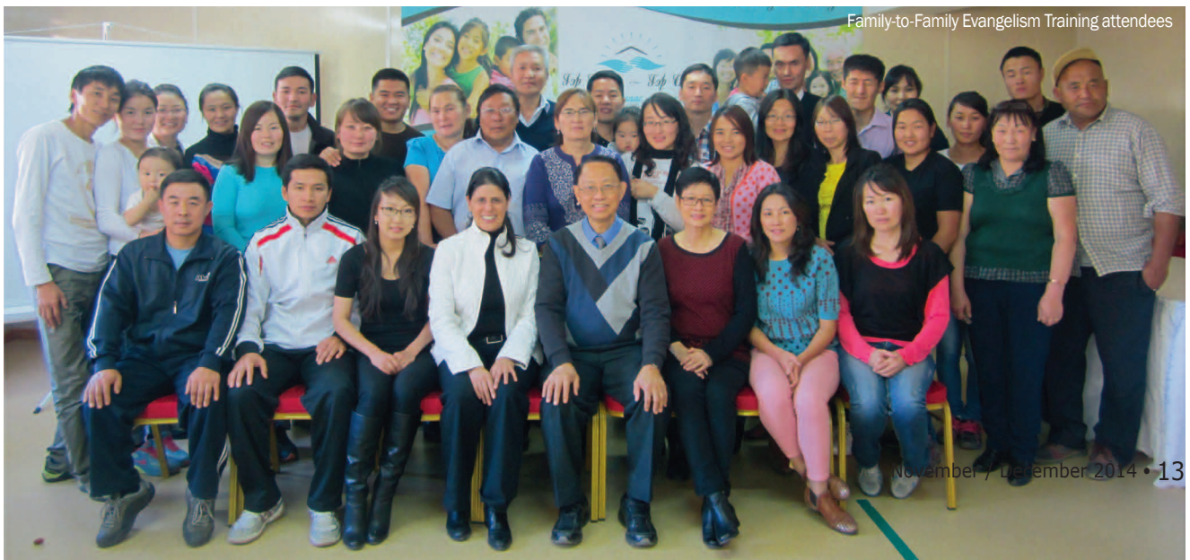
Family-to-Family Evangelism Training attendees

The group has laid plans to begin work as soon as they arrive home. The rest of the materials will be translated by the end of October and mailed to all attendees, and they have promised to meet for an update in December. A target has been set to have a reaping campaign in June 2015 by God's grace.