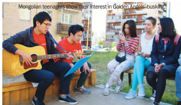
Mongolian teenagers show their interest in Golden Angels' busking.

In Korea we went to Sahmyook Middle and High School in KwangJu City. We also visited Sahmyook Health University College. Even though we had just arrived from Mongolia, we went directly to the college, not because this is our work. It is a mission for the Lord our God and to glorify His name only, not so that we can boast, but praising Jesus Christ.