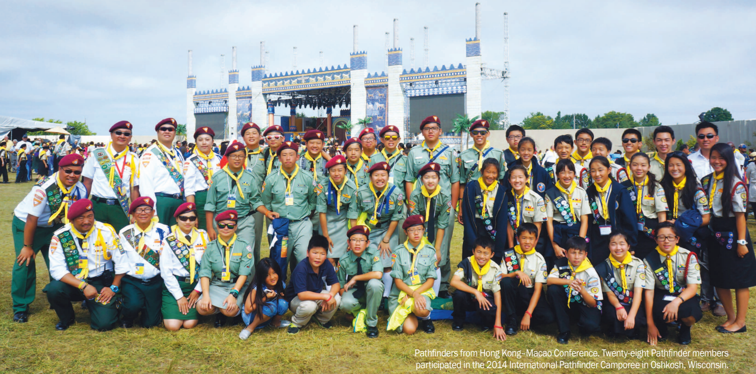
Pathfinders from Hong Kong-Macao Conference. Twenty-eight Pathfinder members participated in the 2014 International Pathfinder Camporee in Oshkosh, Wisconsin.