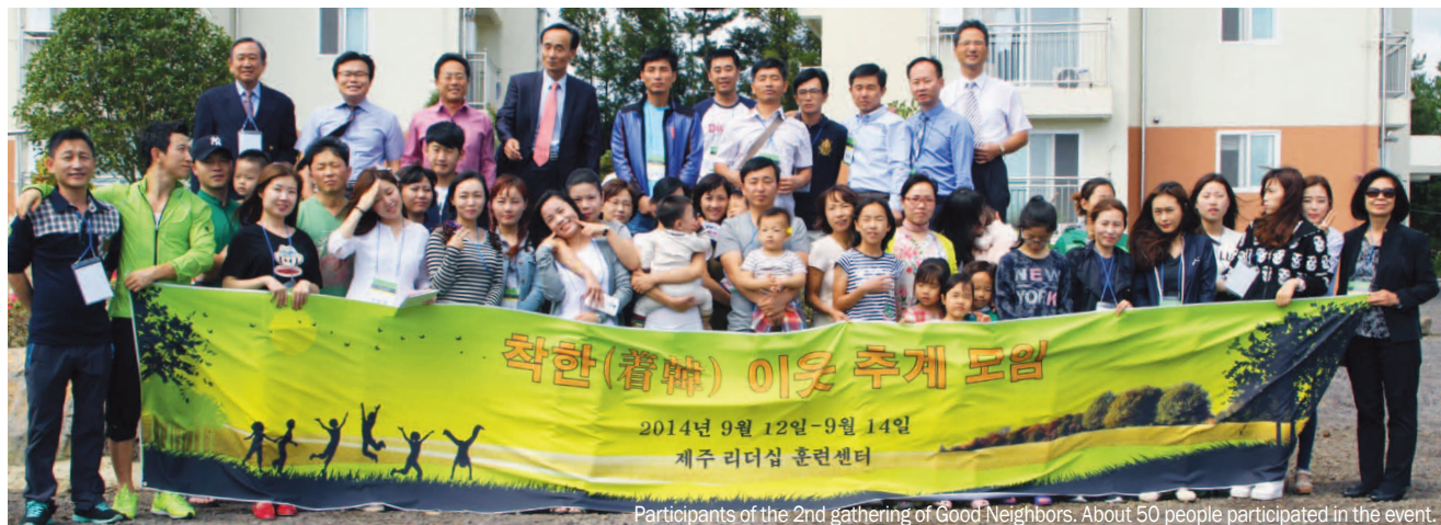
Participants of the 2nd gathering of Good Neighbors. About 50 people participated in the event.

“Through this gathering, I got to know that the Seventh-day Adventist Church is a Christ-centered, Bible-based, mission-focused church,” said one of the participants. “We can move away from the bias implanted by other Christian denominations.” It is believed that the faith of our “good neighbors” will grow and that they will work for North Korea mission as servants of God.