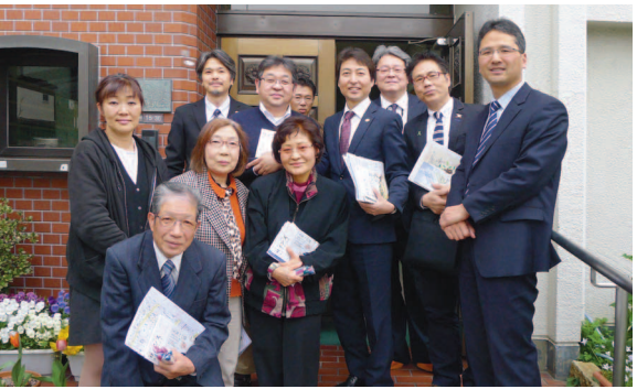
Above: The Osaka East Church's HisHands missionaries Below: Ready to go out for door-to-door visitation