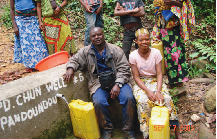
Above: Global Welfare Supporters perform medical service. Below: Local people enjoy getting clean water from the P. D. Chun well.

Usually, people prefer receiving to giving. However, there are some people who find greater joy in giving as Jesus said. They feel fulfilled when they take care of neighbors in need. Among them are the Global Welfare Supporters, who give help especially to people living in poor countries.