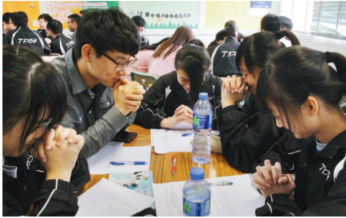
Above: Taipo Samyuk Middle School students have gospel week with the Golden Angels Below: Golden Angels are divided into small groups to pray for students.