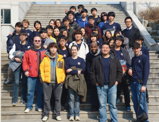
KAPA (Korean Advanced Preparatory Academy) students came to Seoul all the way from YangPyeong to participate in Global Youth Day