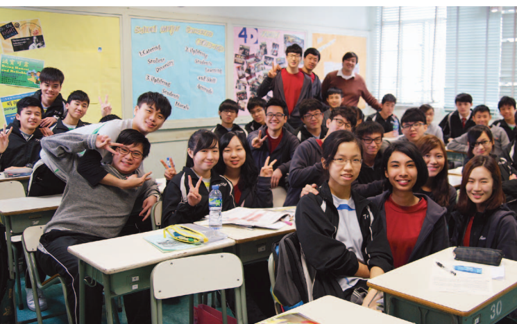
11th Golden Angels visit a class at TaiPo Sam Yuk Secondary School