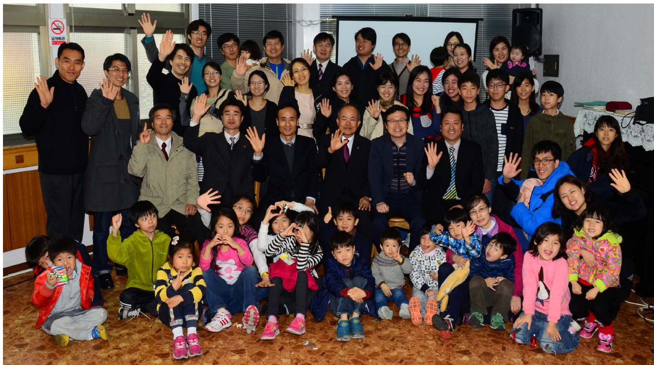
PMM families attend Family Revival Meeting in Taiwan