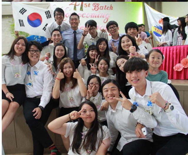
Above: Missionaries enjoy the mission activities at the mission fields Below: 1000 MM missionaries who finished their one year service

guidance, the financial capacity of the 1000MM will be bigger and deeper by repeated emptying and filling. To make such a miracle possible, the unconditional faith of leaders should grow, and focus on financial affairs should increase. I am sure that God will help us.