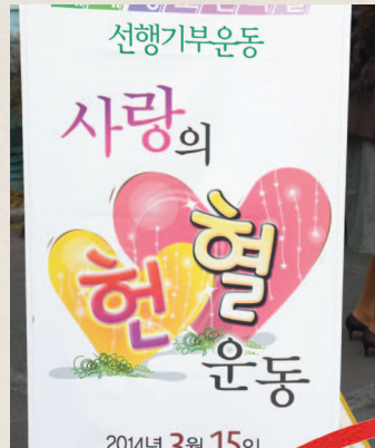
Banner for Blood Donation