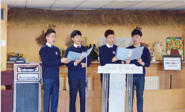
A men's quartet sings a beautiful melody for the elderly at a nursing home