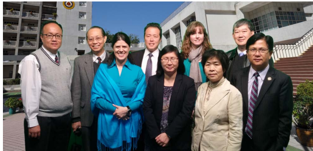
Evaluators with TPSY Administration