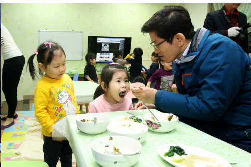
Governor Kim MoonSoo feeding a child at the kindergarten inside the MFSC