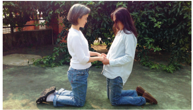
"Women Can Do" seminar participants hold hands together to pray for Women's Ministry in Taiwan

Seventy percent of Taiwan Adventists are women; the ratio of women to men is quite high. Many more women seem to be enthusiastic and proactive in the church. If these women are led and utilized, their influence would be tremendous. Participants encouraged each other through activities, and all of them were willing to serve and offer financial assistance for the ministry. Although there were only 15 women who