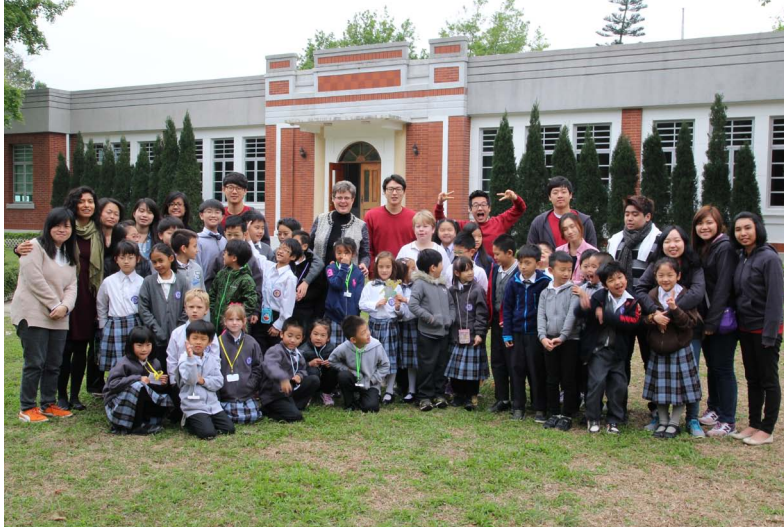
HKAC and HK Adventist Primary School hold a gospel week

Hong Kong Adventist College (HKAC) was our second mission field from March 17 to 22, 2014. There, we also experienced God's grace. God used imperfect human beings, the Golden Angels, to preach His gospel at HKAC. Consequently, many students raised their hands to praise the Lord.