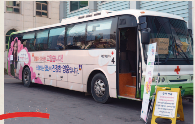
A Blood Drive bus. 52 Adventist youth participated the blood donation