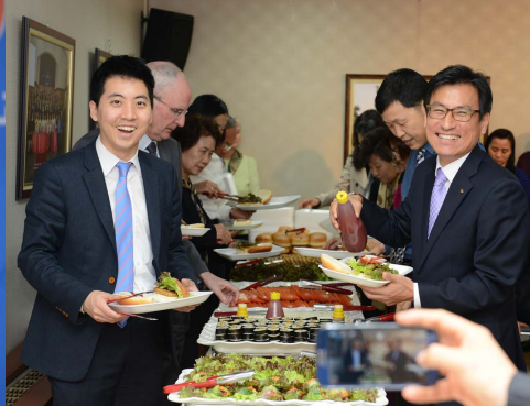
Invited Mission Day visitors enjoy lunch at NSD office