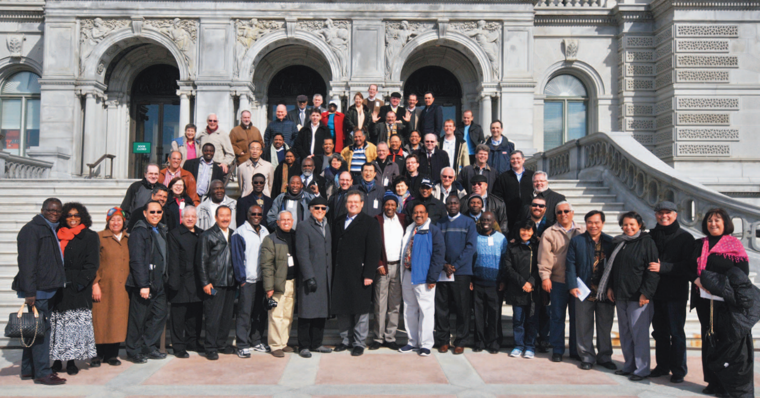
University and college presidents with education directors of the World Field at the Library of Congress, Washington, D.C.