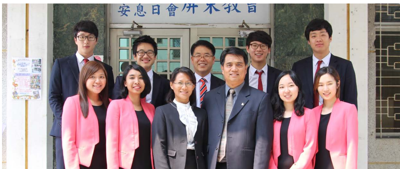
11th batch of Golden Angels worship God with music at Ping Dong Church on Sabbath