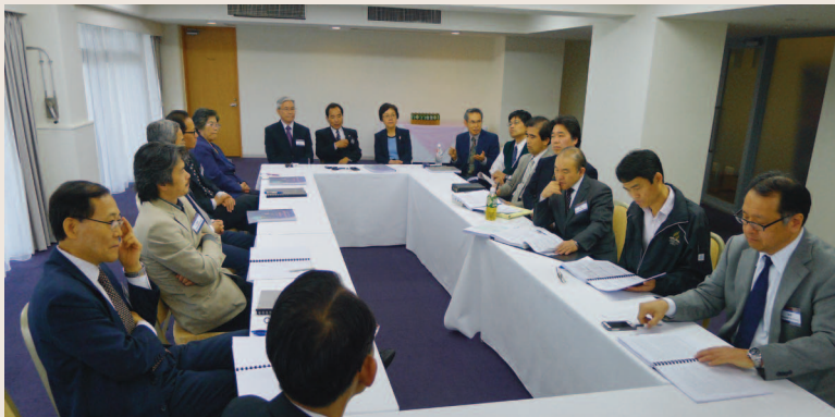
Japan Union Conference brainstorming session