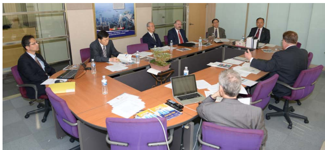
Editors of Adventist World magazine discuss major agenda