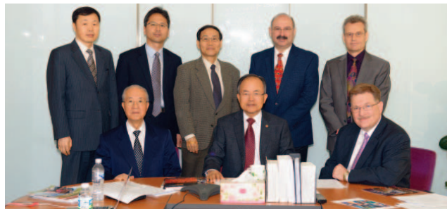
Adventist World Management Committee members