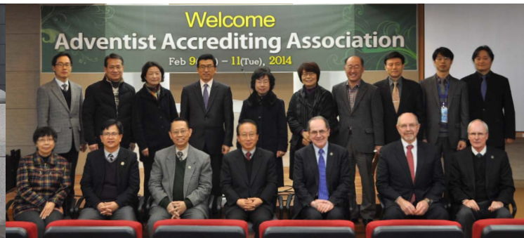
AAA committee members with SHUC leaders and staff

The Accrediting Association of Seventh-day Adventist Schools, Colleges and Universities (AAA) made an interim visit to Sahmyook Health University College (SHUC) from February 9 to 11, 2014. This visit was one of the conditions for accreditation recommended in the regular evaluation visit in 2012. Because there was a change of leadership at SHUC and also because there was a major concern about the physical development of the school, the visiting team felt that it would be appropriate to review SHUC's progress toward fulfilling the recommendations by the last evaluation committee.