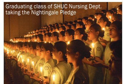
Graduating class of SHUC Nursing Dept. taking the Nightingale Pledge