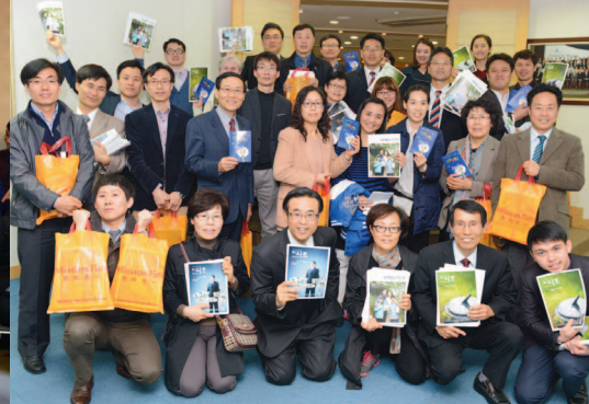
NSD leaders and staff holding tracts and booklets