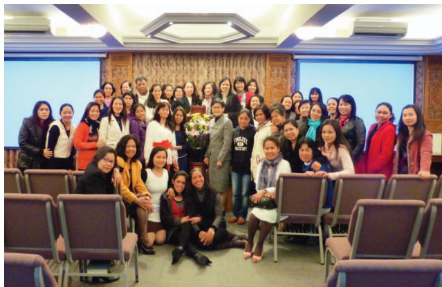
Hong Kong International Church members on International Women's Day of Prayer

The church's women's ministries department is very