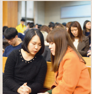
Young Korean Adventists pray together for the mission activities