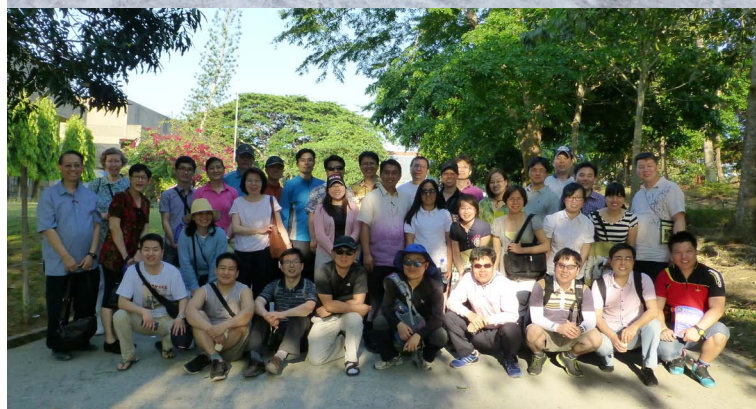
Above: CLAP members participate in a game for team building Below: CLAP3 at the Adventist University of the Philippines (AUP)

Whether they were concentrating in their classes or engaged in avid discussion with their classmates or visiting the churches in the mission fields or even riding the jeepney on a field trip, the participants were encouraged to maximize their time by speaking English and connecting with their fellow leaders. We are confident that CLAP will help lay the foundation for our future leaders in sharpening their communication abilities in English, honing their skills in leadership, and strengthening their network with other leaders within the NSD territories.