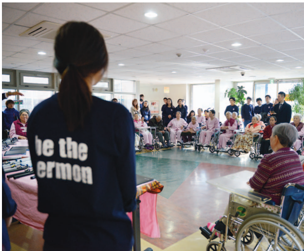
A group of Korean Adventist youth held music concert for the elderly at the YuJaWon Nursing Home