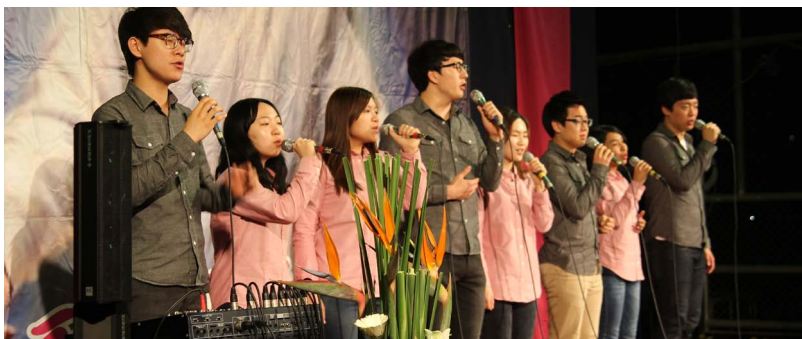
Golden Angels hold a concert for Ching Shan Church members