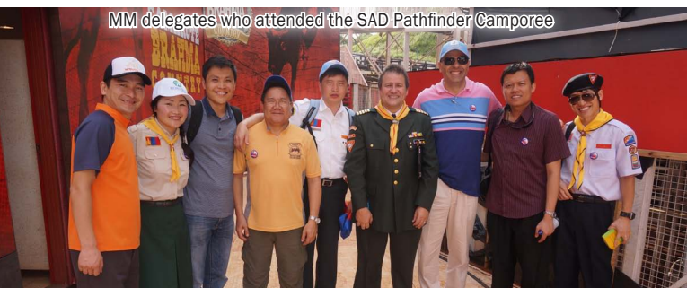
MM delegates who attended the SAD Pathfinder Camporee

True enough, the group experienced a renewed commitment and goal to grow not only in church membership, but also in physical structure by building more institutions. We are inspired to be more proactive with religious programs that will attract new church comers and stabilize current members. By the grace of God, the Seventh-day Adventist Church in Mongolia will soar high!