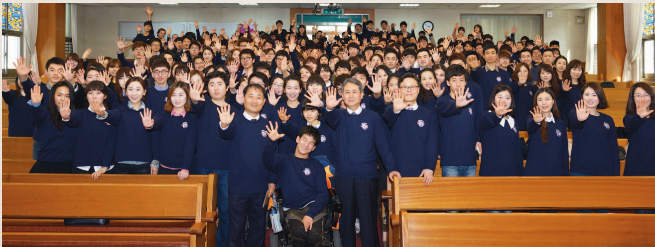
Korean Adventist youth chant for mission activities on Global Youth Day at the Seoul English Institute Church