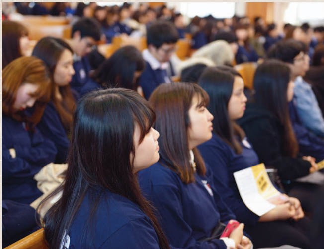
Global Youth Day participants attentively listen to the message during the special worship