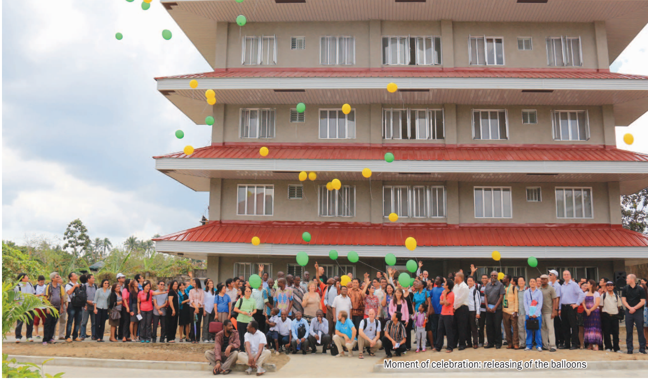
Moment of celebration: releasing of the balloons