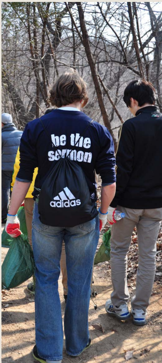
Cleaning Mount BaeBong