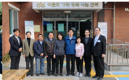
MFSC staff pose for a group picture with the governor