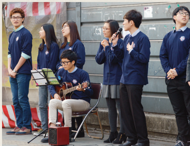
A group of young Adventists doing street evangelism