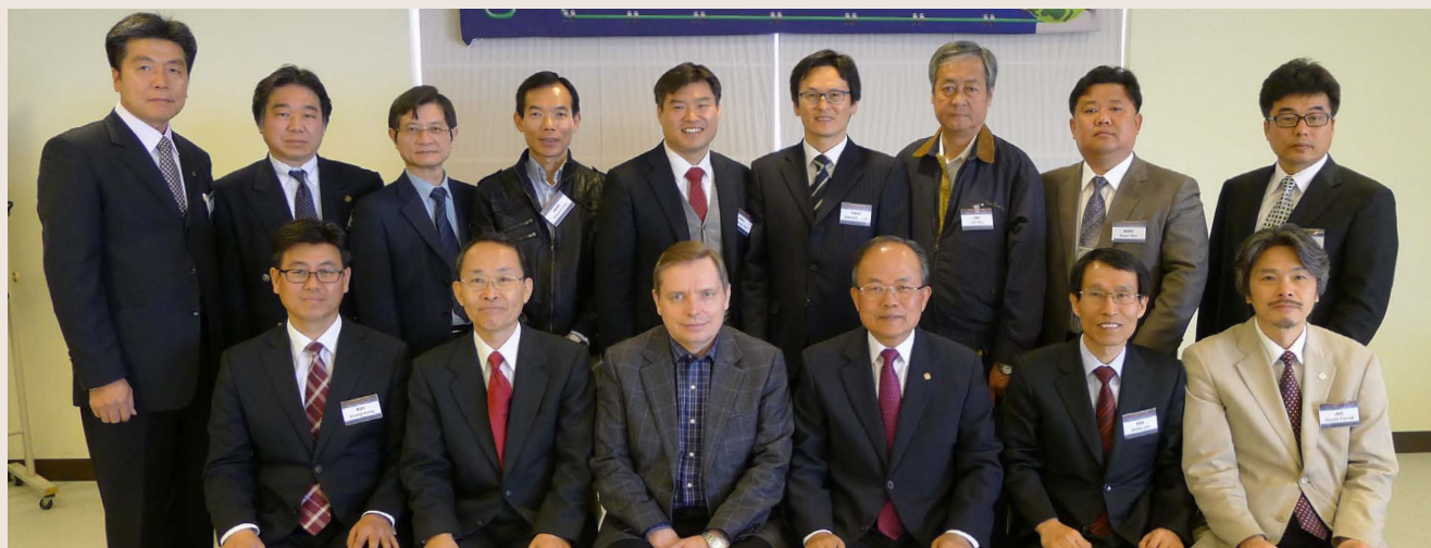
Retention and Reclamation coordinators of each union and conference