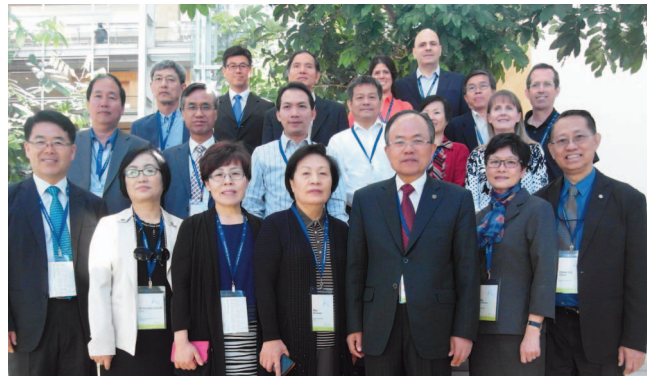
Group photo of NSD delegates at the Convention Center

The program was power-packed with devotionals. Panels addressing the main issues behind alternative sexualities, studies into hermeneutics of texts often used to condone homosexuality and presentations covering the social, legal, ethical and medical perspectives rounded out the conference. Breakout sessions were held both at the Pavilion