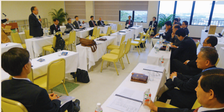
Korean Union Conference brainstorming session