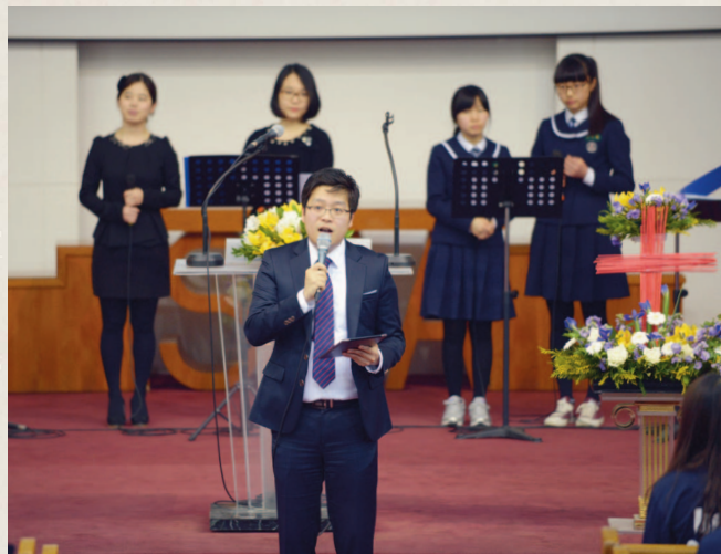
Praise team from the CheongRyang district led the worship and praise