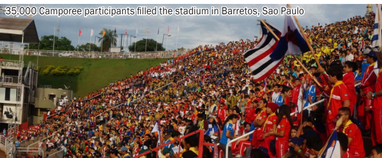
35,000 Camporee participants filled the stadium in Barretos, Sao Paulo