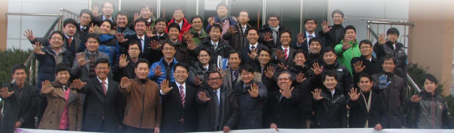
Korean pastors who are in charge of youth ministries in local mission councils. Pastors were able to grasp some new ways of effective youth ministries through this seminar.

In addition, there were also discussions about the Youth Leader Congress and 2014 Korean Adventist Youth Convention, which will be held in Taiwan in February next year and at Sahmyook University this coming June, respectively.