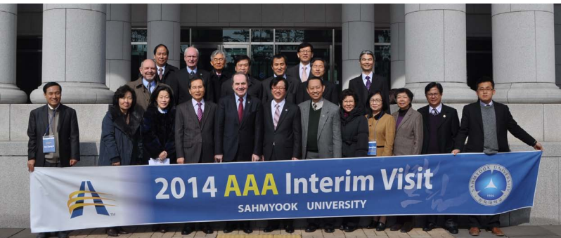
Sahmyook University leaders welcome AAA committee members