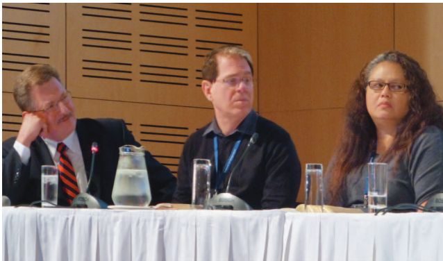
Another panel discussion