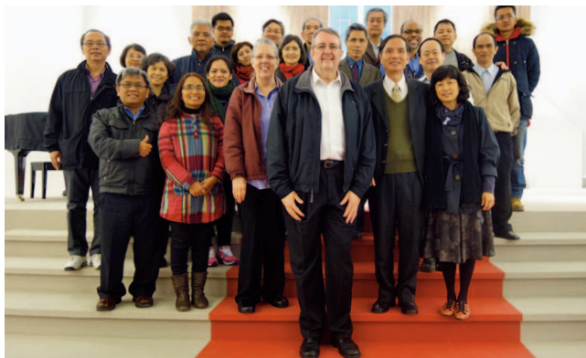
Taipei group of the Taiwan Leading Enthusiastic Active Disciples