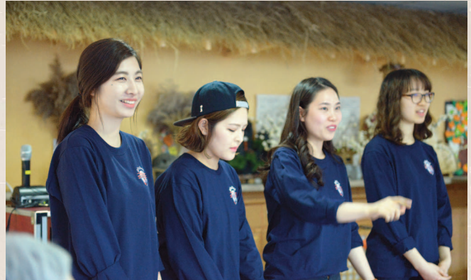
Korean Adventist ladies present a special program for senior citizens