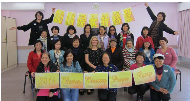
26 Adventist women in Hong Kong joined together to experience the power of prayer during the Prayer Camp