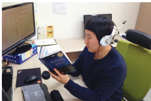
CLAP members can learn English while memorizing Bible verses through Scripture songs