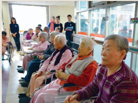
Elderly people at a nursing home enjoy listening to the songs