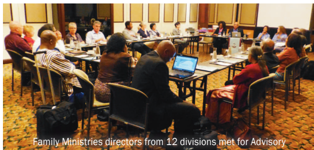
Family Ministries directors from 12 divisions met for Advisory