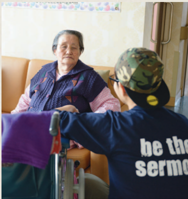
A young man spends time taking care of an old lady