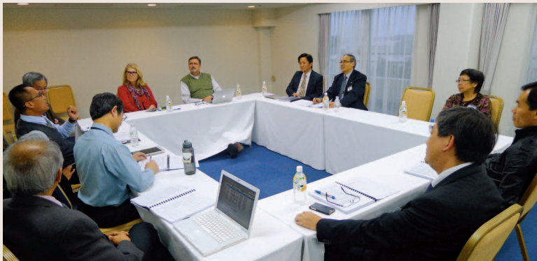
Chinese Union Mission brainstorming session