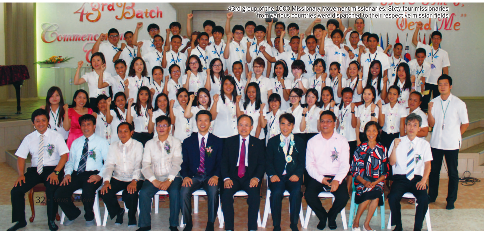
43rd group of the 1000 Missionary Movement missionaries. Sixty-four missionaries from various countries were dispatched to their respective mission fields