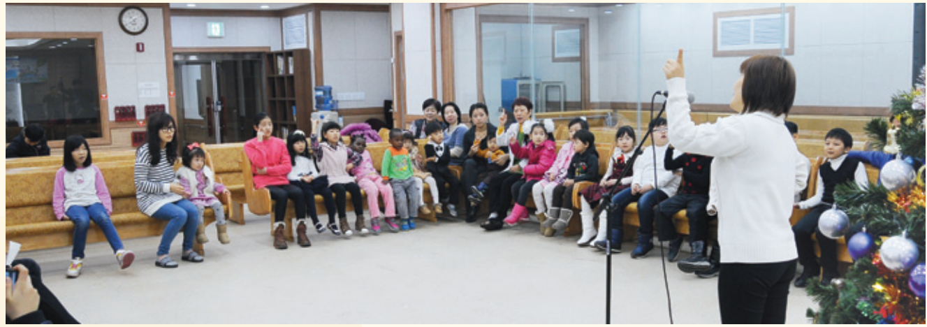
Children learn about Jesus through Winter Vacation Bible School

From January 14 to 23, the children at the center went to the Happiness Etiquette Education Center in Ansan City to learn the Korean traditional New Year's bow and to experience the traditional ways of drinking teas and to play traditional games. They had lots of fun playing the traditional game yut and learned to wear a hanbok as they practiced their New Year's bow. As Korea continues to grow as a multicultural society, the center is taking steps to put more effort into educating the second generation of our international friends.