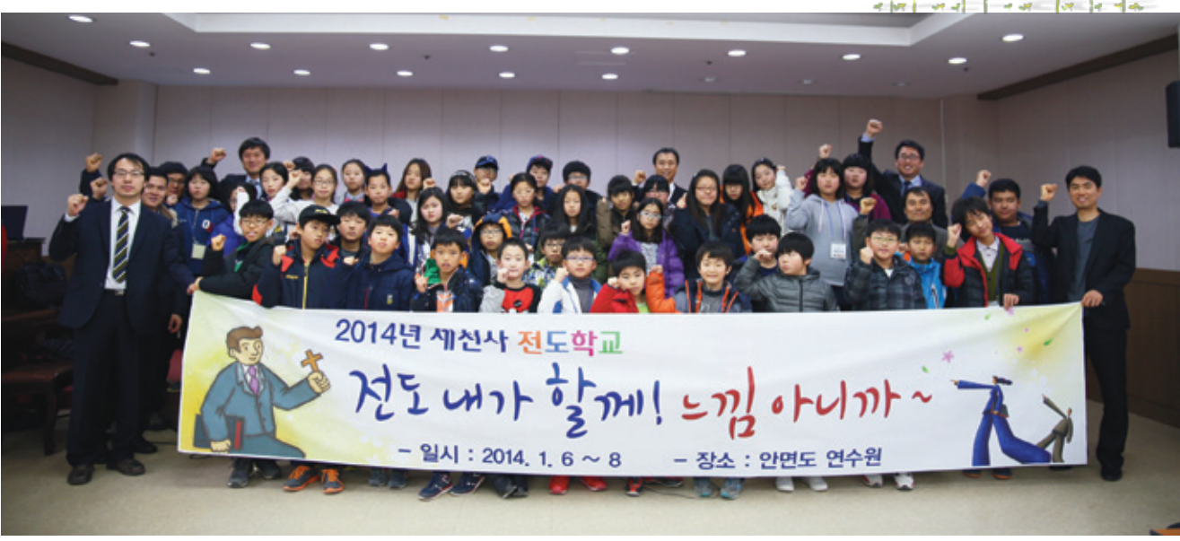
Participants of the Three Angels' Children's Evangelism School. The children who attended this program are now confident in their faith.

C hildren are being trained so that they, too, can be missionaries. From January 6 to 8, 2014 the children's department at Middlewest Korean Conference opened a "Three Angels' Children's Evangelism School." The training program took only three days. However, through topic discussion and practical exercises, the program was truly beneficial to the children. The main activity during this time period was memorizing Bible verses, enabling the children to later remember and explain the verses when necessary. While