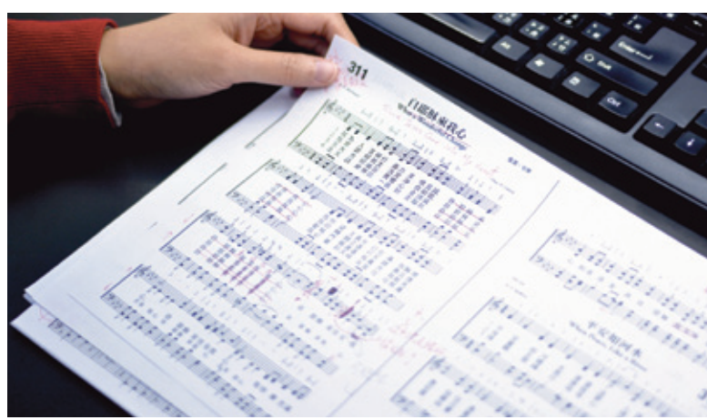
New hymnal of Chinese Union Mission

The translators made sure that the newly translated lyrics rhyme and that they are