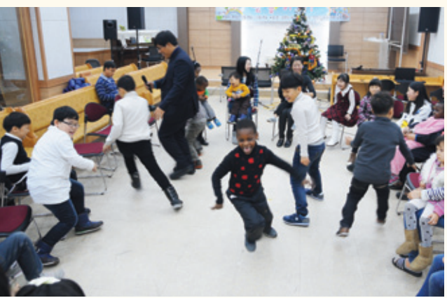
Programs include fun activities for the children