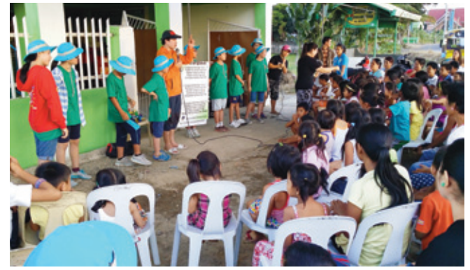
Children Missionary Movement members reach out to the people in the Philippines