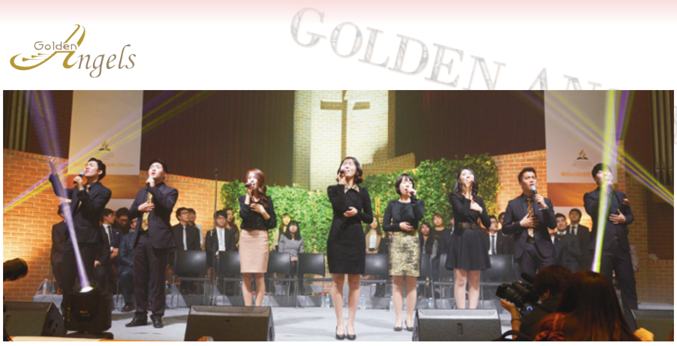
10th batch Golden Angels members praise God during the 10th Anniversary Concert