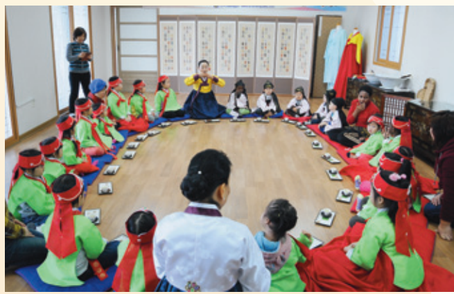
Children wearing hanboks learn the traditional New Year's bow