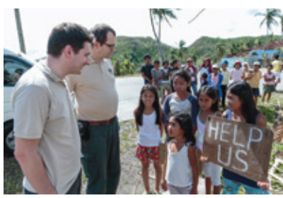
Girls in the Philippines ask for help after the disaster

The Hong Kong government Disaster Relief Fund has given a grant of HK$3 million to the Adventist Development and Relief Agency China (ADRA China) to provide food relief to survivors of Typhoon Haiyan in the Philippines.