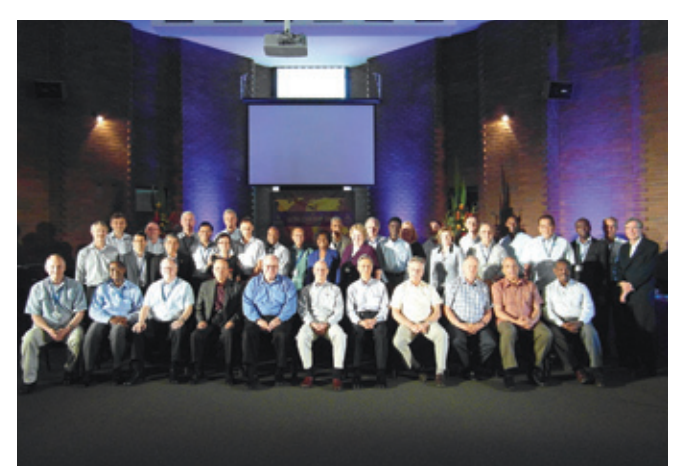
Adventist church leaders from all around the world