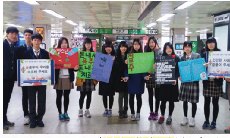
A group of students participating an Anti-Alcohol Campaign

The Korean Institute on Alcohol Problems has plans to create a network with organizations in Korea and throughout the world to develop a greater awareness and provide a depth of education on alcohol and the harm it brings to the individual, the family and to society.