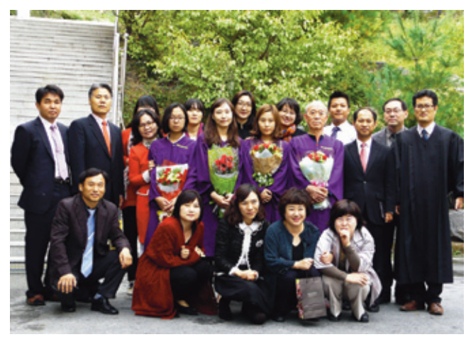
Newly baptized members at the Daejeon Sahmyook Middle School

ccording to the national scholastic assessment of 2013, Daejeon Sahmyook Middle School is now among the top 0.3% nationwide. Also, according to the scholastic assessment announced on February 2 of this year. Daeieon Sahmyook Middle School ranked 12th among 3,225 schools nationwide. The school's vision is to "foster globally creative and outstanding students" through proper Adventist education, character development, and academic growth. Above all, Daejeon Sahmyook Middle School promotes knowledge, ethics and physical development based on the verse "love your neighbors as yourself." The educational environment of the school is another one of its outstanding traits. For example, to create an atmosphere of comfort and happiness where students can feel at home, the school designed the classrooms and hallways like a house.