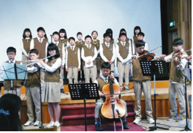
Students learn music and musical instruments at the school

ccording to the national scholastic assessment of 2013, Daejeon Sahmyook Middle School is now among the top 0.3% nationwide. Also, according to the scholastic assessment announced on February 2 of this year. Daeieon Sahmyook Middle School ranked 12th among 3,225 schools nationwide. The school's vision is to "foster globally creative and outstanding students" through proper Adventist education, character development, and academic growth. Above all, Daejeon Sahmyook Middle School promotes knowledge, ethics and physical development based on the verse "love your neighbors as yourself." The educational environment of the school is another one of its outstanding traits. For example, to create an atmosphere of comfort and happiness where students can feel at home, the school designed the classrooms and hallways like a house.