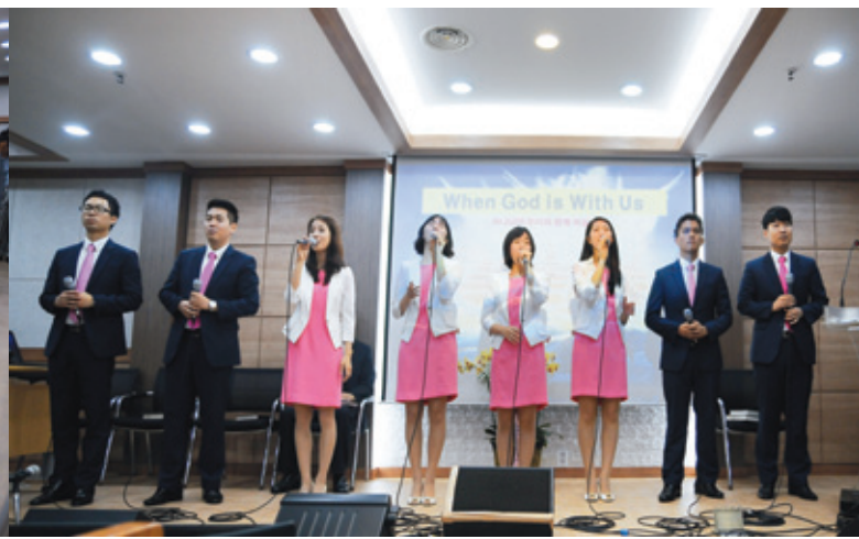
Golden Angels singing during the worship service