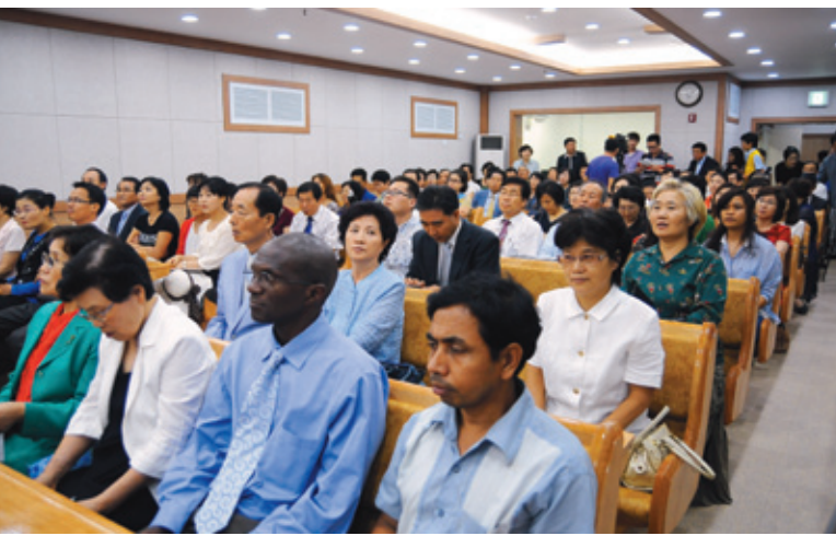
Many people attended the thanksgiving worship of the church renovation

Through this thanksgiving opening worship, we especially want to express our praise to the God of Ebenezer because He has led us by His grace. We seek in the future, through God's promise, "Though thy beginning was small, yet thy latter end should greatly increase." (Job 8:7), to expect the successful proclaiming and spreading of the Everlasting Gospel and the Three Angels Message to the foreigners who live in this land.