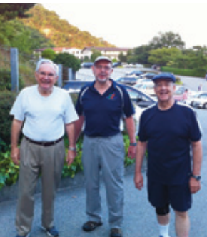
The three GC Health Directors

The participants came mainly from the Arinodai Church, Amanuma Church, Central Church, Okinawa Church, and Kyoto Church. We had members who joined us from educational institutions located in Hiroshima and Yokohama. Japan's San-iku Foods, and Nihon Kensei Kyoukai (a privately owned food factory) also sent their representatives to learn. We had good fellowship sharing how to bring our friends and neighbors to Jesus through the sharing of our health knowledge.