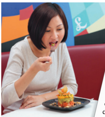
Healthy vegetarian food is offered at the cafeteria

An evangelistic meeting entitled "Exploring Your Health" will be held in November, 2013, by the Hong Kong Adventist Hospital. The Media Evangelism Limited, a local Christian media producing group, will share its newest discoveries of Noah's Ark. Famous singer and actress, Agnes Chiang, will also give her personal testimony. The evangelistic meeting aims to present the gospel message through the sharing of health topics.