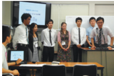
Foreign Youth group members