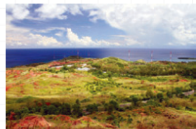
Beautiful terrain of Guam Island, US where AWR is located

The ceremony was held directly on the antenna field, at the base of the newest tower, which enabled attendees to experience close up the massive size of the broadcast equipment. They came away with a greater appreciation of the enormous effort that was required to complete the two-year project.