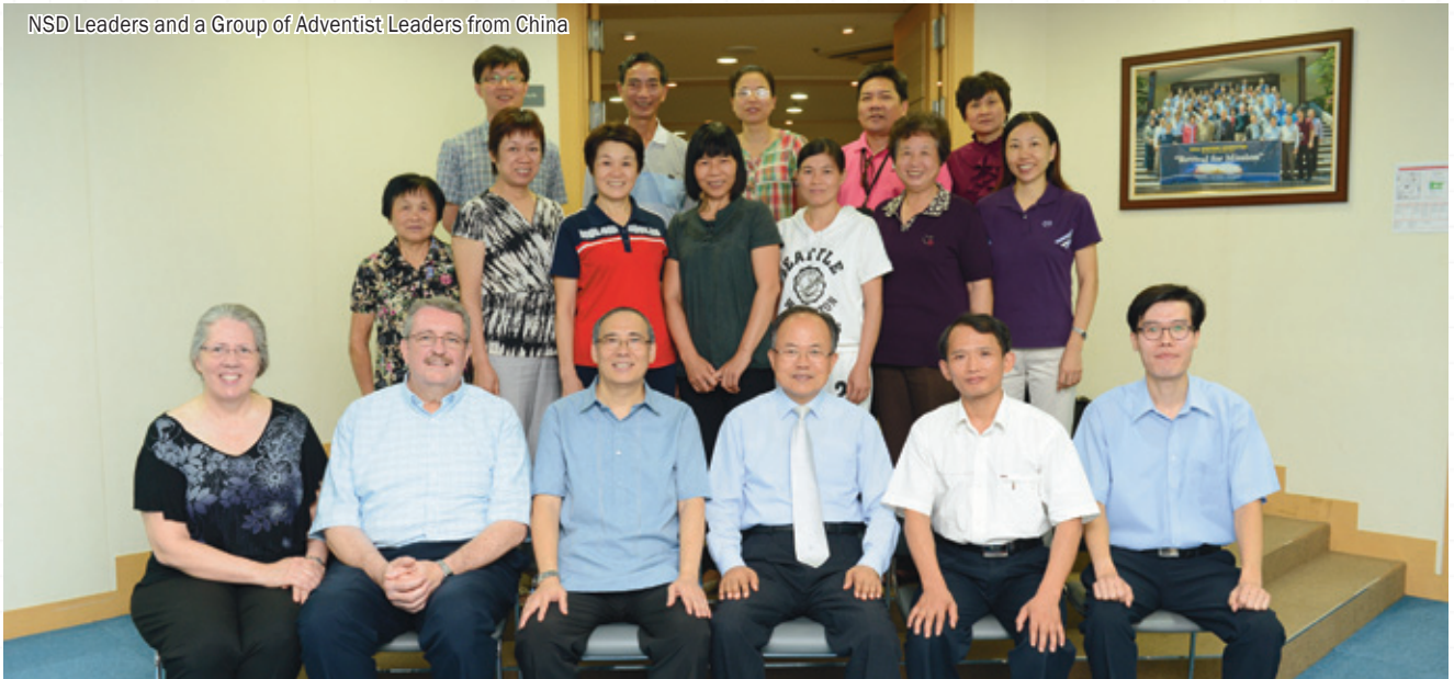
NSD Leaders and a Group of Adventist Leaders from China

A group of 12 Church leaders from China visited the Northern Asia-Pacific Division (NSD) office in Ilsan, Korea, on August 13, 2013. They came from various districts of the Fujian Province of China. For most of them it was their first time visiting Korea.