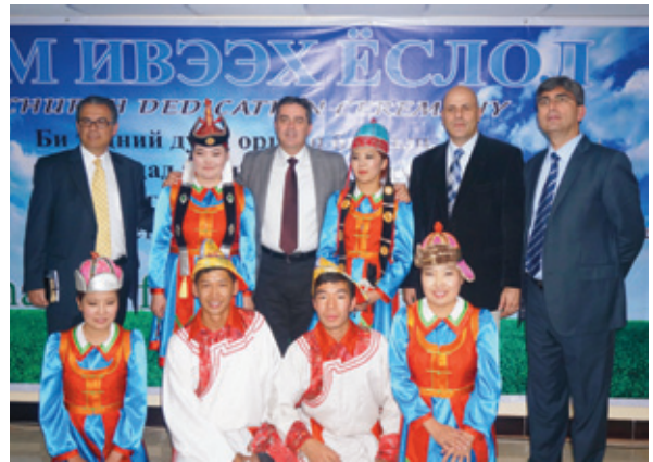
Three officers of SAD visited Mongolia after the IMC

SAD leaders decided to invest in Mongolia because they find the place a very challenging field, and