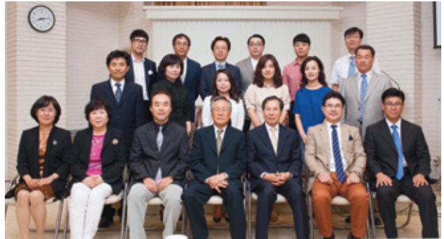
SDA Orchestra Association members