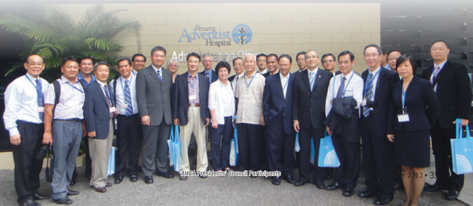
AHCA Presidents' Council Participants

AHCA is the umbrella organization over all the Adventist health-care institutions within the Northern Asia-Pacific Division. The purpose of the AHCA is to provide coordination, services, advice, and networking amongst the hospital administrators.