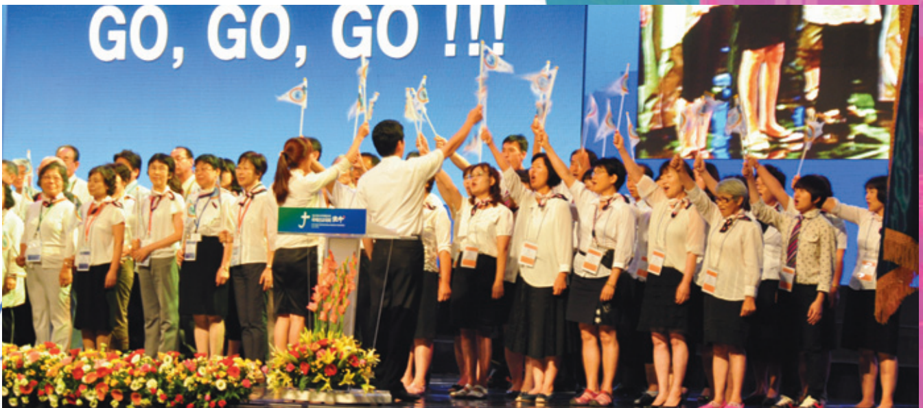
HisHands missionaries from each country shout the HisHands chant.

Every moment, we were strongly reminded of the gospel commission given by Jesus to all His followers. With united hearts, we talked about, we listened to, and we sincerely meditated upon the mission of the church. "I hope and pray that the fire of evangelism will explode in every corner of the NSD territory, and that the uncountable numbers of people in this region will be saved into the kingdom of God by the power of the Holy Spirit".