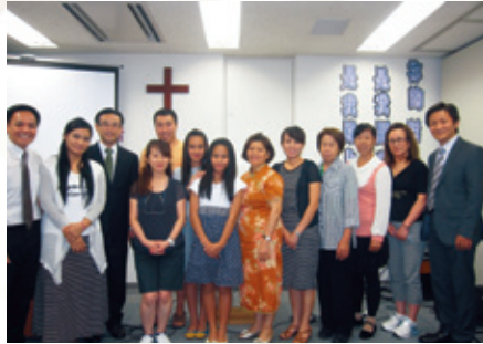
Tokyo Chinese Church members