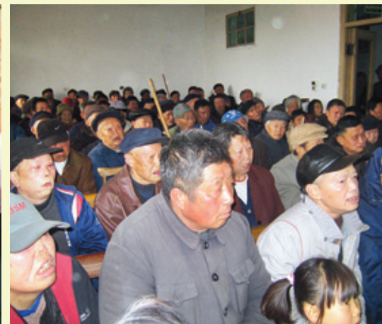
A worship service for lepers in China