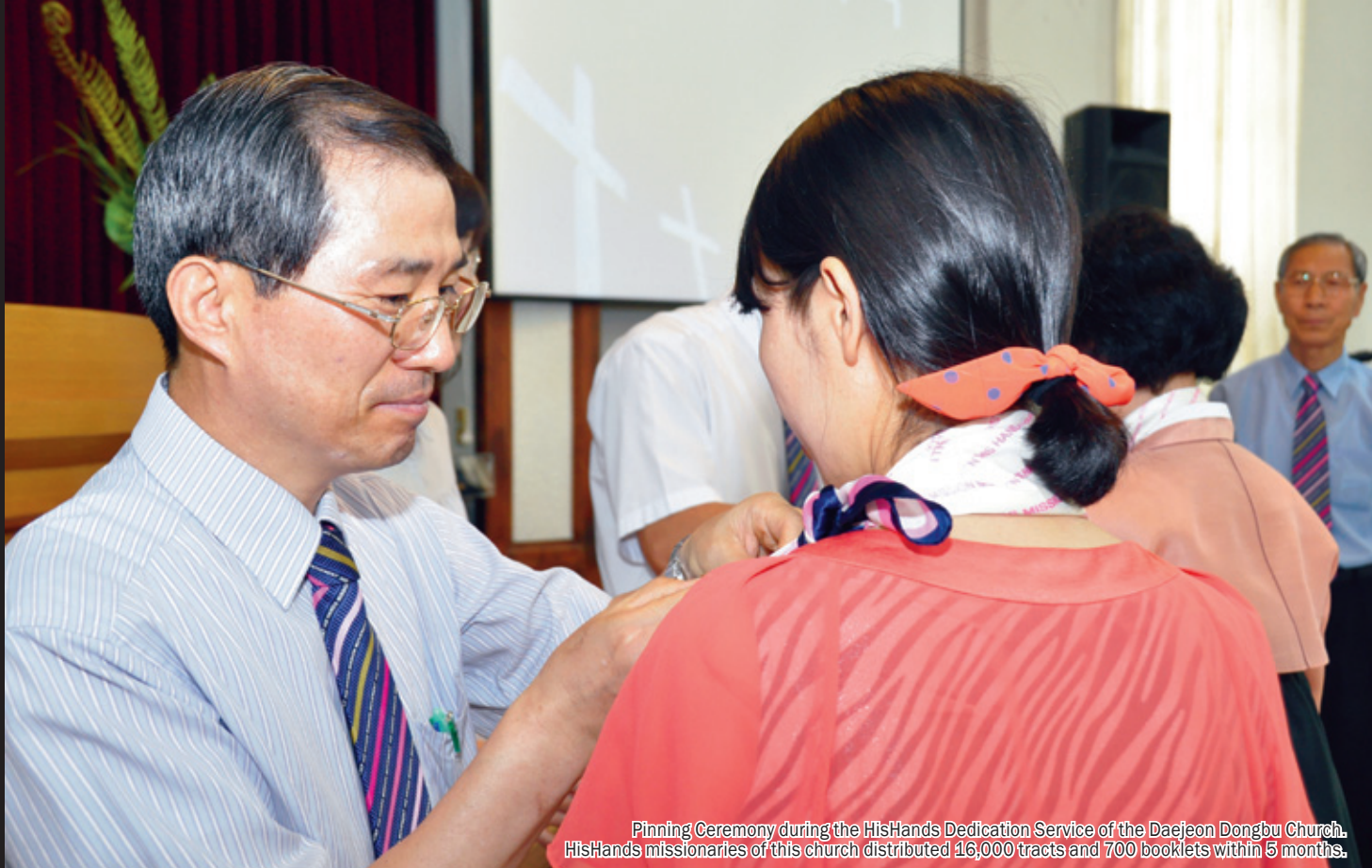
Pinning Ceremony during the HisHands Dedication Service of the Daejeon Dongbu Church. HisHands missionaries of this church distributed 16,000 tracts and 700 booklets within 5 months.