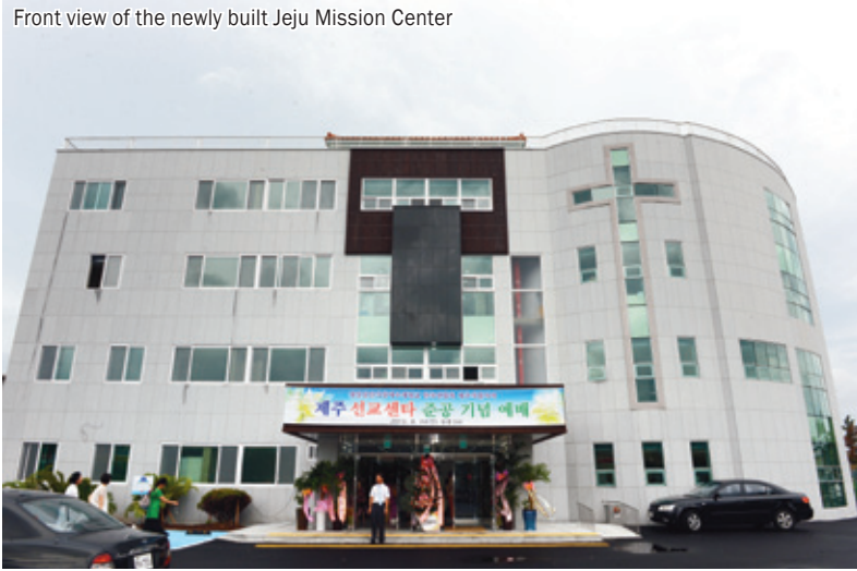
Front view of the newly built Jeju Mission Center

The Jeju Mission Center which was a long-cherished desire of Jeju Adventists finally opened its doors after a year of construction. The center has four floors above ground and one underground with various spaces, spending three billion one hundred million won. There is a dining room, and a pastor's house on the first floor, and the Jeju Attached Field office, and guest room on the second floor. The third floor has the Jeju Central Church, children's room, and Healing Center. The fourth floor includes guest rooms, and prayer rooms. About 300 church pastors, and members were present at the dedication service at the Jeju Central Church on August 24, 2013. "I hope this center will be the epicenter of unity, and mission in the Jeju area, so