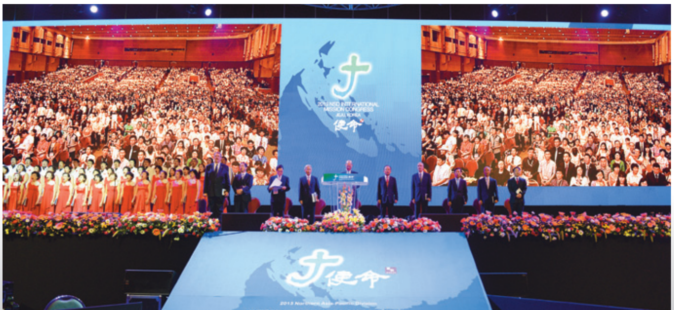
The main auditorium is filled with participants at the the Sabbath Divine Service.