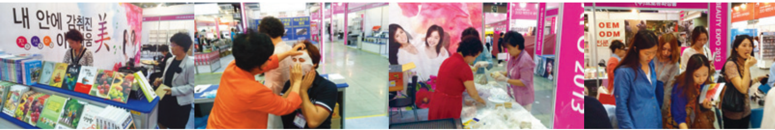
SDA Fair Mission booth