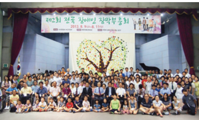
The 2nd Camp Meeting Participants

Korean Union Conference (KUC) Health Ministries and Relief Department held the Second Annual Campmeeting for People with Disabilities at the Madalpy Training Center from August 9 to 11, 2013. The 205 people, including Adventist members with disabilities and their families, gathered from all over Korea to build friendships, and to be united by the Word. A variety of meaningful programs such as Sand Art, musical performances, Sabbath School by disability types, messages, outdoor exploration, and campfire were prepared. Disabled and non-disabled members gained joy, and spiritual vitality by participating together in downhill, rafting, swimming, and archery. Besides the foundation for unification of Adventist members with disabilities, their spiritual revival was laid through network leadership meeting by disability types.