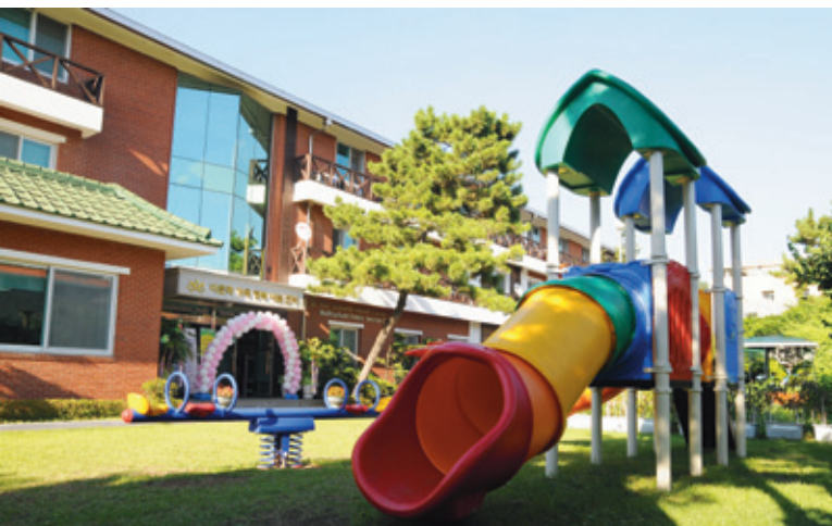
Foreground of the Center

Serving others should not be done only by using our speech, but we also must use our hands. We believe that sharing, even small things in our possession, will multiply the happiness we have. We will be putting more efforts into helping foreigners, and multi-cultural families. We hope that this MFSC will become a training place to mold us as lambs, such as those that appear in the parable of the lambs and the goats, when preparing for our Jesus’ advent (Matthew 25).