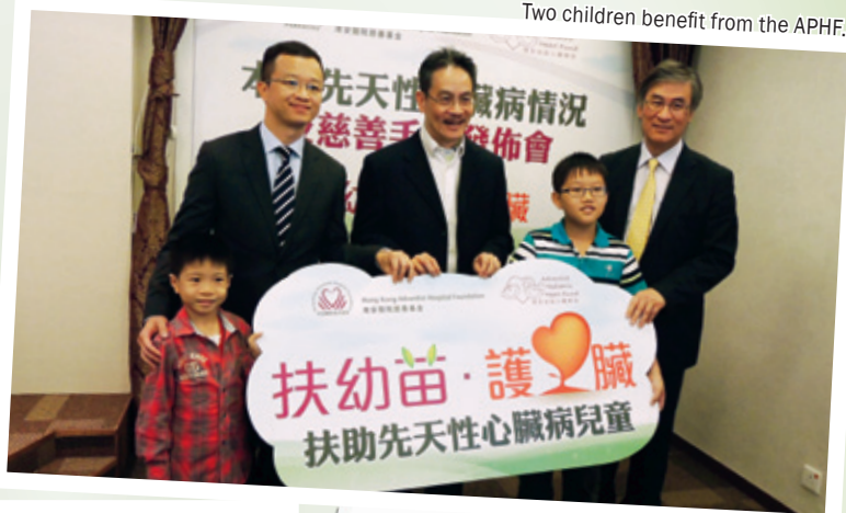
Two children benefit from the APHF.

The Hong Kong Adventist Hospital, in partnership with the International Self-care Foundation, and Sheenhok Charitable Foundation, held a press conference to promote the 2013 International Self-care Day, or ISF Day, on July 24, 2013. The Tsuen Wan Adventist Hospital also participated in this initiative offering free physical examinations to 100 elderly citizens. The goal was to educate the public about the importance of having healthy lifestyles, and how to prevent certain health risks such as obesity, cardio-vascular diseases, etc.