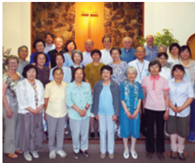
Kobe Group of the Health Conference