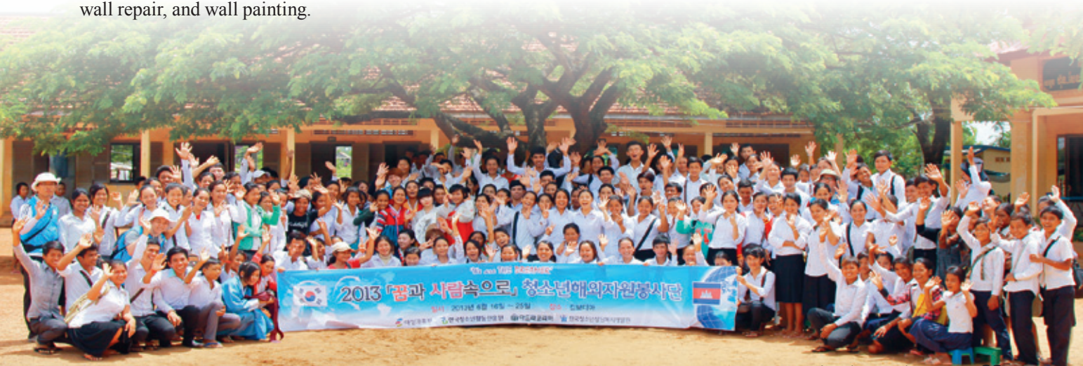
Korean Youth overseas voluntary teams with local school students

Under the slogan "Into the Dream and People", ADRA Korea sent two Korean youth overseas volunteer teams to Cambodia. From June 16 to 25, 2013, 16 young volunteers worked alongside local high school students, and participated in community services such as bathroom building, well sinking, and teeth-brushing education. It provided dropout adolescents, and teenagers at risk an opportunity to increase their sense of self-respect, and belonging. The other volunteer team, which consisted of disabled and non-disabled youth, socialized with Korean-major students in the Royal University of Phnom Penh. They also used their abilities visiting the Technique Academy for people with disabilities, conducted health education at XIA Evergreen School, and participated in library construction, fence repair, wall repair, and wall painting.