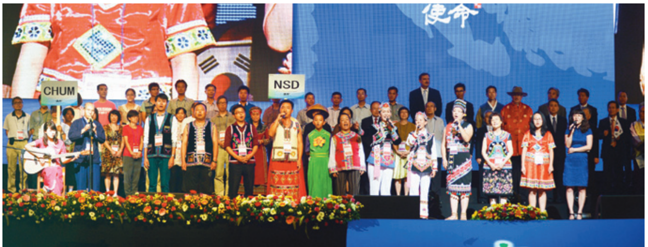
Delegates of each country dressed in their traditional costumes are standing on the stage in the opening ceremony.

The Congress concluded with a musical concert featuring groups from throughout the NSD territory. Participants were reminded of the harmony to be experienced, even in this world, as cultures blended beautifully, reflecting that we are one family sharing the same mission. The beautiful harmony of music ministries teams from each country such as Golden Angels, Voice of Praise Choir, and the Descendants, echoed through the Center.