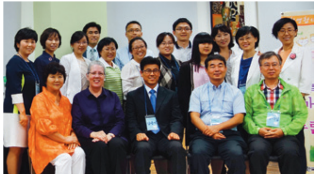
Women Pastors' Family Retreat participants

ministry focused on Family, Spirituality, and Church Administration.