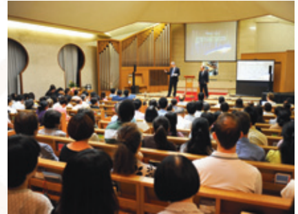
Tokyo Central Church during Tokyo13