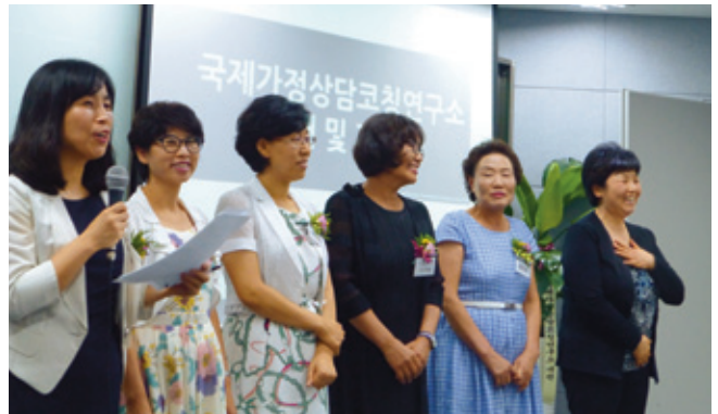
International Family Counseling Coaching Conference participants

The First Family Counseling Conference, run by a brand new department called the International Family Counseling Coaching Institute was held at Sahmyook University in Korea, from August 18 to 20, 2014. Spearheaded by the Women’s Ministries Department of the Korean Union Conference (KUC), in collaboration with Sahmyook University (SYU), this Institute will play an essential role in meeting the dire need for more trained counselors.