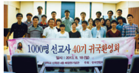
40th batch 1000MM missionaries