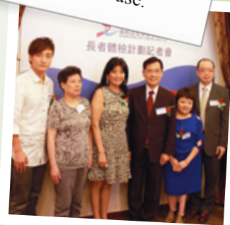
Alex Fong (left), famous singer and actor, is named the Ambassador of the 2013 International Self-care Day.

The Adventist Pediatric Heart Fund (APHF) held a press conference in mid-August, 2013, to educate the public about two kinds of congenital heart diseases: patent ductus arteriosus (PDA) and Tetralogy of Fallot (ToF). The Adventist Pediatric Heart Fund is one of the Charity Outreach programs of the "Hong Kong Adventist Hospital Foundation." It was set up in August, 2010, to continue the work of the Children's Heart Fund which had been established in 1991. Its aim is to provide life-saving treatments for underprivileged children suffering from congenital heart disease.