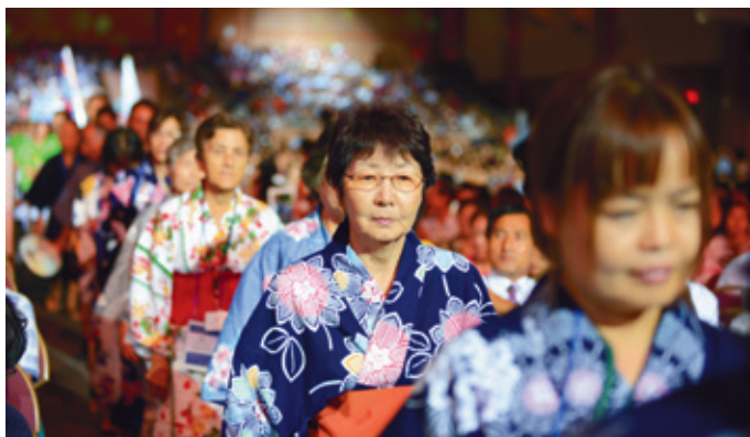
Participants from Japan march forward for parade