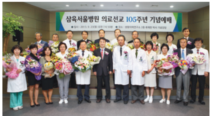
Employees who were honored for 30 years of service

He added, "The 110th anniversary is drawing closer. Let us go forward until we accomplish the vision of this hospital to meet the employees' and clients' needs."