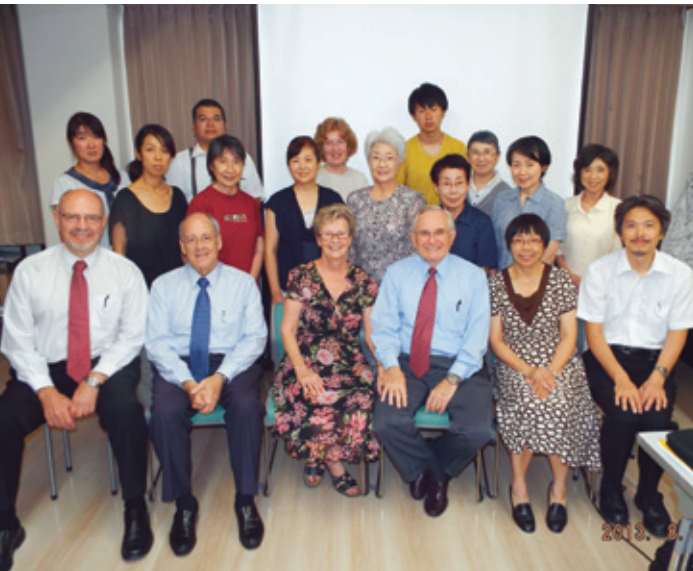
Tokyo Group of the Health Conference