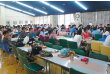
JUC 11th Youth Congress participants