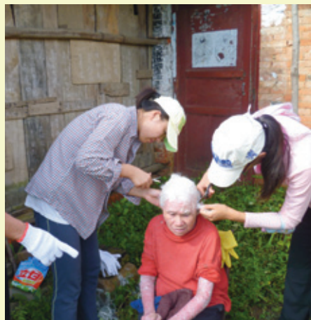
Volunteers giving haircuts to a leper