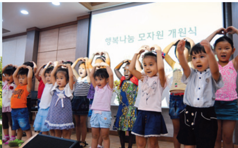
Children sing during the opening ceremony of the center