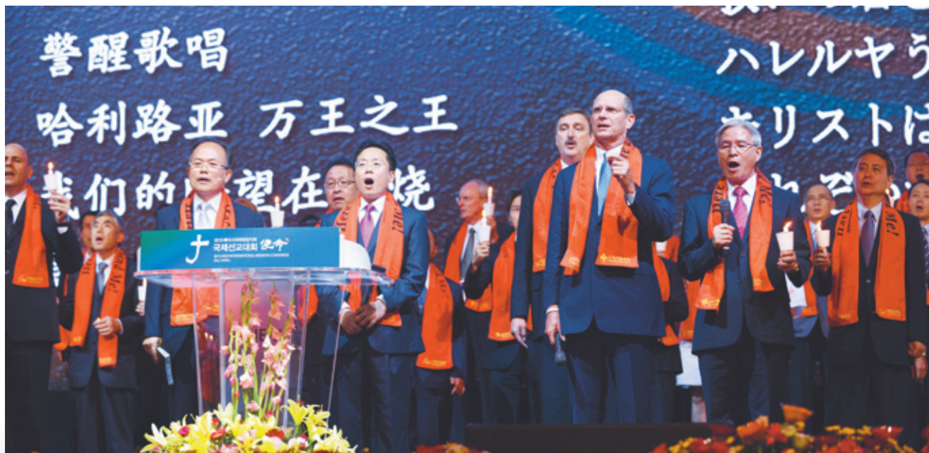
Adventist church leaders from the GC, NSD and Union Conferences hold candles as they sing songs of dedication to God