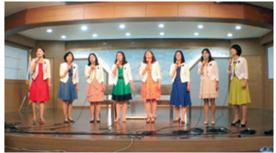
Pastoral Spouses from the YoungDong South district

EN – to be like a jade ball on a silver plate GA – to touch the souls of the poor with our hands and voices BI – following our Lord's incomparable heart