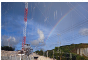
Rainbow over the Antennas of AWR