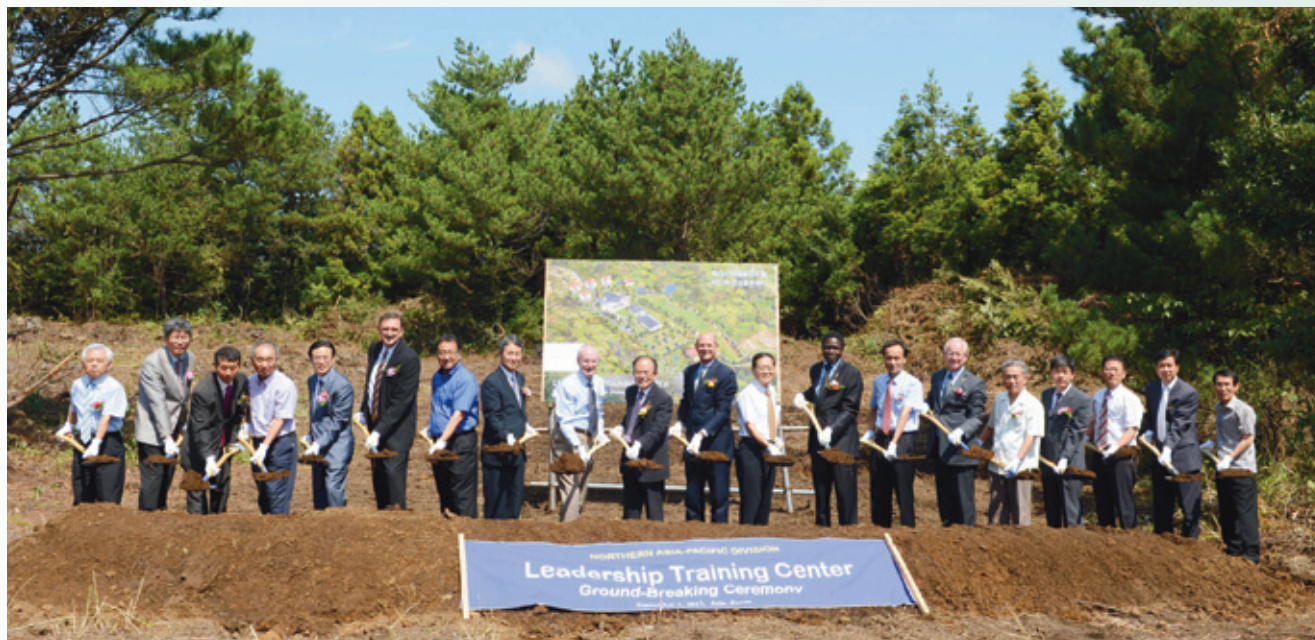
Adventist Church leaders of GC, NSD and Jeju Island standing for the ground breaking ceremony of the NSD Leadership Training Center