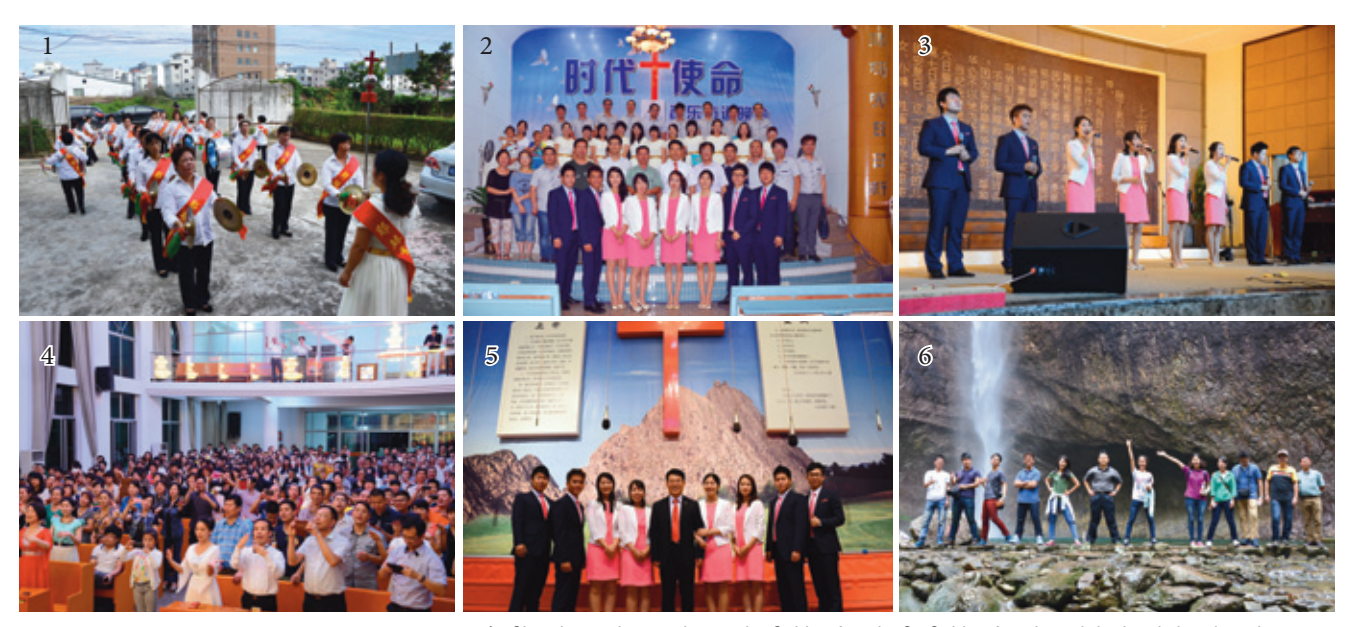
1: Church members welcome the Golden Angels, 2: Golden Angels and the local church praise team, 3: The Golden Angles praising at a church in Wen Zhou, 4: Church members participate in praise worship, 5: The Golden Angles, 6: Retreat after the Golden Angles mission