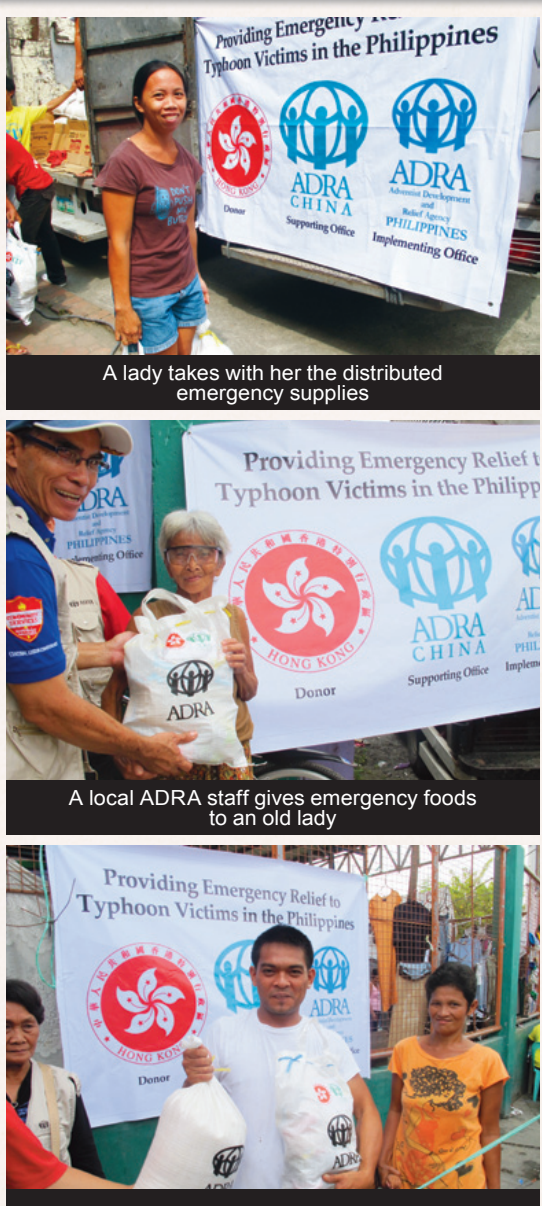
Food packs were successfully distributed

collaboration with ADRA Philippines and their partners, the Social Welfare and Development Office of the Philippines government. Other SDA institutions, including the North Philippine Union Conference, Central Luzon Conference, and Adventist Community