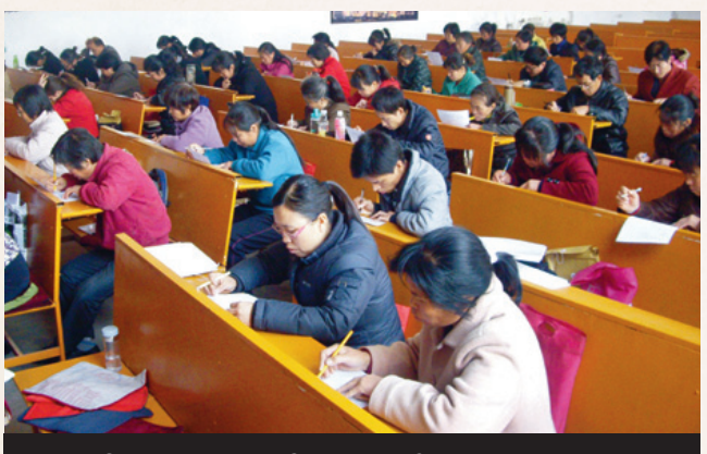
Griggs University Students in China attend class

spoken by the biggest population in the world;