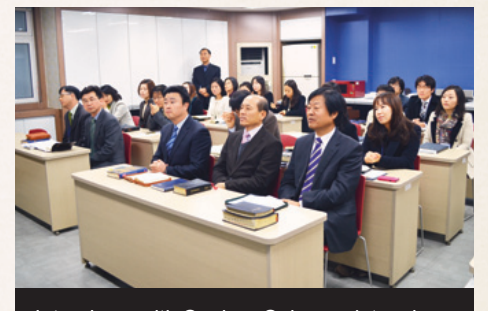
Interviews with Seohae Sahmyook teachers