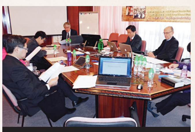
Advisory participants discuss some of the major issues