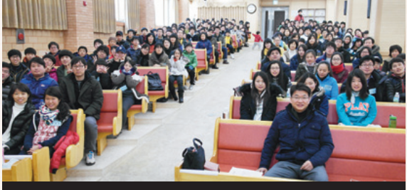
The venue was packed with many young people