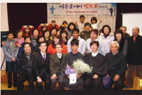
A group picture of the baptismal ceremony