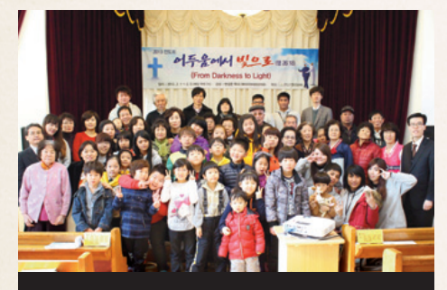
Dali-Jeongsun Evangelistic Series participants

D uring the winter, from January 31 to February 6, 2013, the youth members of the Dali Church in Taiwan took a trip to Jeongseon, Korea to hold evangelistic meetings. The group from Dali was composed of 13 young people who had been baptized by Pioneer Missionary Movement (PMM) missionaries (except for one person). They were people to be cared for by the missionaries and became missionaries themselves. Before this evangelistic meeting, they had received missionary training from the PMM pastors.