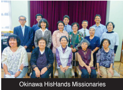
Okinawa HisHands Missionaries