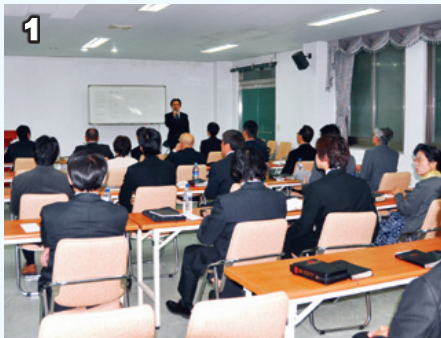
1. Spiritual Training of Japanese Pastors