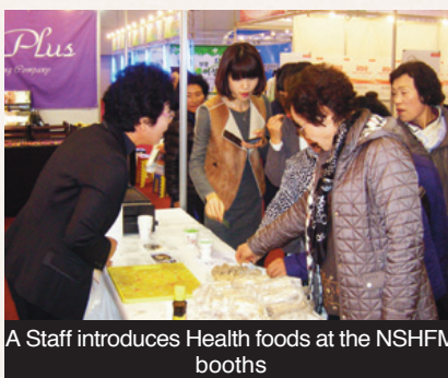
A Staff introduces Health foods at the NSHFM booths