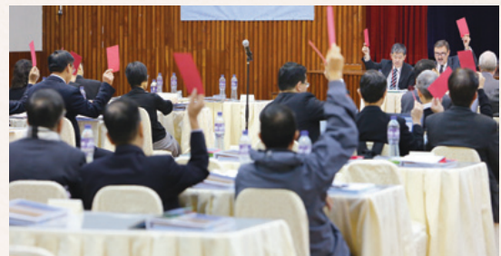
Participants vote during the Session