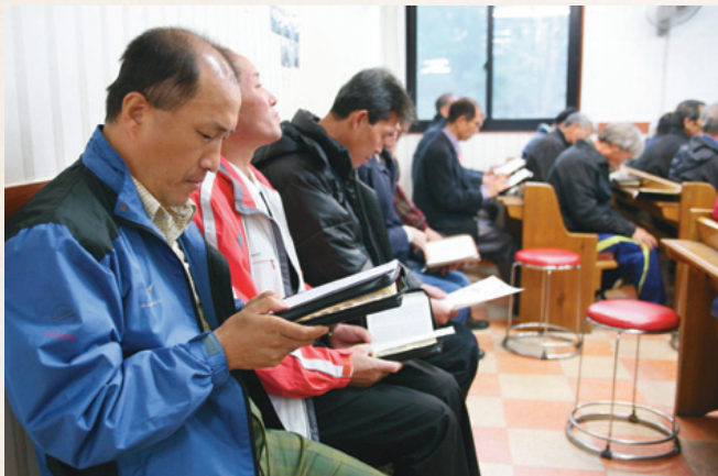
New Members attend the Church worship through Homeless project