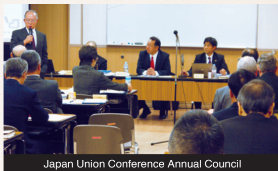
Japan Union Conference Annual Council