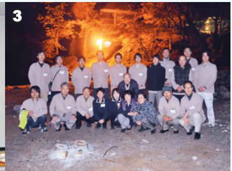
3. Group picture of EJC participants

Through this program, the Holy Spirit has taught me how great the love and the grace of God is, and how the cross of Jesus is trying to lead me to the hope of salvation.