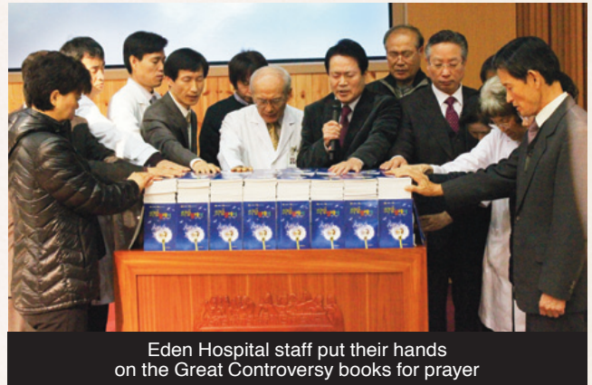
Eden Hospital staff put their hands on the Great Controversy books for prayer

After worship, the participants went door-to-door to distribute booklets. They worked together to send 1,200 of the booklets, ‘Relay of Hope’, by mail. ‘Relay of Hope’ is the abridged version of ‘The Great Controversy.’ They then went by twos and threes, handing out ‘Relay of Hope’ to people in the community. They visited stores, institutions, and even a remote mountain village. The total number of people the books were distributed to was 5,400. Up to this point, they