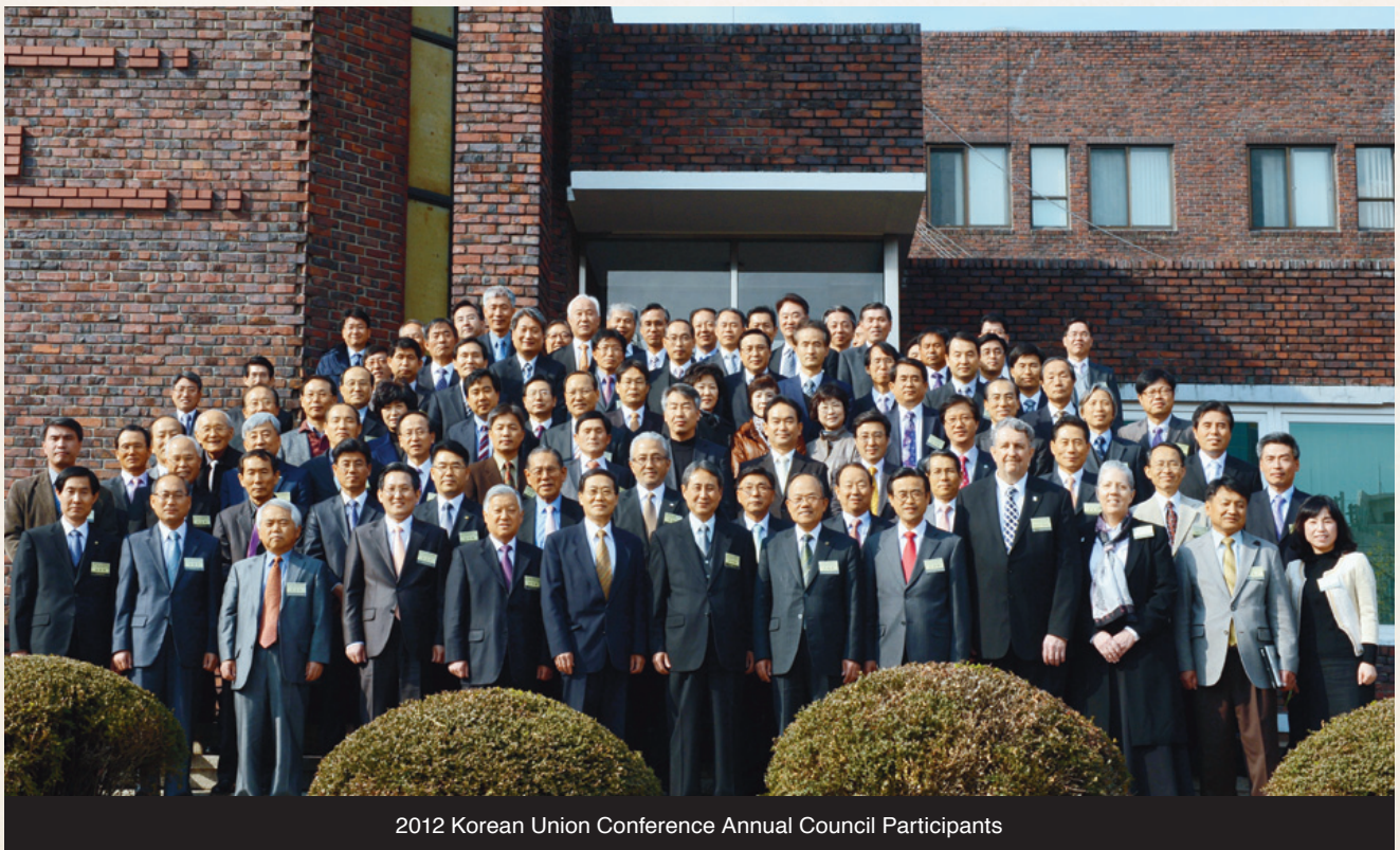
2012 Korean Union Conference Annual Council Participants

The KUC will follow the Great Controversy Project consistently by producing three million abridged editions, and fifty thousand complete editions.