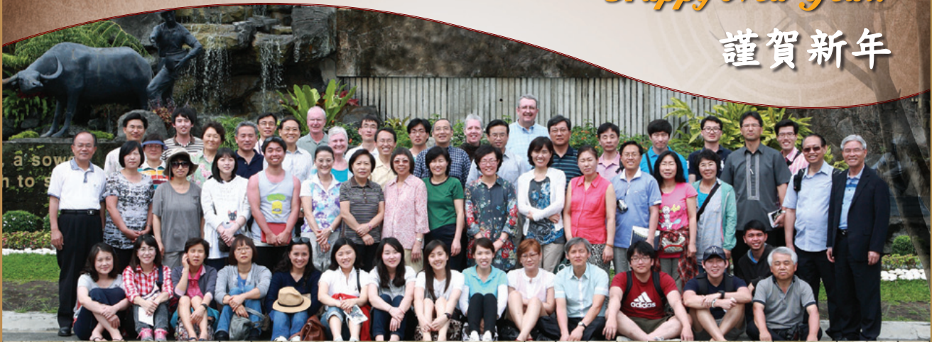
Northern Asia-Pacific Division Staff and Families