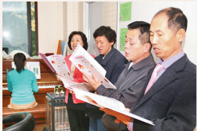
Love Church members sing hymns during worship

The "Love Church" was specially made for homeless people by the Minlak Church in Uijeongbu. Here is the background on the beginning of this special church.