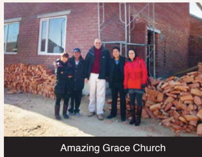
Amazing Grace Church

On October 13, 2012, the MMF officers conducted an inauguration ceremony, and organization of the Munkhiin Geree SDA Church located in the Ovorkhangai Province.