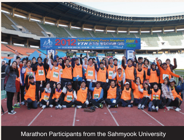
Marathon Participants from the Sahmyook University