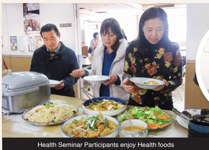
Health Seminar Participants enjoy Health foods