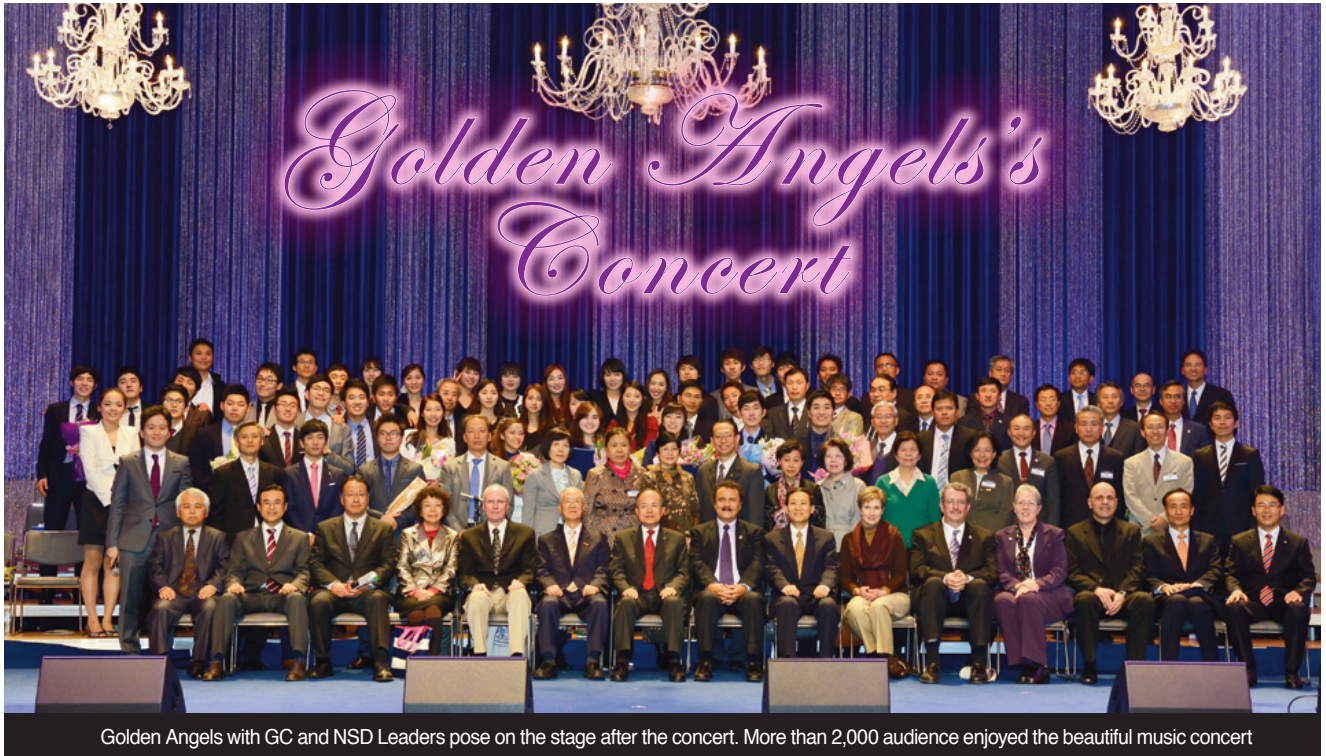
Golden Angels with GC and NSD Leaders pose on the stage after the concert. More than 2,000 audience enjoyed the beautiful music concert

On November 4, 2012, the Golden Angels, a group of singing missionaries from the Northern Asia-Pacific Division (NSD), held a mission concert at Sahmyook University, Korea. There were more than 2,000 people in attendance at the concert.