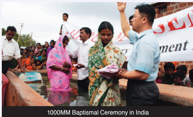
1000MM Baptismal Ceremony in India