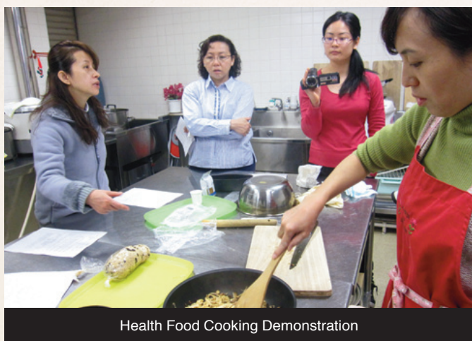
Health Food Cooking Demonstration

A Health Evangelism Seminar was held on November 22-24, 2012. This seminar was a follow-up to the health seminar held at the Japan-Chinese Church in Tachikawa on April 14, 2012. The theme was “Health: the Never Ending Subject.” Each day started with a cooking demonstration followed by two lectures in the church. After lunch came practical classes such as hydrotherapy, use of charcoal, and home remedies for burns, scalds, coughs and soft tissue injury.