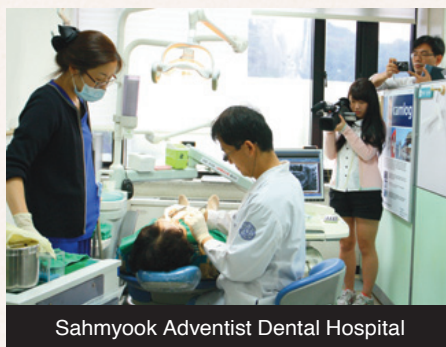
Sahmyook Adventist Dental Hospital