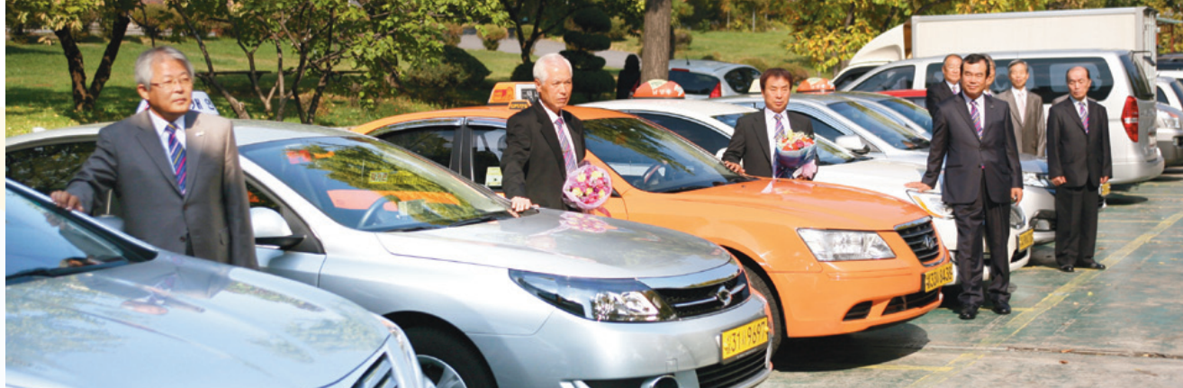
Nine Taxi drivers newly joined the HisHands Mission Movement as Missionaries

On Tuesday, October 30, 2012, there was a His Hands Missionary Movement (HHMM) missionary dedication ceremony in the auditorium of the Korean Union Conference (KUC). The missionaries who applied for HHMM at this time were all taxi drivers who have passion for Christ.