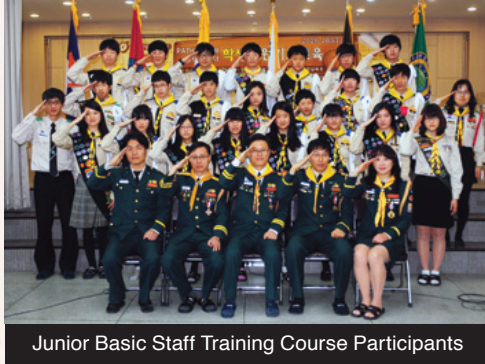
Junior Basic Staff Training Course Participants

The JBSTC is the Korean version of Teen Leadership Training (TLT) which was created by the General Conference (GC) for teenagers. The JBSTC has changed