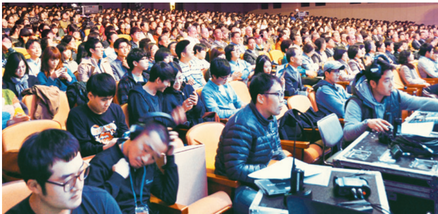
More than 2000 audience enjoyed the concert