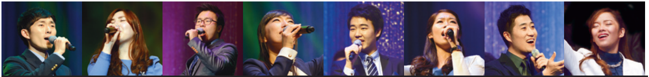
Members of Golden Angels 9