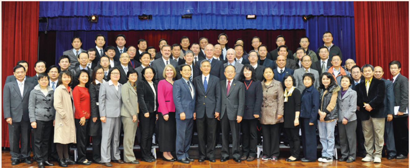
2012 Chinese Union Mission Special Session Participants