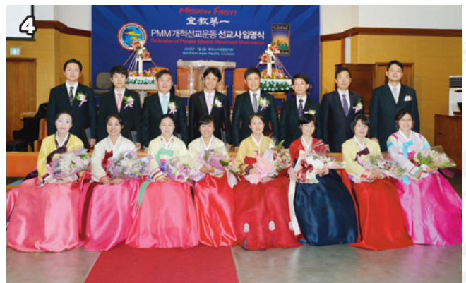
1. 11th Batch PMM Missionaries during the Ceremony 3. GC & NSD Leaders pray for the Missionary couples