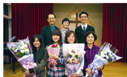
Newly baptized members of Xintien Church, Taiwan