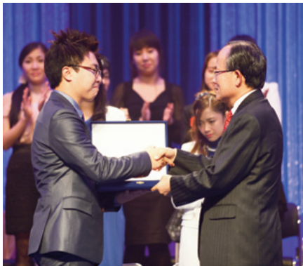
NSD President gives Appreciation Plaque to GA Member