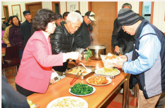
Love Church provides foods for Homeless people