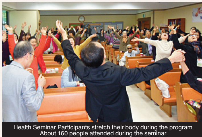
Health Seminar Participants stretch their body during the program. About 160 people attended during the seminar.