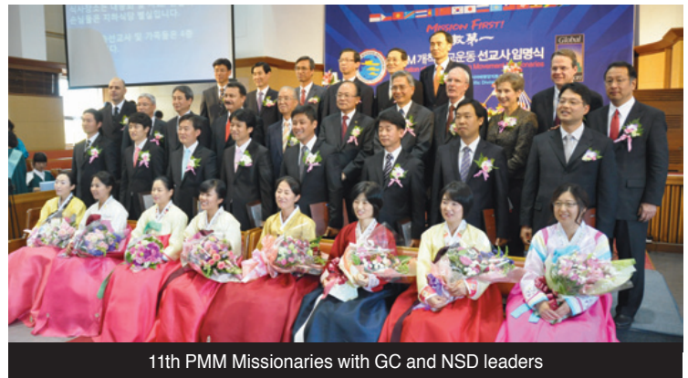
11th PMM Missionaries with GC and NSD leaders