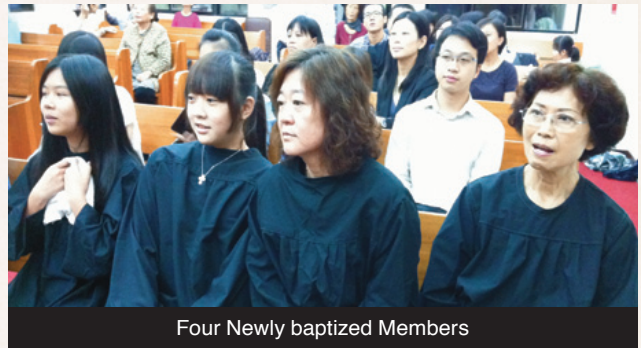
Four Newly baptized Members

member or a friend. While we struggle with the attacks of Satan on our homes, we can surely trust that if we believe in Him, God will lead us to the ideal home of all homes—the new heaven and new earth. These topics were well received as the approach to evangelism was new to them.