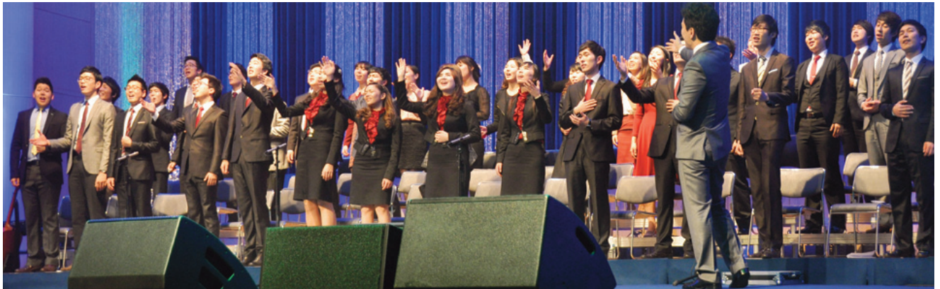
Golden Angels with their OB members praise God with a beautiful voice