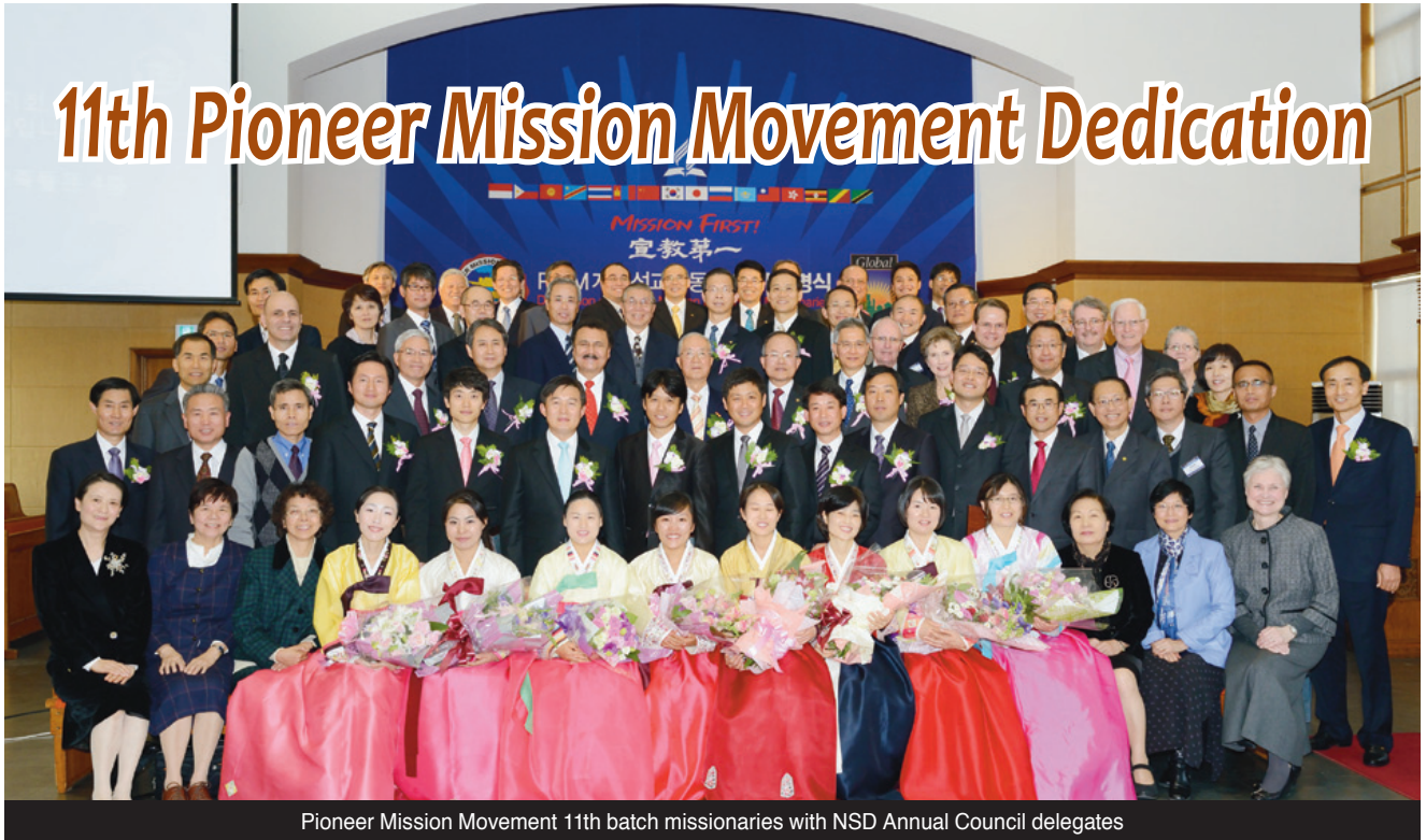
Pioneer Mission Movement 11th batch missionaries with NSD Annual Council delegates

On November 3, the Northern Asia-Pacific Division (NSD) held a dispatching and dedication service for the Pioneer Mission Movements (PMM) 11th batch of missionaries at the Seoul Central Church.