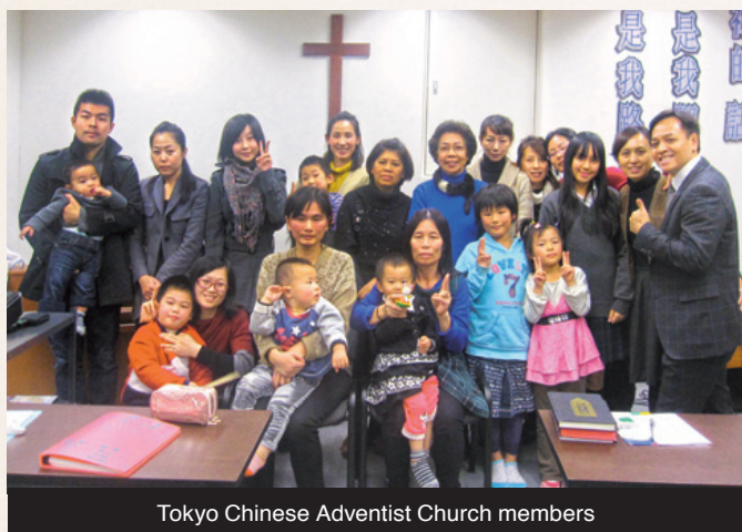
Tokyo Chinese Adventist Church members