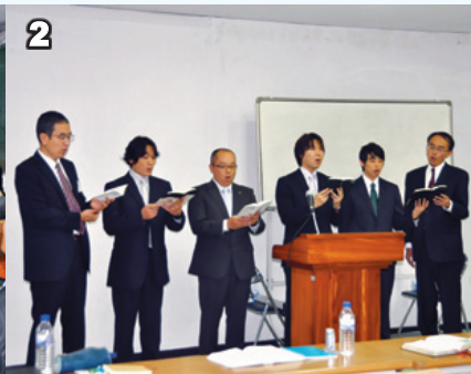
2. EJC Pastors sing Special Music