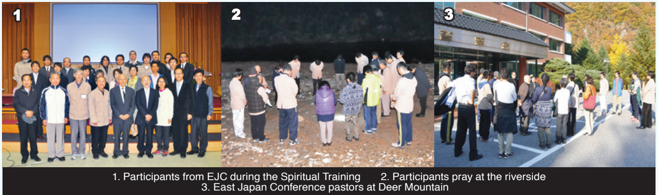
1. Participants from EJC during the Spiritual Training 2. Participants pray at the riverside 3. East Japan Conference pastors at Deer Mountain

I had attended a revival program in Korea from October 21 through 29, 2012. While there, each of the participants were given plenty of time in the mornings and in the afternoons to pray quietly, to read the Bible and the Spirit of Prophecy books, then meditate.