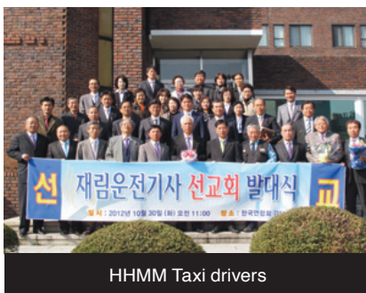
HHMM Taxi drivers