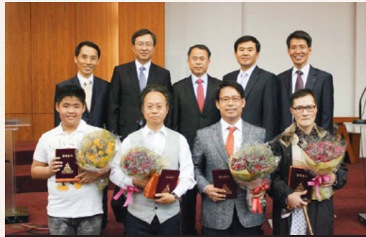
Church pastors pose with Newly baptized members

The last Sabbath of the Festival, Golden Angels 9 gave a special concert for the people. During Sabbath