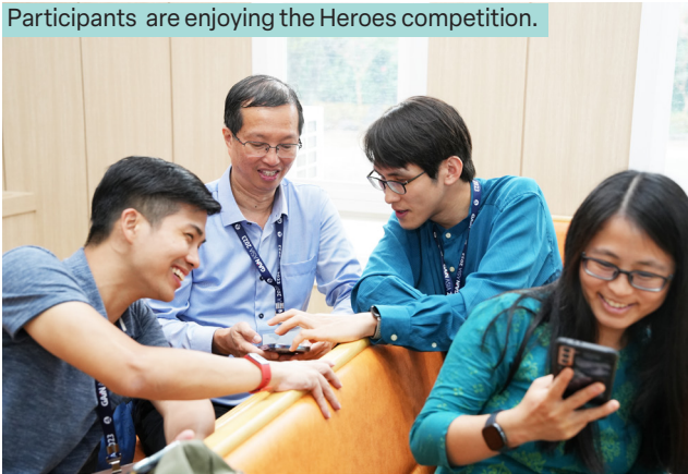
Participants are enjoying the Heroes competition.